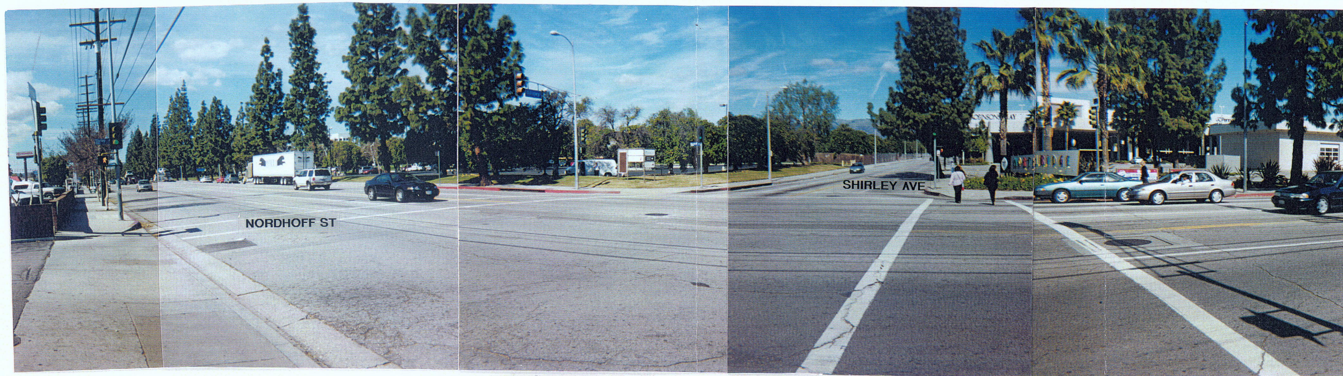
PROJECT SITE - NORTHWEST CORNER OF NORDHOFF ST & SHIRLEY AVE