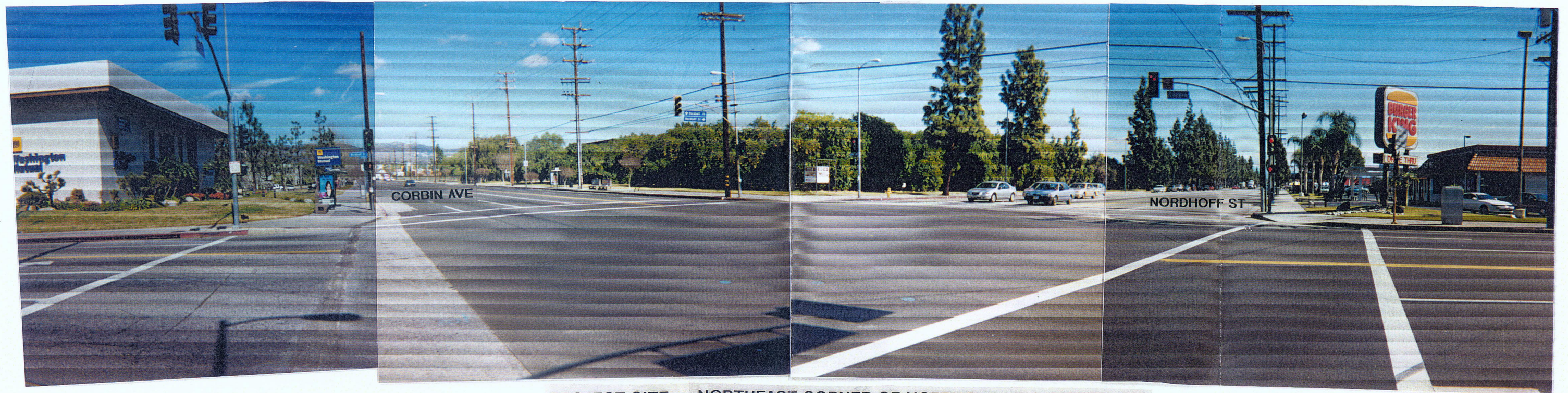
PROJECT SITE - NORTHEAST CORNER OF NORDHOFF ST & CORBIN AVE