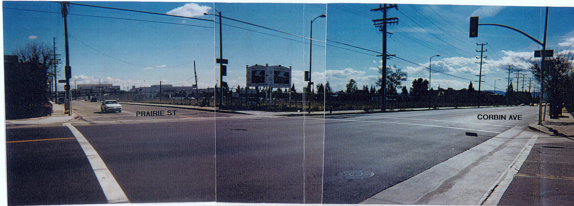
PROJECT SITE - SOUTHEAST CORNER OF CORBIN AVE & PRAIRIE ST