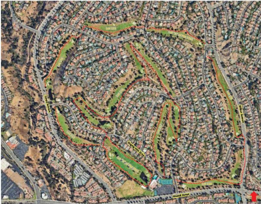
Mobile Beverage Cart Route