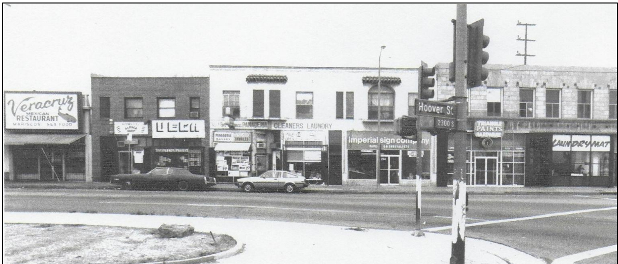
1993 Hoover Union Streetscape