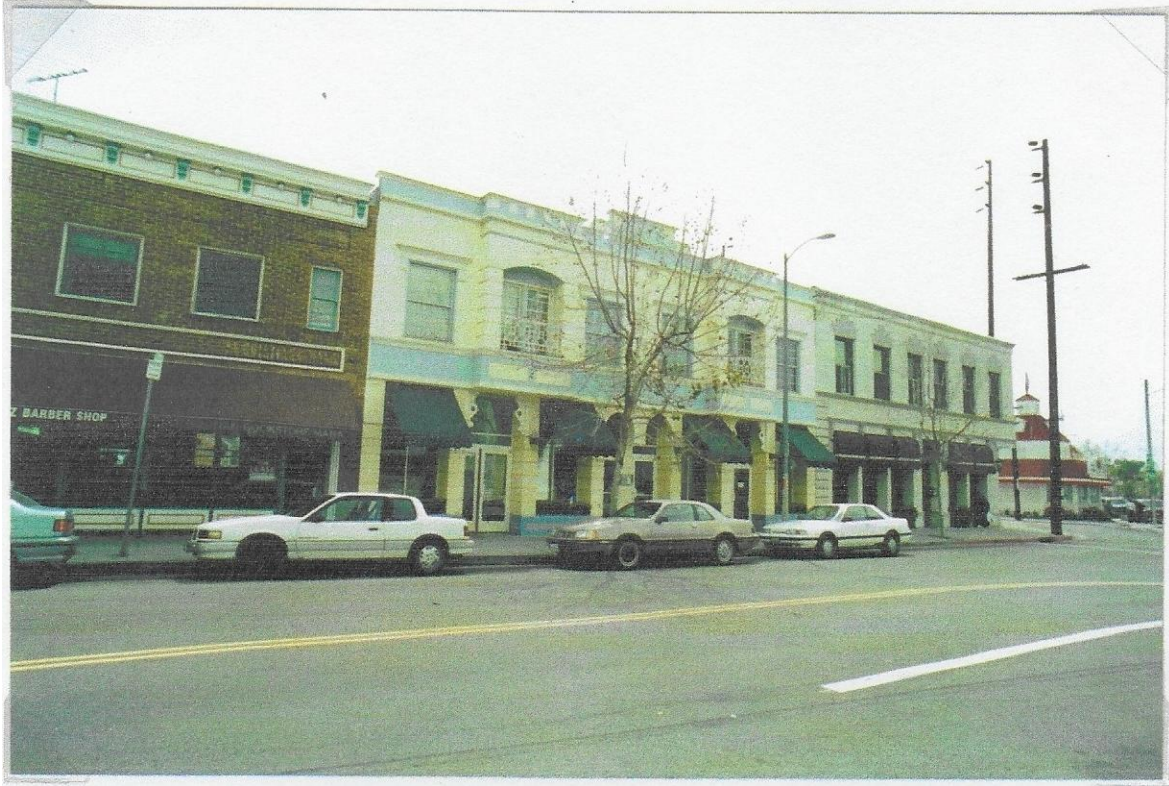
CRA Grant Façade 1999 “Victorian Village”