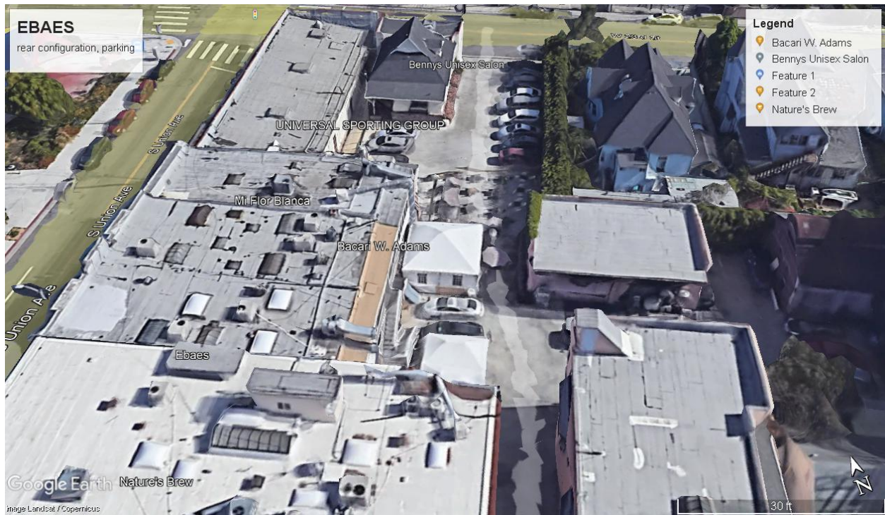
Rear Current Parking occupied by outdoor dining tents