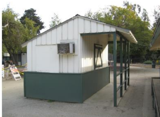
Figure 18: Pony Rides Ticket Kiosk, c.1946. View NW. Photo: ICF Jones & Stokes, March 2008.

Due immediately east of this canopy is an oval-shaped pony track with wood plank fences. Due immediately west of the waiting canopy is a small, square-plan, single-story ticket kiosk with an asymmetrical, side-gabled roof (Figure 18).