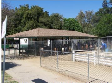
Figure 17: Pony Rides, 1946. View N. Photo: ICF Jones & Stokes, August 2007

Due immediately east of this canopy is an oval-shaped pony track with wood plank fences. Due immediately west of the waiting canopy is a small, square-plan, single-story ticket kiosk with an asymmetrical, side-gabled roof (Figure 18).