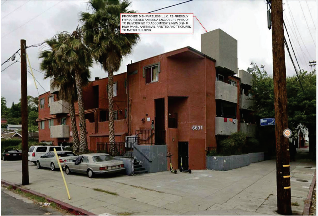
PROPOSED LOOKING NORTHWEST

To request a reasonable accommodation, such as translation or interpretation, please email and/or call the assigned planner or email per.planning@lacity.org a minimum of 3 days (72 hours) prior to the public hearing. Be sure to identify the language you need English to be translated into and indicate if the request is for oral interpretation or written translation services. If translation of a written document is requested, please include the document to be translated as an attachment to your email.