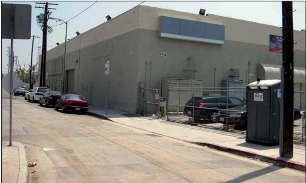
Photo A - View of the east side of the building to be demolished.