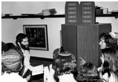
American Jewish University, 1970

To review the entire document, click here .