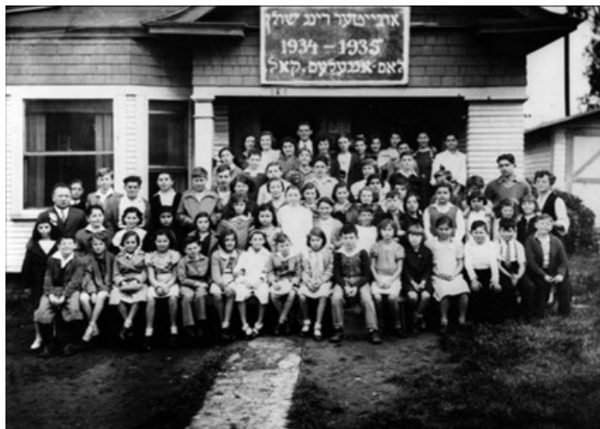
Workmen's Circle School, Boyle Heights, 1935

Following a broad historical overview on settlement and development patterns of Los Angeles Jewry, the context focuses on key themes and geographic areas that help yield an understanding of the historic resources associated with the