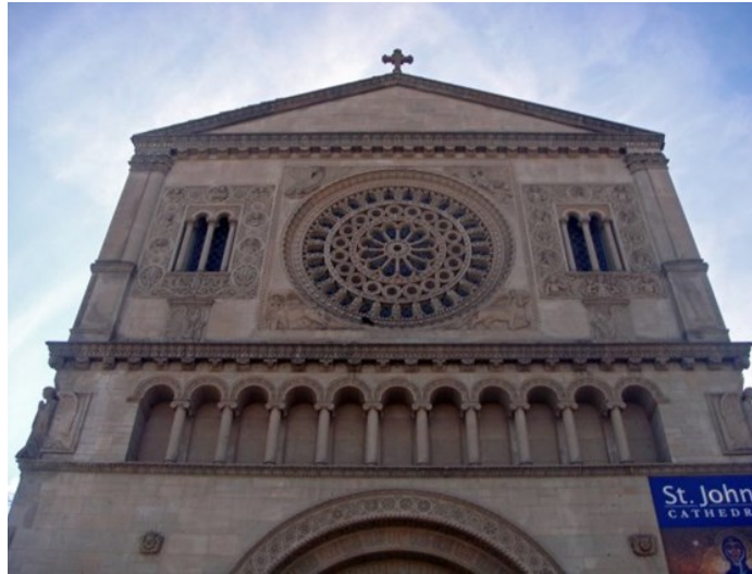
St. John's Cathedral

The registration fee ($30 by October 14, or $35 at the door) covers all conference activities, including morning refreshments, lunch, and your choice of walking