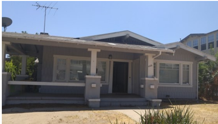
Front view of Disney house