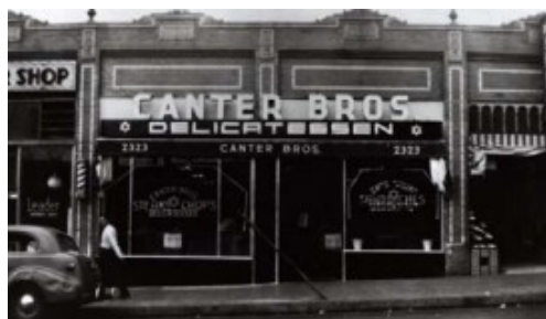
Canter Brothers Delicatessen, Boyle Heights, 1939

Office of Historic Resources Department of City Planning 200 N. Spring Street, Room 559 Los Angeles, CA 90012 (213) 978-1200