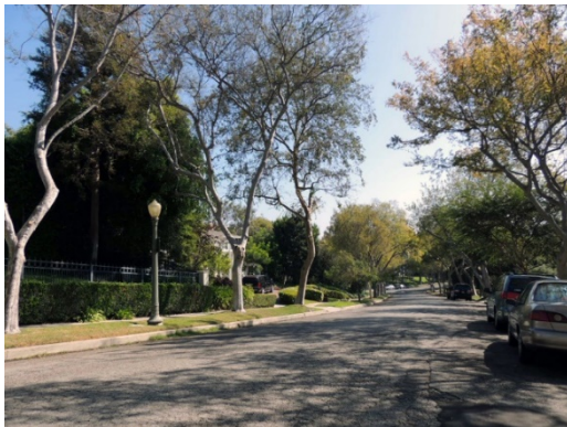
District: Holmby Westwood Residential Historic District

The Holmby Westwood Residential Historic District is located just below Sunset Boulevard, between the campus of UCLA on the west and the Los Angeles Country Club on the east. The district contains 1,044 properties and is almost exclusively single-family residential in its development, save for an elementary school, a fire station, a temple, and a church. Original residences date from the late 1920s through the 1950s, with approximately half of residences from this period exhibiting the American Colonial Revival or Spanish Colonial Revival style. Other represented styles include Tudor Revival, Monterey Revival, Mediterranean Revival, French Norman Revival, and Neoclassical; as well as more modern styles, such as Minimal Traditional, Ranch, and Mid-Century Modern. Neighborhood features include curvilinear streets which follow the area's natural topography, concrete curbs and sidewalks, landscaped parkways with mature street trees, and period streetlights. This historic district was also identified as a cohesive collection of predominantly Period Revival residential architecture. 27