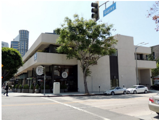
Address: 1101 S. Gayley Avenue Name: Gayley Center Architect: Krisel-Shapiro & Assoc. Date: 1979

This Context/Theme was used to evaluate significant examples of Late Modern architecture in Westwood. Identified examples are primarily commercial and institutional, including office buildings and religious buildings. Several noted architects are representing among identified examples, including A. Quincy Jones, Edward O. Anderson, Krisel-Shapiro & Associates, and Welton Becket.