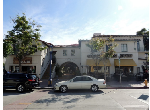
Address: 1001 S. Broxton Avenue Name: El Paseo Architect: Norstrom & Anderson Date: 1931