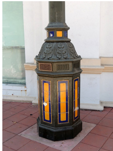
Location: Westwood Boulevard and Kinross Avenue