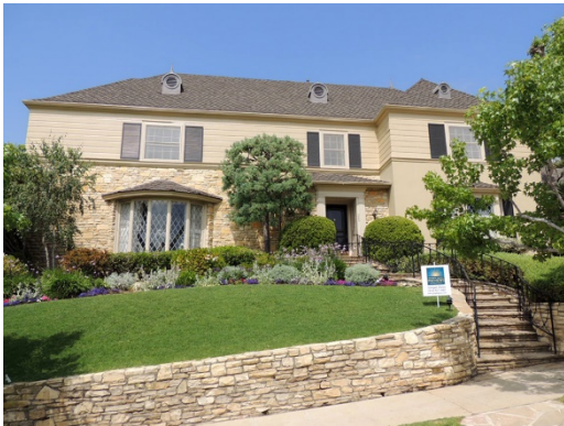
Address: 243 S. Tilden Avenue Date: 1936