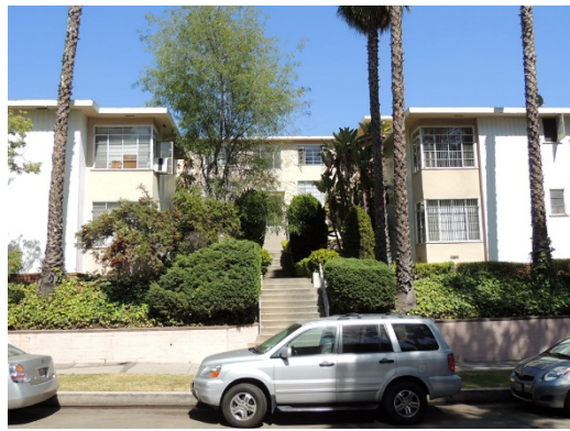
Address: 670 S. Kelton Avenue Date: 1951