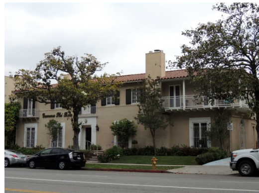
Address: 616 S. Hilgard Avenue Name: Gamma Phi Beta Sorority House Date: 1929