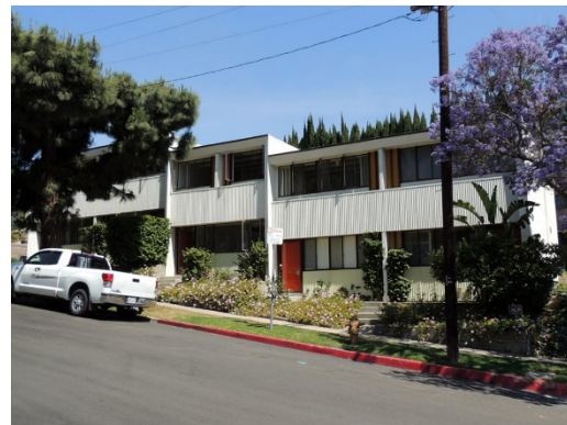
Address: 10338 W. Wilkins Avenue Date: 1952