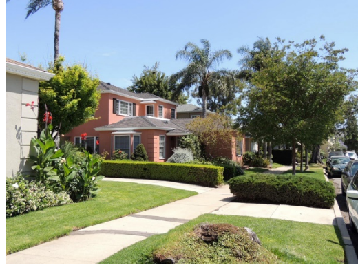
District: Devon-Ashton Apartment Historic District Description: Context view