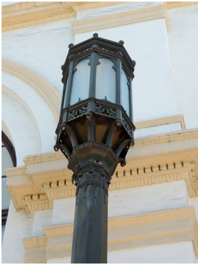
Location: Westwood Boulevard and Kinross Avenue

This Context/Theme was used to evaluate what appears to be the only extant example of the ornamental streetlights that were installed throughout Westwood Village in the late 1920s. Designed specifically for Westwood, these streetlights (called “lightoliers” during this period) displayed blue and gold tiles on the base, referencing the colors of UCLA. Situated prominently on Westwood Boulevard, just off the sidewalk, this remnant streetlight appears to have been moved to its current location.