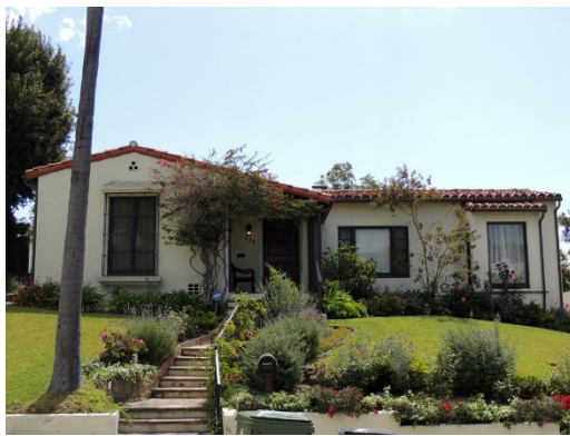
Address: 234 S. Tavistock Avenue Date: 1930