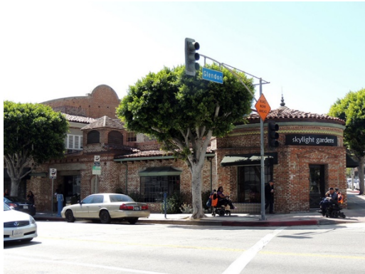
Address: 1139 S. Glendon Avenue Name: La Ronda de las Estrellas Architect: Conway & Wilson Date: 1933