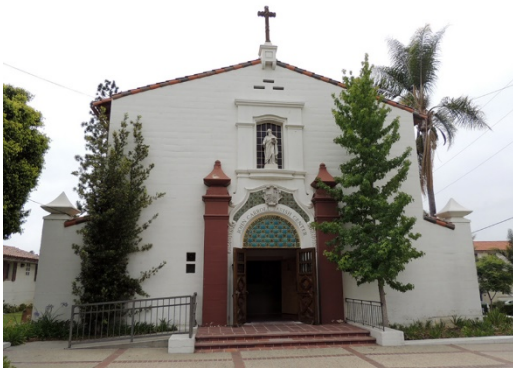
Address: 10750 Ohio Avenue Name: St. Paul the Apostle, Original Chapel Architect: Newton & Murray Date: 1932

This Context/Theme was used to evaluate significant examples of religious properties in Westwood. Among the identified examples is the religious campus of St. Paul the Apostle Catholic Parish, which includes the original chapel, the main church building, a rectory, and a school. St. Paul the Apostle was also evaluated as an intact collection of Spanish Colonial Revival institutional architecture. Additional examples of religious properties, including churches and temples, were evaluated for their architectural merit.