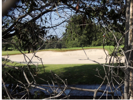
Address: 10101 Wilshire Boulevard Name: Los Angeles Country Club Date: 1911