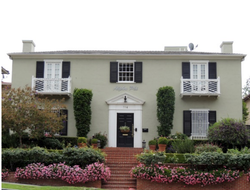
Address: 714 S. Hilgard Avenue Name: Alpha Phi Sorority House Date: 1929