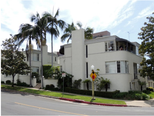
Address: 1001 Malcolm Avenue Architect: Allen Ruoff Date: 1935

This Context/Theme was used to evaluate significant examples of Streamline Moderne architecture. Two properties in Westwood were identified as excellent examples of this style, both of which were multi-family residences.