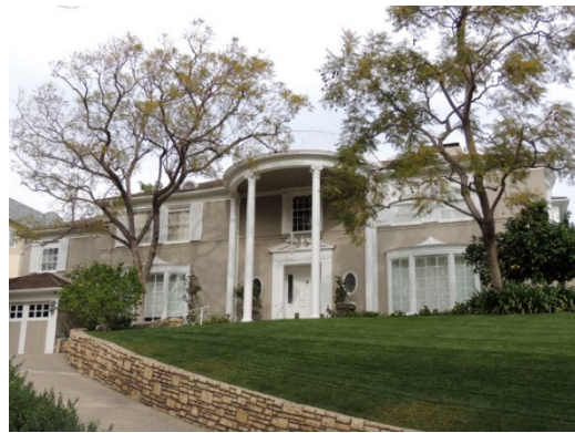
Address: 420 S. Loring Avenue Date: 1941