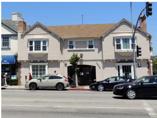
Address: 1340 Westwood Boulevard Date: 1934