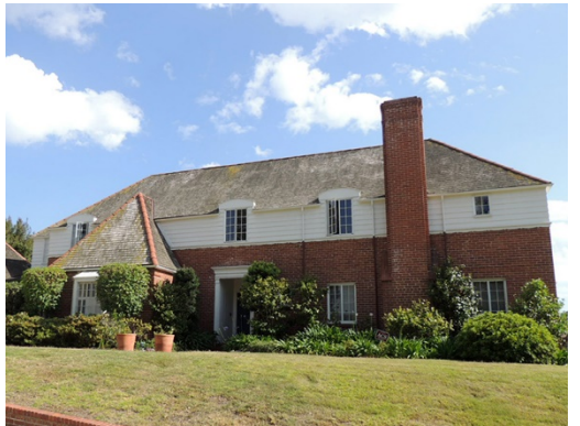
Address: 201 S. Bronwood Avenue Date: 1936