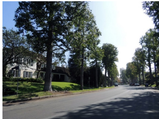
District: Holmby Westwood Residential Historic District