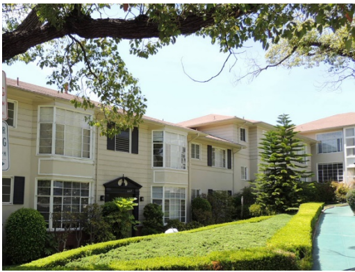
Address: 651 S. Midvale Avenue Date: 1950