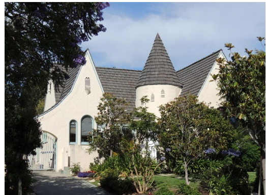
Address: 1630 S. Warnall Avenue Date: 1927