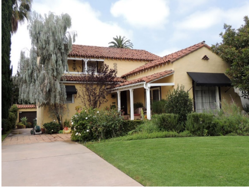
Address: 1711 S. Ensley Avenue Date: 1926