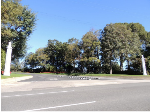
Address: 10101 Wilshire Boulevard Name: Los Angeles Country Club Date: 1911