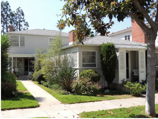
Address: 10370 W. Ashton Avenue Date: 1940