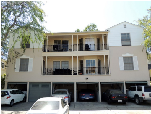
Address: 605 S. Midvale Avenue Date: 1951