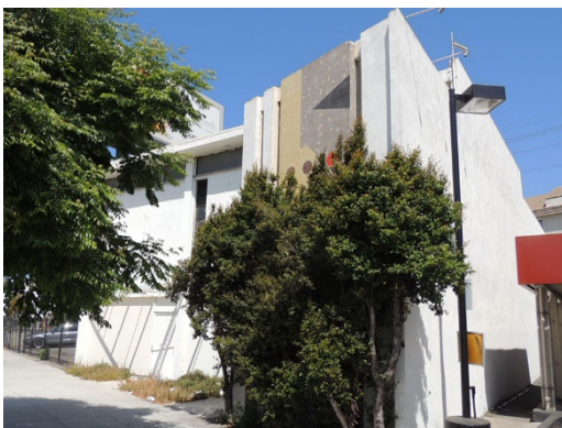
Address: 10975 Santa Monica Boulevard Architect: Smith & Williams Date: 1958