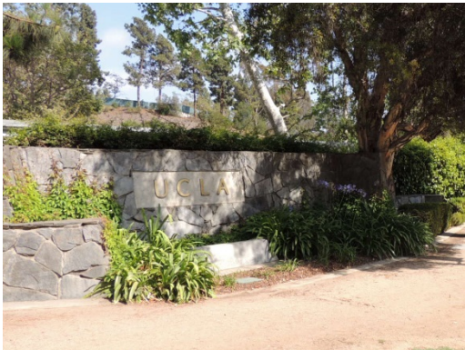
Address: 405 Hilgard Avenue Name: University of California, Los Angeles Date: 1927-present