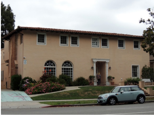
Address: 632 S. Hilgard Avenue Name: Alpha Epsilon Phi Sorority House Date: 1936