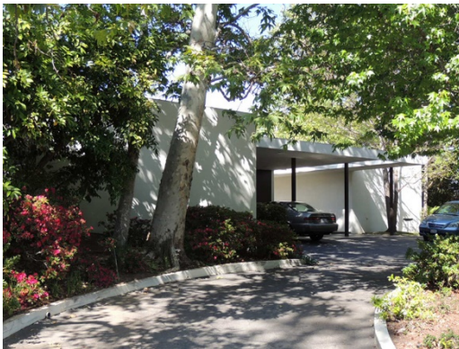
Address: 10345 W. Strathmore Drive Name: Maslon House Architect: Thornton Abell Date: 1969