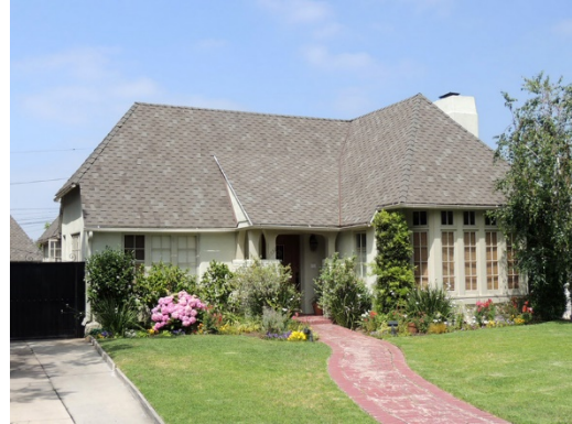
Address: 1551 S. Ensley Avenue Date: 1927

The University Crest Residential Historic District was identified as an excellent example of residential suburban planning and development from the early automobile era, and as a cohesive collection of Period Revival residential architecture. The district occupies the rolling hills just west of the UCLA campus, between Sunset Boulevard and Montana Avenue. Composed of 432 properties, development in the district is exclusively residential, containing one- and two-story single-family residences. Original residences were constructed primarily from the 1930s throughout the 1950s and were designed in a variety of Period Revival styles, as well as the Minimal Traditional, Mid-Century Modern, and Ranch styles. District features include hilly topography, curvilinear streets, landscaped parkways with mature street trees, uniform setbacks, concrete sidewalks and curbs, and period streetlights.