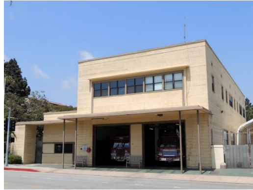
Address: 1090 S. Veteran Avenue Name: Fire Station No. 37 Date: 1942