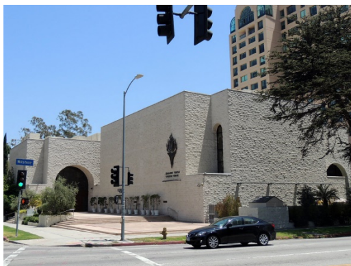
Address: 10512 Wilshire Boulevard Name: Sephardic Temple Tifereth Israel Architect: Brent, Goldman, Robbins & Brown Date: 1970