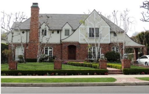
Address: 321 S. Conway Avenue Date: 1930