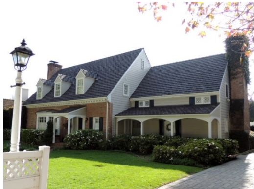
Address: 265 S. Beverly Glen Boulevard Date: 1949

The Comstock Hills Residential Historic District is an early-20 th century residential subdivision located just west of the Los Angeles Country Club, between Wilshire and Santa Monica boulevards. The district contains 307 properties, developed exclusively with one- and two-story single-family residences. Original residences were constructed primarily from the mid-1920s through the 1950s and designed in a variety of Period Revival styles, as well as the Mid-Century Modern, Minimal Traditional, and Ranch