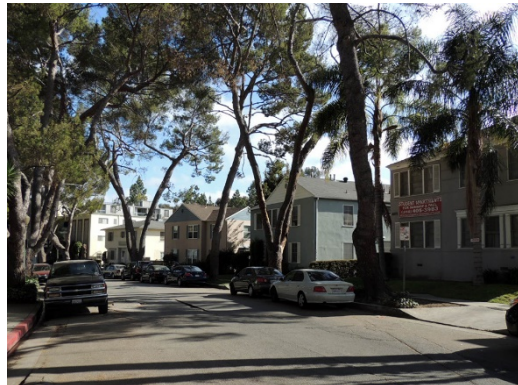
District: Midvale-Kelton Apartment Historic District Description: Context view