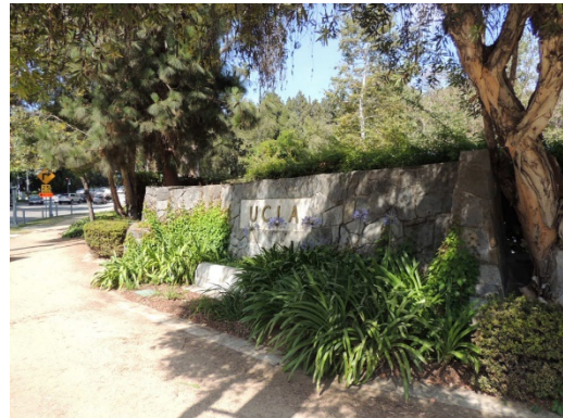
Address: 405 Hilgard Avenue Name: University of California, Los Angeles Date: 1927-present