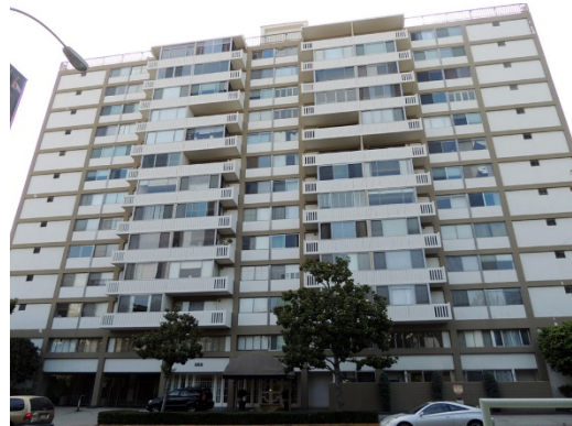
Address: 969 S. Hilgard Avenue Name: Park Westwood Towers Architect: Victor Gruen Date: 1961