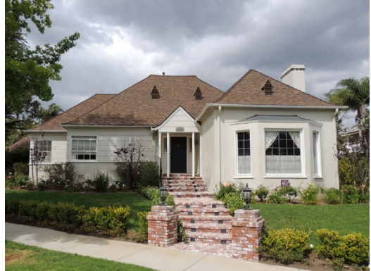
Address: 292 S. Glenroy Avenue Date: 1936