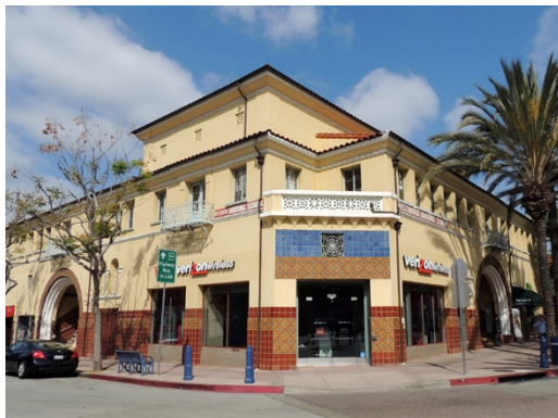
Address: 1091 S. Broxton Avenue Name: University Professional Building Date: 1929