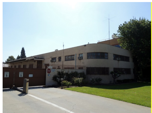
Address: 1400 Sepulveda Boulevard Name: L.A. Department of Water and Power Distribution Headquarters Date: 1932