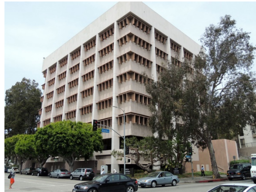
Address: 10995 W. Le Conte Avenue Name: UCLA Extension Architect: A. Quincy Jones Date: 1971