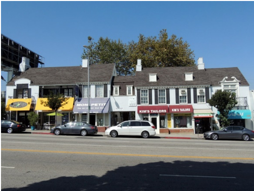
Address: 1510-1518 Westwood Boulevard Date: 1931

Outside of Westwood Village, the survey identified over a dozen additional low-scale buildings as excellent examples of early neighborhood commercial development. Most of these are located along Westwood Boulevard, south of Wilshire.