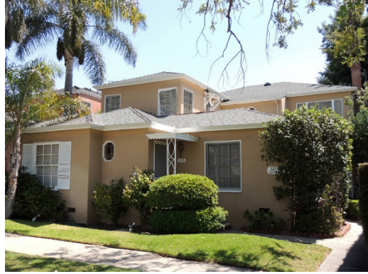
Address: 1276 S. Devon Avenue Date: 1941

The Midvale-Kelton Apartment Historic District was identified as a highly cohesive neighborhood of multi-family residential development. The district contains 38 properties, and is composed of Midvale and Kelton avenues between Levering Avenue on the north and Strathmore Avenue on the south. Development in the district is exclusively multi-family residential, including both apartment houses and courtyard apartment complexes ranging two to four stories in height. Original buildings were constructed primarily in the late 1940s and early 1950s and were designed primarily in the American Colonial Revival, Minimal Traditional, and Mid-Century Modern styles. District features include mature street trees, uniform setbacks, concrete sidewalks and curbs, and landscape parkways.