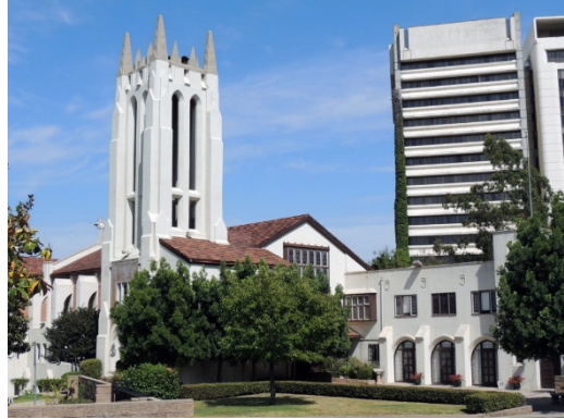
Address: 10808 W. Le Conte Avenue Name: Westwood Hills Christian Church Date: 1949