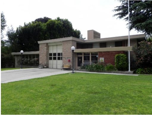
Address: 107 S. Beverly Glen Boulevard Name: Engine Company No. 71 Architect: Austin, Field, Fry & Criz Date: 1948

This Context/Theme was used to evaluate two significant examples of Los Angeles fire stations in Westwood. Fire Station No. 37 is a rare example of a pre-war fire station still in operation. Engine Company No. 71 was also evaluated for its architectural merit as an institutional example of Mid-Century Modernism.