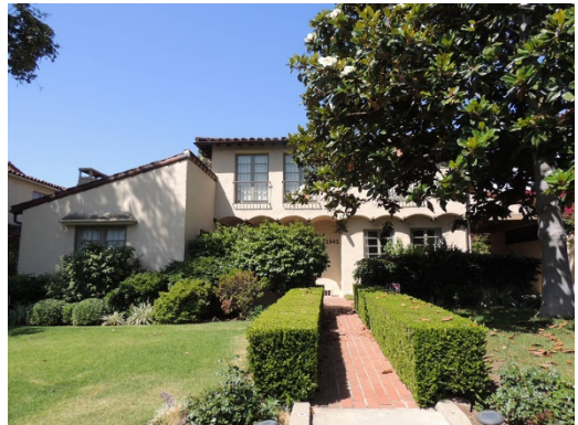
Address: 1541 S. Club View Drive Date: 1929