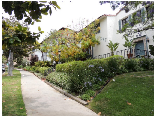
District: UCLA Sorority Row Historic District Description: Context view

The UCLA Sorority Row Historic District was identified as an excellent and unique example of multi-family residential development associated with UCLA. The district occupies two blocks on the east side of Hilgard Avenue between Westholme and Le Conte avenues, along the campus' eastern border. Composed of 23 properties, development in the district is almost exclusively multi-family residential. Original buildings were constructed primarily from the late 1920s through the mid-1930s and were predominantly designed in a Period Revival style, including American Colonial Revival, Spanish Colonial Revival, Mediterranean Revival, and Monterey Revival. Also included are two institutional properties associated with UCLA, the Hilgard Club and the Newman Club. District features include uniform setbacks, hillslope lots, landscaped parkways with mature street trees, concrete curbs and sidewalks, and period streetlights.