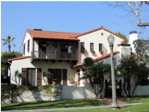
Address: 435 S. Loring Avenue Date: 1933