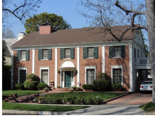
Address: 485 S. Loring Avenue Date: 1938