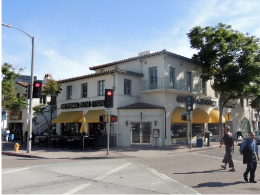
Address: 1001 S. Broxton Avenue Name: El Paseo Architect: Norstrom & Anderson Date: 1931