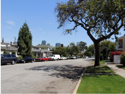
District: Devon-Ashton Apartment Historic District Description: Context view

houses and courtyard apartments. Original buildings were constructed primarily during the late 1930s and early 1940s and were largely designed in the Minimal Traditional, Mid-Century Modern, and American Colonial Revival styles. District features include landscaped parkways, concrete sidewalks, uniform setbacks, and period streetlights.