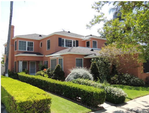
Address: 1270 S. Devon Avenue Date: 1941