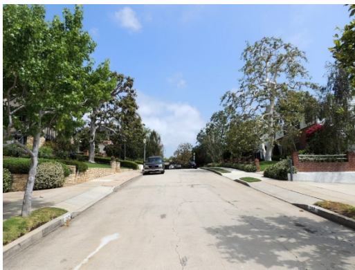
District: University Crest Residential Historic District Description: Context view

The University Crest Residential Historic District was identified as an excellent example of residential suburban planning and development from the early automobile era, and as a cohesive collection of Period Revival residential architecture. The district occupies the rolling hills just west of the UCLA campus, between Sunset Boulevard and Montana Avenue. Composed of 432 properties, development in the district is exclusively residential, containing one- and two-story single-family residences. Original residences were constructed primarily from the 1930s throughout the 1950s and were designed in a variety of Period Revival styles, as well as the Minimal Traditional, Mid-Century Modern, and Ranch styles. District features include hilly topography, curvilinear streets, landscaped parkways with mature street trees, uniform setbacks, concrete sidewalks and curbs, and period streetlights.