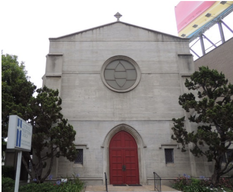
Address: 10822 Wilshire Boulevard Name: Westwood Presbyterian Church Date: 1952