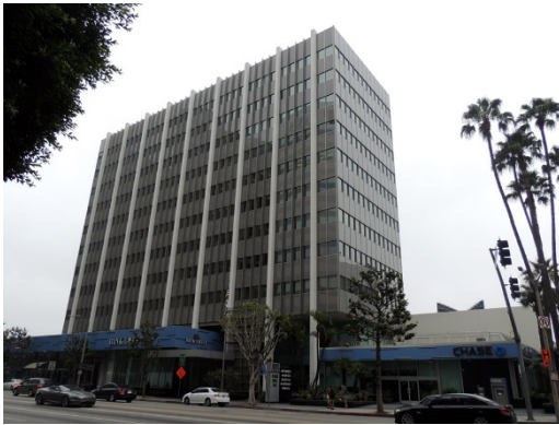
Address: 10921 Wilshire Boulevard Name: Linde Medical Plaza Architect: Paul R. Williams Date: 1961

This Context/Theme was used to evaluate significant examples of Corporate International architecture in Westwood. The survey identified four examples of Corporate International high-rise office buildings, all of which are located on Wilshire Boulevard. Each of these examples was designed by a noted architect of the period, including Paul Williams, Welton Becket, Claud Beelman, and Charles Luckman.