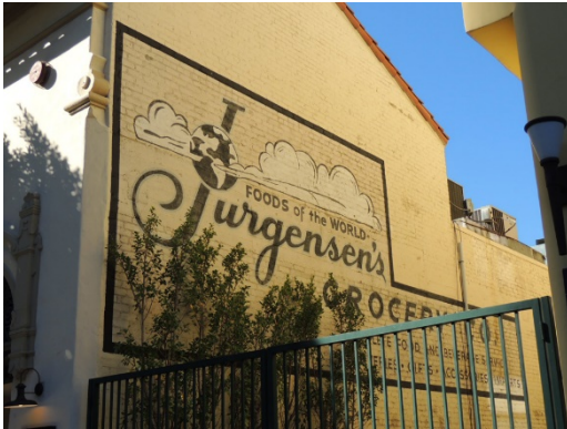
Address: 1071 S. Glendon Avenue Name: Jurgensen’s Grocery Wall Sign Date: Unknown

This Context/Theme was used to evaluate two significant examples of commercial signage, both located in Westwood Village. A painted wall sign for “Jurgensen’s Grocery” references a past tenant in a 1930s building. The neon “Bel-Air Camera” sign, currently affixed to a side façade of their current building, was the original storefront sign on their 1957 founding location.