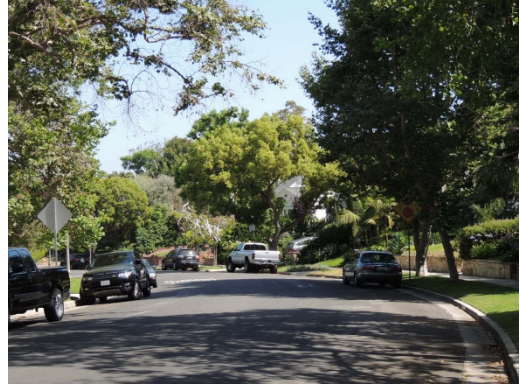
District: Comstock Hills Residential Historic District Description: Context view