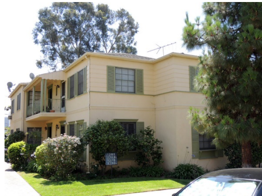
Address: 1288 S. Devon Avenue Date: 1939