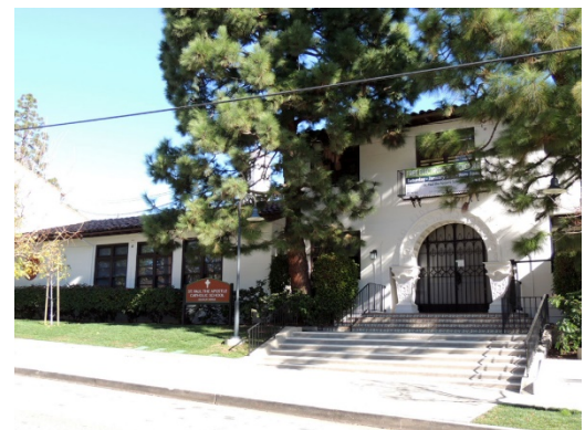
Address: 10750 Ohio Avenue Name: St. Paul the Apostle, School Date: 1935