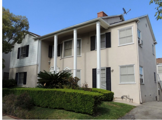
Address: 618 S. Midvale Avenue Date: 1950