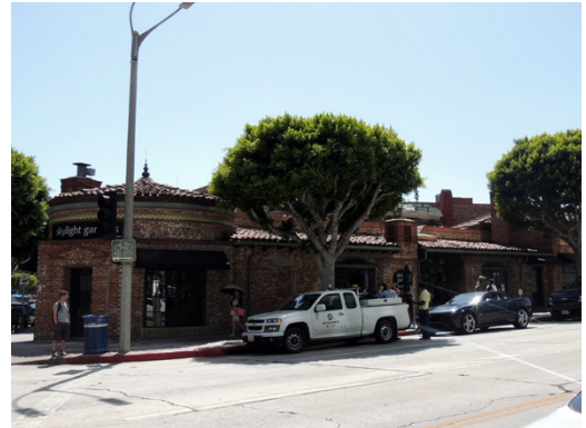
Address: 1139 S. Glendon Avenue Name: La Ronda de las Estrellas Architect: Conway & Wilson Date: 1933