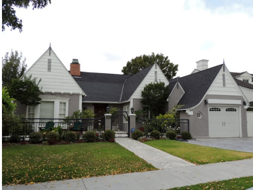
Address: 11135 W. Cashmere Street Date: 1931