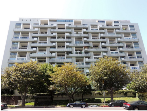
Address: 10375 Wilshire Boulevard Name: Wilshire Terrace Architect: Victor Gruen Date: 1958