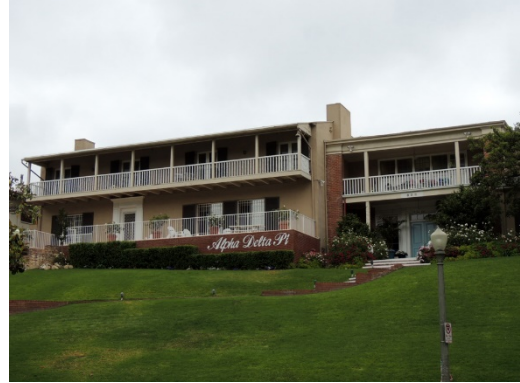
Address: 808 S. Hilgard Avenue Name: Alpha Delta Pi Sorority House Date: 1928