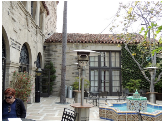
Address: 10874 W Le Conte Avenue Name: Masonic Affiliate Club (now Geffen Playhouse) Architect: Morgan, Walls & Clements Date: 1929