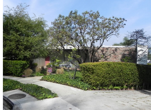
Address: 10525 W. Garwood Place Name: Greenberg House Architect: Richard Neutra Date: 1949