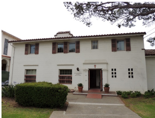
Address: 10750 Ohio Avenue Name: St. Paul the Apostle, Rectory Date: Est. 1940