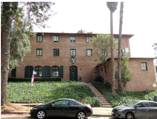
Address: 10938 W. Strathmore Drive Name: Phi Kappa Sigma Fraternity House Architect: Weber & Spaulding Date: 1930