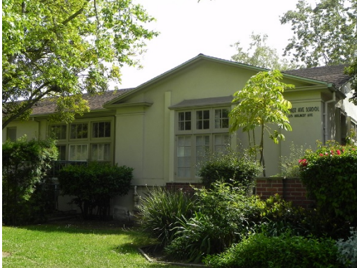
Address: 615 S. Holmby Elementary School Name: Warner Avenue Elementary School Date: Est. 1935

This Context/Theme was used to evaluate two intact examples of LAUSD public elementary schools in Westwood. Fairburn Avenue School and Warner Avenue School both date from the post-1933 Long Beach Earthquake period of school construction, and retain 1930s school buildings dating to their original establishment.