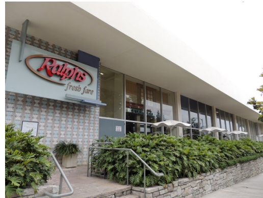
Address: 10860 Le Conte Avenue Name: Bullock's Westwood Architect: Welton Becket & Assoc. Date: 1950