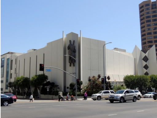
Address: 10400 Wilshire Boulevard Name: Sinai Temple Architect: Sidney Eisenshtat Date: 1960

In addition to the above examples, this Context/Theme was also used to evaluate more Expressionistic examples of the Mid-Century Modern style in Westwood. Two examples were identified, the Sinai Temple by noted architect Sidney Eisenshtat, and the University Lutheran Church by Wilkes & Steinbrueck. Sinai Temple was also evaluated for its religious affiliation as the oldest and largest Conservative Jewish congregation in the Greater Los Angeles area.