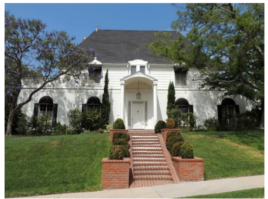
Address: 219 S. Tilden Avenue Date: 1935