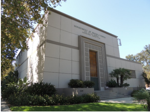
Address: 880 S. Comstock Avenue Name: L.A. Department of Water and Power Distributing Station No. 46 Date: 1955