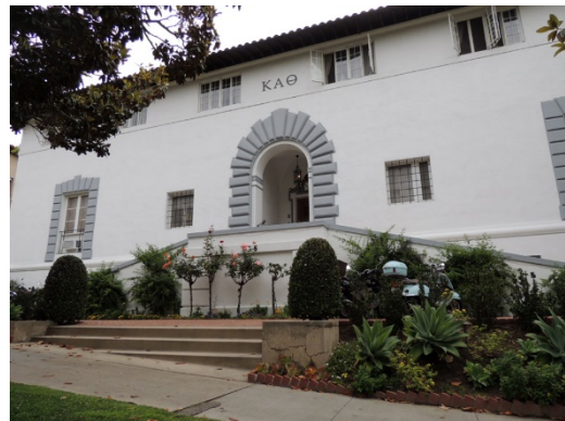
Address: 736 S. Hilgard Avenue Name: Kappa Alpha Theta Sorority House Date: 1930

The Devon-Ashton Apartment Historic District was identified as a highly cohesive collection of courtyard apartment buildings dating primarily from the 1930s and 1940s. Located just southeast of the intersection of Wilshire and Beverly Glen boulevards, the district contains 53 properties. The district is developed with low-density apartment