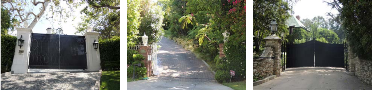
Some residences are difficult to see from the public right-of-way.

Research utilized the collections of the Los Angeles Public Library; University of Southern California (USC); University of California, Los Angeles (UCLA); Huntington Library; Historical Los Angeles Times; the Online Archive of California; and the Pacific Coast Architecture Database, among others.