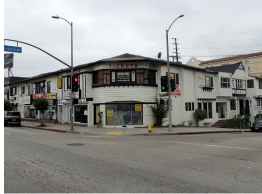
Address: 1351 Westwood Boulevard Date: 1933