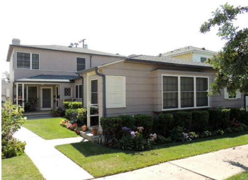
Address: 1252 S. Devon Avenue Date: 1947