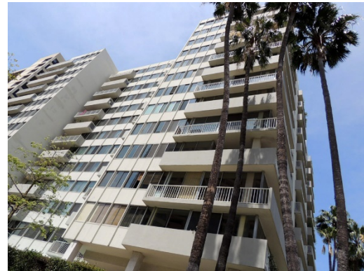
Address: 10433 Wilshire Boulevard Name: Holmby Wilshire Architect: Donald Drazan Date: 1963