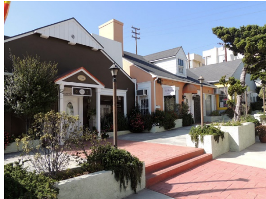
Address: 1740-1748 Westwood Boulevard Date: 1948