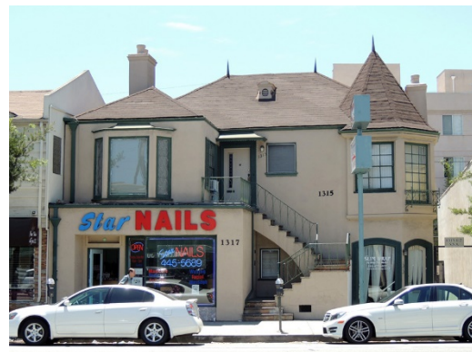
Address: 1313 Westwood Boulevard Date: 1940