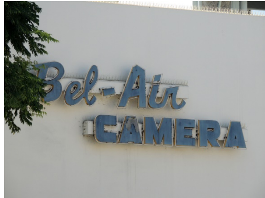
Address: 10925 Kinross Avenue Name: Bel-Air Camera Date: 1957