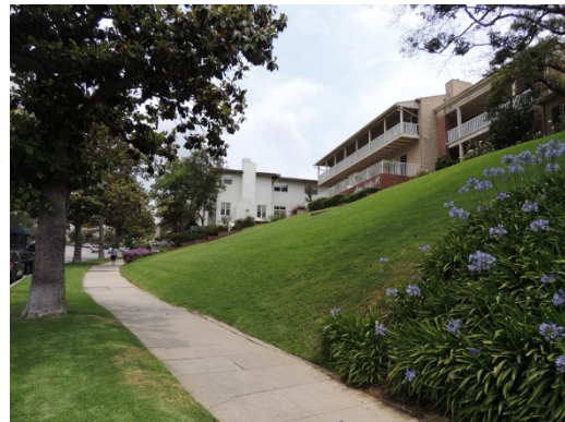
District: UCLA Sorority Row Historic District Description: Context view