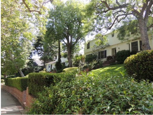
District: Comstock Hills Residential Historic District Description: Context view

styles. District features include sloping hillside lots, curvilinear streets, landscaped parkways and mature street trees, concrete curbs and sidewalks, and period streetlights. This historic district was identified as an excellent example of residential suburban planning and development from the early automobile era in Westwood.