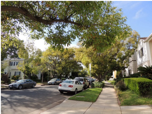
District: Midvale-Kelton Apartment Historic District Description: Context view

The Midvale-Kelton Apartment Historic District was identified as a highly cohesive neighborhood of multi-family residential development. The district contains 38 properties, and is composed of Midvale and Kelton avenues between Levering Avenue on the north and Strathmore Avenue on the south. Development in the district is exclusively multi-family residential, including both apartment houses and courtyard apartment complexes ranging two to four stories in height. Original buildings were constructed primarily in the late 1940s and early 1950s and were designed primarily in the American Colonial Revival, Minimal Traditional, and Mid-Century Modern styles. District features include mature street trees, uniform setbacks, concrete sidewalks and curbs, and landscape parkways.