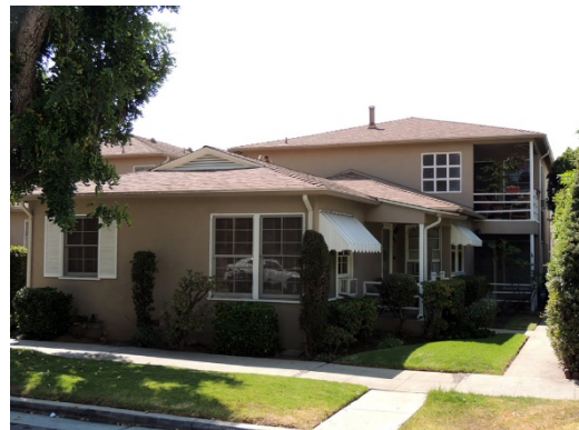
Address: 10354 W. Ashton Avenue Date: 1947