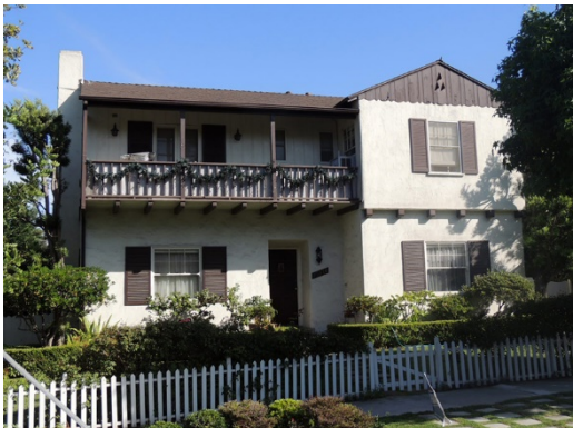
Address: 10316 W. Wilkins Avenue Date: 1935