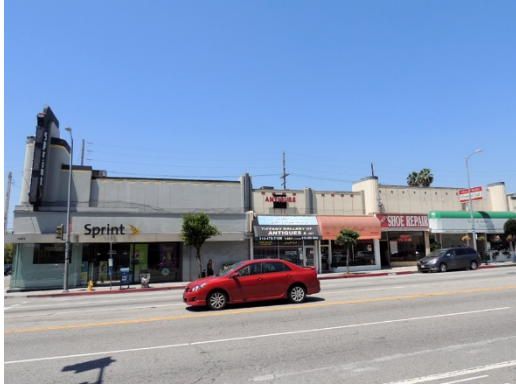
Address: 1457 Westwood Boulevard Date: 1940