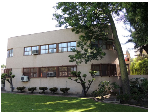
Address: 1400 Sepulveda Boulevard Name: L.A. Department of Water and Power Distribution Headquarters Date: 1932