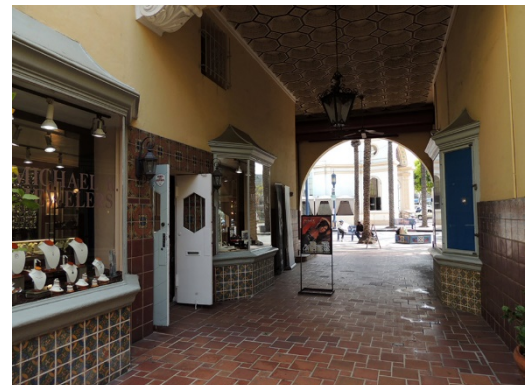
Address: 1091 S. Broxton Avenue Name: University Professional Building Date: 1929