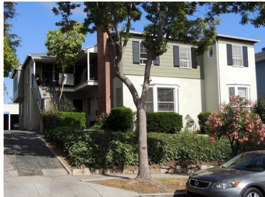
Address: 644 S. Midvale Avenue Date: 1940