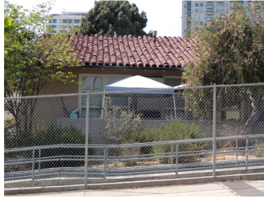
Address: 1403 Fairburn Avenue Name: Fairburn Avenue Elementary School Date: Est. 1935