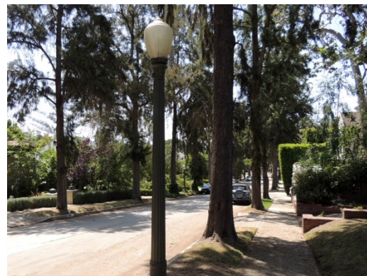
District: University Crest Residential Historic District Description: Context view