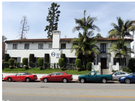
Address: 629 S. Gayley Avenue Name: Theta Xi Fraternity House Architect: Witmer & Watson Date: 1929