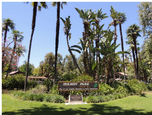
Address: 601 Club View Dr. Name: Holmby Park Date: 1927