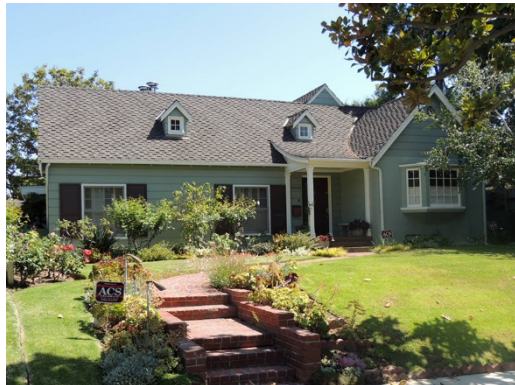
Address: 10348 W. Eastborne Avenue Date: 1936