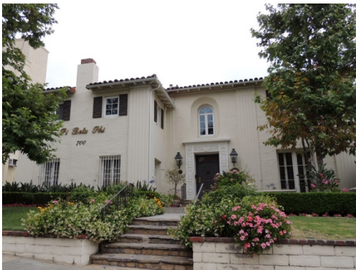
Address: 700 S. Hilgard Avenue Name: Pi Beta Phi Sorority House Date: 1929