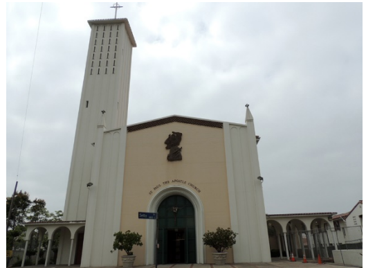
Address: 10750 Ohio Avenue Name: St. Paul the Apostle, Main Church Architect: Chaix & Johnson Date: 1958