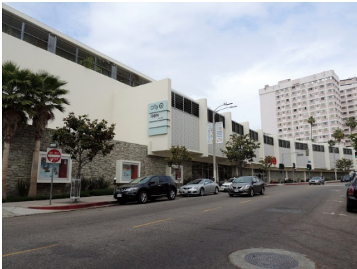
Address: 10860 Le Conte Avenue Name: Bullock's Westwood Architect: Welton Becket & Assoc. Date: 1950

This Context/Theme was used to evaluate significant examples of Mid-Century Modern architecture in Westwood. The survey identified approximately a dozen individual examples, most of which were single-family residences. One notable exception is the Bullock's Westwood building in Westwood Village. Constructed in 1950, Bullock's Westwood was designed by Welton Becket & Associates, one of Los Angeles' premier architectural firms at the time. Today, the building is occupied by a Target store on the ground floor (accessed via Weyburn on the building's south side), and a Ralphs supermarket on the second floor (accessed via Le Conte on the north side). Bullock's Westwood was also evaluated as an excellent example of a mid-century regional department store.