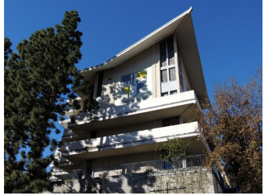
Address: 10915 Strathmore Drive Name: University Lutheran Chapel Architect: Wilkes & Steinbrueck Date: 1965