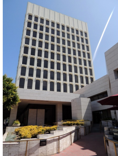
Address: 924 S. Westwood Boulevard Name: Security Pacific National Bank Tower and Plaza Architect: Welton Becket & Assoc. Date: 1973