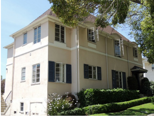
Address: 645 S. Midvale Avenue Date: 1949