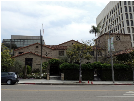
Address: 10874 W Le Conte Avenue Name: Masonic Affiliate Club (now Geffen Playhouse) Architect: Morgan, Walls & Clements Date: 1929

This Context/Theme was used to evaluate significant examples of Mediterranean Revival architecture in Westwood. Residential, commercial, and institutional examples were identified, including multiple UCLA fraternity and sorority houses and, most notably, the original buildings of Westwood Village developed by the Janss Corporation. Among the properties identified in Westwood Village is the Masonic Affiliates Club, built in 1929 by master architectural firm Morgan, Walls & Clements. The club was converted to a theater in 1975. After renovations by UCLA, it reopened as the Geffen Playhouse in 1995. The Masonic Affiliates Club was also evaluated as an excellent example of early institutional development in Westwood.