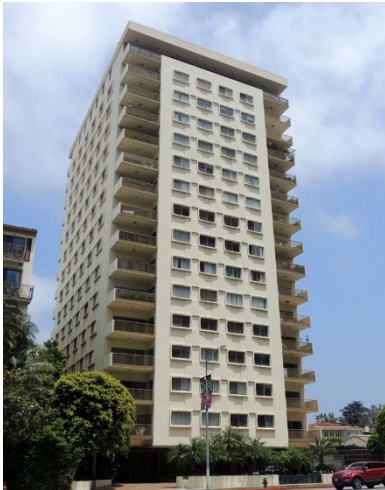
Address: 10787 Wilshire Boulevard Name: Marie Antoinette Tower Architect: Weber & Nicholson Date: 1962