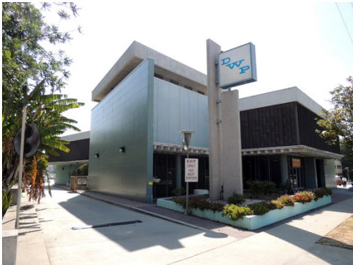
Address: 1394 Sepulveda Boulevard Name: L.A. Department of Water and Power Offices Architect: W.W. Gossy Date: 1968

These Context/Themes were used to evaluate significant examples of Department of Water and Power buildings in Westwood. Examples include a rare 1930s distribution headquarters building, a 1950s distributing station, and a 1960s office building. The office building was also evaluated as an excellent example of Mid-Century Modern commercial architecture.