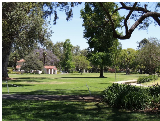
Address: 601 Club View Dr. Name: Holmby Park Date: 1927