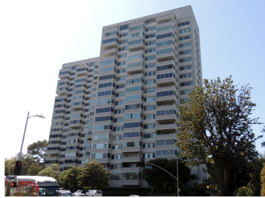
Address: 10301 Wilshire Boulevard Name: The Comstock Architect: Victor Gruen Date: 1962