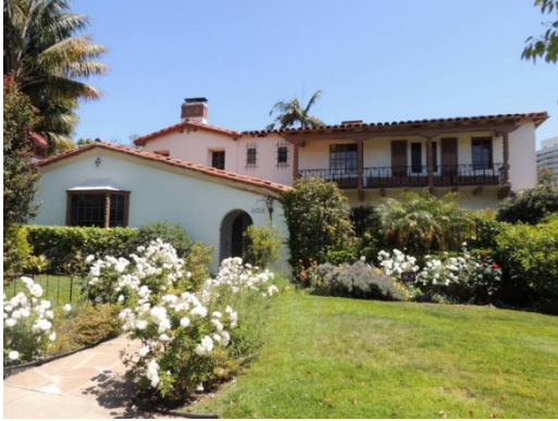
Address: 10754 W. Weyburn Avenue Date: 1935