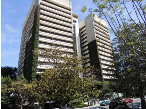
Address: 930 S. Hilgard Avenue Name: La Mancha Student Resident Hall Architect: Bodrell, Joer'dan, Smith & Assoc. Date: 1969

This Context/Theme was used to evaluate two significant examples of Brutalist architecture in Westwood. Both identified examples are high-rise residence halls associated with UCLA, and both display the typical exposed concrete exterior.