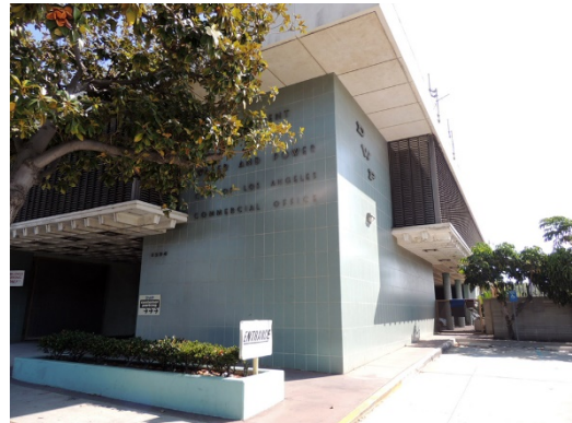
Address: 1394 Sepulveda Boulevard Name: L.A. Department of Water and Power Offices Architect: W.W. Gossy Date: 1968