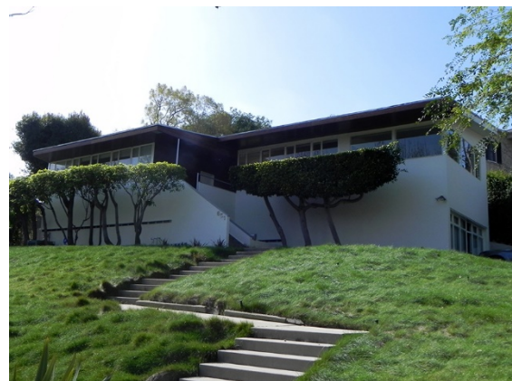
Address: 651 S. Warner Avenue Name: Van Cleef House Architect: Richard Neutra Date: 1942