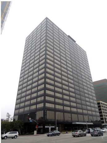
Address: 10950 Wilshire Boulevard Name: Tishman Building Architect: Welton Becket Date: 1971