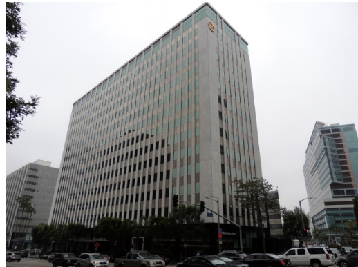
Address: 10889 Wilshire Boulevard Name: Occidental Petroleum Building Architect: Claud Beelman Date: 1961