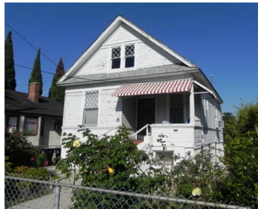
658 W. Sepulveda Street, 1905 (SurveyLA, 2011)

As the gabled cottage evolved, elements from other popular styles of the time, such as Eastlake, Queen Anne, and Neoclassical, were incorporated into the façade to give what would otherwise be an unoriginal cottage more style. To expand gabled cottages from the limitations of their rectangular plans, wings were added. These houses have L-shaped plans resulting from the intersection of the gabled roof forms. Whether they have front-gabled or cross-gabled roofs, these houses have slightly overhanging boxed eaves and full- or partial-width front porches. Window types vary across elevations but are usually double-hung sash with a distinctive tripartite or bay window on the primary elevation.