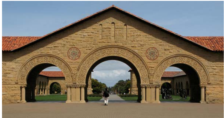
Entrance to Quad at Stanford University, constructed between 1887 and 1906

arches, heavy masonry walls, and turrets topped with conical roofs. Successors in Richardson's own firm brought the style west when they designed the buildings for Stanford University in 1887. Masonry materials give buildings in the Richardsonian Romanesque style a quality of permanence. Thus, like Neoclassical architecture, it was most often suited to government and educational institutions. 15 In the West, examples