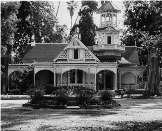
Queen Anne Cottage, 1881 City of Arcadia

The development of the Queen Anne style coincided with the boom years of the 1880s and 1890s, making it the most utilized of all the late Victorian era styles for residential buildings in Southern California.