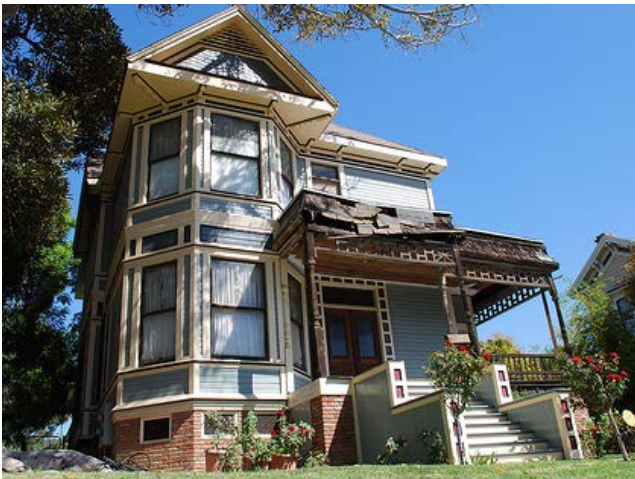
Sanders House, 1887 L.A. Historic-Cultural Monument No. 74 (Big Orange Landmarks, 2007)