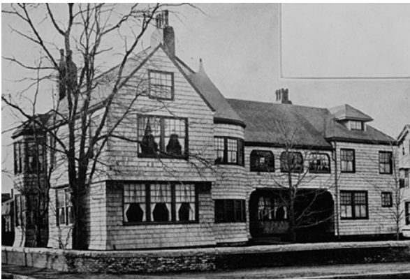
Mary Fiske Stoughton House, 1882 Cambridge, Massachusetts

The term Shingle Style was coined by architectural historian Vincent Scully in the 1950s. This uniquely American style dates from the late 19 th and early 20 th century. The proponents of the Shingle Style eschewed the highly ornamented patterns found in the other Late Victorian era styles such as Queen Anne and Eastlake. Henry Hobson Richardson is credited with the development of the style and used it in the design of country houses and seaside estates. His design of the William Watts Sherman House (1875-1876) in Newport, Rhode Island is considered the prototype of what became known as Shingle Style. The style was carried to maturity by Henry Hobson Richardson in the Mary Fiske Stoughton House (1882-1883) in Cambridge, Massachusetts where the form and ornamentation were simplified. By covering most of the building with shingles stained a single color, the architects created a uniform, unembellished surface. The continuous use of the same material on roof and wall surfaces was a distinct departure from Queen Anne and Eastlake buildings, which were characterized by not only by a variety of materials, but also by shapes and colors.