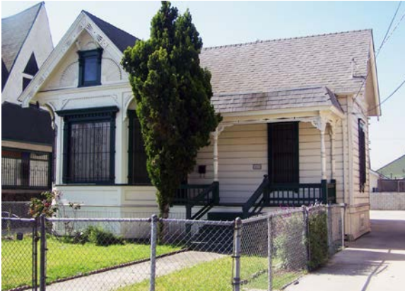
420 E. Adams Boulevard, 1885 (SurveyLA, 2011)

Architecture and Engineering/Late 19 th and Early 20 th Century Residential Architecture; Housing the Masses/Late 19 th and Early 20 th Century Neighborhoods