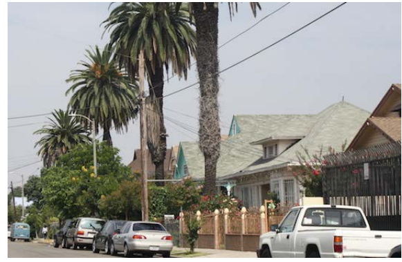
Adams and Maple Planning District (SurveyLA, 2011)

The Potter's Woodlawn Tract and Ford Tract Planning District and the Adams and Maple Planning District are both located in Southeast Los Angeles. 41 Both neighborhoods were developed in proximity to streetcar lines. They reflect the residential development of the late 19 th and early 20 th centuries and contain notable concentrations of architectural styles popular during this period. Many of the residences are Vernacular Victorian cottages and residences with Queen Anne influences. The oldest houses in the Adams and Maple Planning District represent high style architecture popular during the boom of the late 1880s.