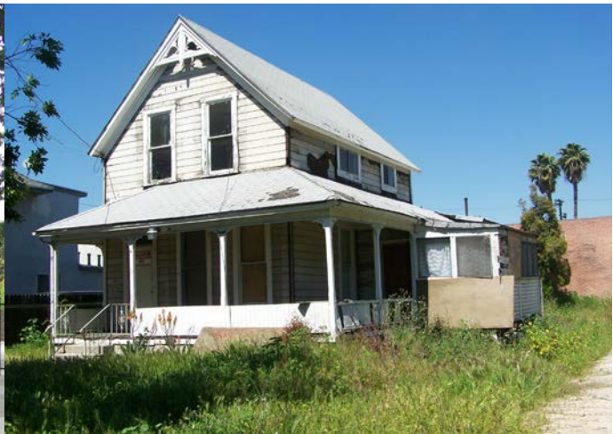
Stewart Farmhouse, constructed at 511 W. 31 st Street in 1871 (SurveyLA, 2012)

Examples include the residence at 640 E. 49 th Street in the Vernon Central neighborhood of Southeast Los Angeles. Like most examples of the style, the design of the house is by a builder as opposed to an architect. It is characterized by a multi-gabled roof and wrap around porch and is decorated with delicate millwork, turned porch posts, and fish scale shingles beneath the front-facing gables. On the opposite side of Downtown Los Angeles, the Stewart Farmhouse was constructed at 511 W. 31 st Street (L.A. Historic-Cultural Monument No. 1028) in the University Park neighborhood of South Los Angeles. 36 The 1871 residence, 37 the earliest Folk Victorian in Los Angeles, it is simpler in form and detail than most examples of the style. The porch has turned wood posts, spindle work, and decorative millwork detailing.