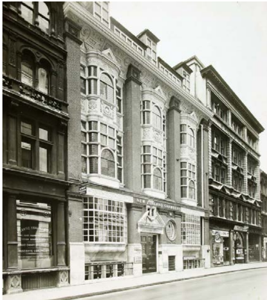
New Zealand Chambers in London, by Richard Norman Shaw in 1873