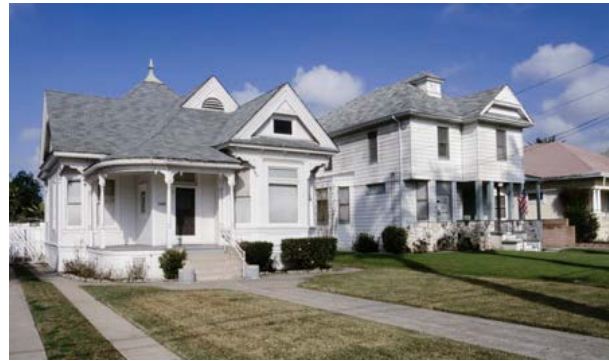
Lincoln Heights Historic Preservation Overlay Zone (Office of Historic Resources)

The Highland Park-Garvanza Historic Preservation Overlay Zone (HPOZ) is comprised of several adjacent neighborhoods in northeast Los Angeles. The neighborhoods were developed during the 1880s and 1920s building booms. The first tract in Highland Park was subdivided in 1886 and became one of the first residential subdivisions in Northeast Los Angeles. The tract was developed with Eastlake, Folk Victorian, Shingle, and Queen Anne style residences, among others. The area continued to develop into the 1920s with Arts and Crafts style residences. The area was adjacent to a Santa Fe Railroad line as well as Pacific Electric Red and Yellow streetcar lines, which encouraged its development.