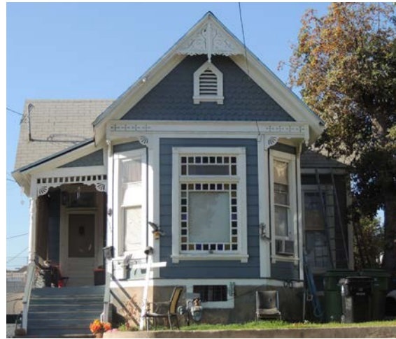
1526 W. Rockwood Street, 1885