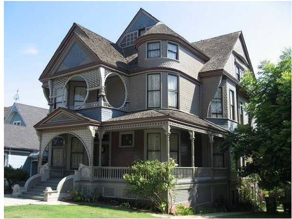
Sessions House, 1889 L.A. Historic-Cultural Monument No. 52 (Big Orange Landmarks, 2007)