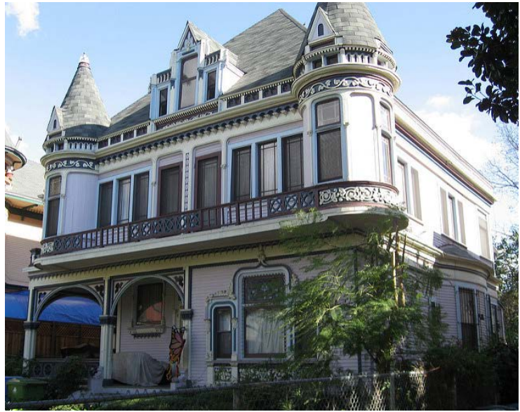
Marley-Stone House, 1036-1038 S. Bonnie Brae Street, built between 1895 and 1896

The few examples built in Los Angeles were designed around the turn of the century and were often residences constructed for those connected to East Coast society. The only remaining examples of the style that retain integrity are either listed in the National Register or designated Historic-Cultural Monuments. They include the Marley-Stone House (Contributor to the South Bonnie Brae Tract National Register Historic District), Rindge - Frederick Hastings House, Mary Andrews Clark Residence of the YWCA, and Magic Castle (L.A. Historic-Cultural Monument No. 406). 39