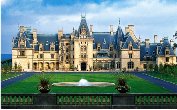
Biltmore House, designed by Richard Morris Hunt between 1890 and 1895

The Chateausque style was based upon the 16 th century French chateau seen by many Americans on tours of Europe and by architects who studied at the École des Beaux-Arts in Paris. Richard Morris Hunt,