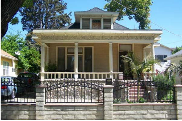
173 E. 36 th Street, constructed in 1898 (SurveyLA, 2011)

and shingle siding. Both properties are located in Southeast Los Angeles and represent the early residential development of the area. Multi-family instances of the vernacular hipped cottage can be found, but are much less common than their single-family counterparts.