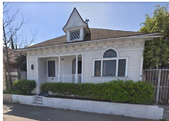
1308 W Manchester Avenue, constructed in 1900 (Google Street View, 2018)

Usually a dormer, which was also hipped, was centered over the main façade, although a front gable over a three-sided bay was also a favored variation of the basic roof form. The houses often had a partial front porch recessed into the façade. A tripartite, projecting bay window completed the plane of the primary elevation. The house at 1308 W Manchester Avenue is an excellent example of the style with Neoclassical embellishments. Constructed in 1900 in South Los Angeles, it has a hipped roof, centered dormer, Palladian window, decorative frieze, and off-set, recessed front porch.