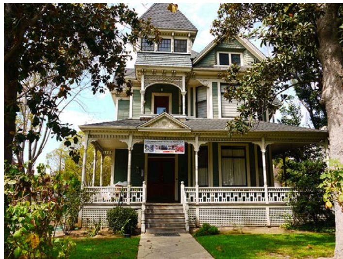
Miller & Herriott House, 1887 L.A. Historic-Cultural Monument. 241