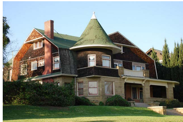
Gilbert House, 1903 L.A. Historic-Cultural Monument No. 85 (Big Orange Landmarks)

Merging the vocabularies of American Colonial Revival and Richardsonian Romanesque, Shingle Style houses can take many forms. Some have gambrel roofs, Palladian windows, and other American Colonial Revival details. Some have borrowed features from the Richardsonian Romanesque such as squat towers and stone on lower stories. The overall emphasis; however, is on the shingled volume rather than on the decoration of individual building elements.