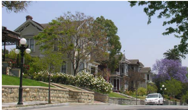
Carroll Avenue, Angelino Heights Historic Preservation Overlay Zone

Hollywood. The housing stock in the central city was eliminated by the dense commercial development that occurred from the 1910s to 1930s and the urban renewal projects in the late 20 th century that cleared Bunker Hill Downtown and areas for the Convention Center and Staples Center. Examples of late 19 th and early 20 th century neighborhoods include the Angelino Heights and Lincoln Heights Historic Preservation Overlay Zones as well as the Potter's Woodlawn Tract and Ford Tract Planning District and Adams and Maple Planning District, both identified by SurveyLA.