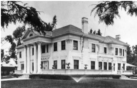
J.E. Stearns Residence, 27 Saint James Park, 1901

of the most notable examples of the style are in the West Adams neighborhood. The Colonel J.E. Stearns Residence (L.A. Historic-Cultural Monument No. 434) is located at 27 Saint James Park. The distinguished architect John Parkinson designed the residence in 1901. The Britt Mansion (L.A. Historic-Cultural Monument No. 197) is located at 2528 Gramercy Place and designed by the noted Alfred E. Rosenheim in 1910. Both display the signature element of the style, a full-height entry porch with pediment and classical columns. The style was also applied to vernacular cottages; these are more accurately said to be influenced by the Neoclassical style rather than pure examples of Neoclassical architecture.