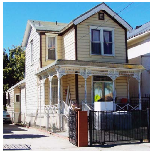
604 E. 29th Street, 1890 (SurveyLA, 2011)