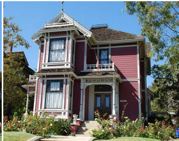
Innes House, 1887 L.A. Historic-Cultural Monument No. 73 (Big Orange Landmarks, 2007)