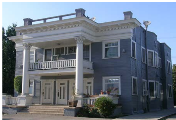
9813 W. Venice Boulevard, 1915 (SurveyLA, 2011)