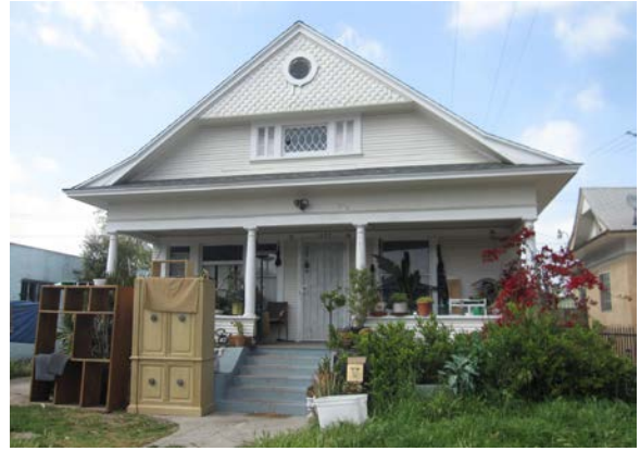
1177 E. 54 th Street, 1906 (SurveyLA, 2011)

Gabled cottages are usually situated in the earliest streetcar suburbs east and northeast of Downtown Los Angeles, such as Highland Park, Elysian Valley, Cypress Park, and Boyle Heights. Numerous examples can also be found in early residential areas south of Downtown, such as the Central and Vernon neighborhoods of Southeast Los Angeles and the University Park and Exposition Park neighborhoods of South Los Angeles. Intact examples, however, are increasingly rare. Representing the earliest patterns of residential development in the Central neighborhood, the house at 420 E. Adams Boulevard was constructed during the boom of the 1880s. It is an example of a gabled cottage with a cross-gabled roof and L-shaped plan. It has little ornamentation but displays Queen Anne style detailing. Another example of a gabled cottage in the Vernon neighborhood is located at 1177 E. 54 th Street. This house has a front-gabled roof and rectangular plan. It displays decorative features such as fish scale shingles and leaded glass associated with the Queen Anne style. By the time this house was constructed in 1906, the Craftsman style bungalow was beginning to replace the gabled cottage as the most popular form of housing in Los Angeles.