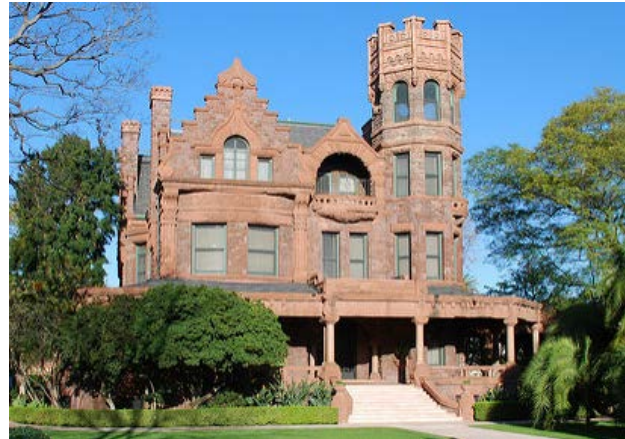
Stimson House, 2421 S. Figueroa Street, 1891 (Big Orange Landmarks, 2009)

Another outstanding extant example of a residential building in the Richardsonian Romanesque style is the Ecung-Ibbetson House (L.A. Historic-Cultural Monument No. 350), completed in 1899 for a prominent real estate developer. The house is located at 1180-1190 W. Adams Boulevard and 2612 Magnolia Avenue in the North University Park neighborhood. The heavy, stone exterior with multi-gable roof and center turret are character-defining features of the style. This particular example has unique, flared eaves suggesting a Japanese influence.