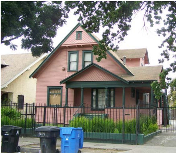
640 E. 49 th Street, 1905 (SurveyLA, 2012)

Residences in the Folk Victorian style are typically found in early residential neighborhoods developed around Downtown Los Angeles, such as the one at 640 E. 49 th Street. Constructed in 1905, it features a wrap-around porch applied to what is otherwise a relatively simple building. The earliest streetcar neighborhoods developed in Los Angeles include Boyle Heights and Lincoln Heights. These two neighborhoods have the highest concentrations of houses constructed in the Folk Victorian style. Others include Angelino Heights, Echo Park, and Highland Park. Examples can also be found scattered throughout neighborhoods west and south of Downtown such as West Adams, Pico-Union, and University Park.