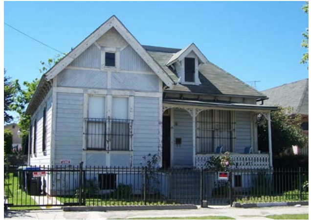
124 E. 23 rd Street, 1889 (SurveyLA, 2011)