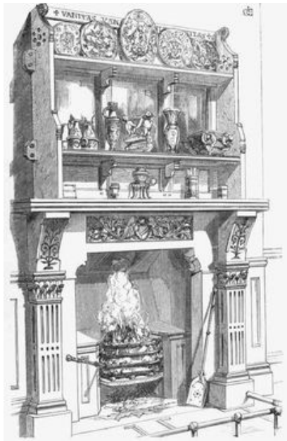
Drawing of fireplace mantle from Hints in Household Taste by Charles Locke Eastlake, 1868 (Wikimedia Commons)

and rural medieval-inspired architecture did not follow the Renaissance style associated with Queen Anne's reign. More closely related to that under Queen Elizabeth I, the style was not quite the stone and brick "Elizabethan," but was too late to be classified as Gothic. An early example is Shaw's design for the New Zealand Chambers in London. Although Shaw's ideas were taken up by British and Americans alike, introduced in the United States by the 1876 Centennial Exposition in Philadelphia, 23 it was American architects who fused the forms of the suburban Tudor Revival with the traditionally urban Queen Anne to create what would become the truly American Queen Anne style.