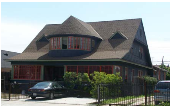
824 E. Adams Boulevard, 1910

columns and gambrel roof borrow from the American Colonial Revival, and its irregular, sculpted form is rooted in the Richardsonian Romanesque. However, the elongated horizontal emphasis and lack of ornament differentiate the Shingle Style from Queen Anne architecture, and the combination of the three styles is distinctly Shingle Style.