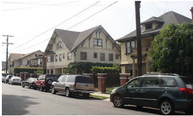
Potter's Woodlawn Tract and Ford Tract Planning District (SurveyLA, 2011)