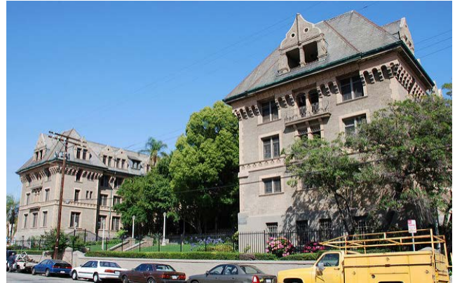
Mary Andrews Clark Residence of the YWCA, 306 Loma Drive, 1913 (Big Orange Landmarks, 2008)