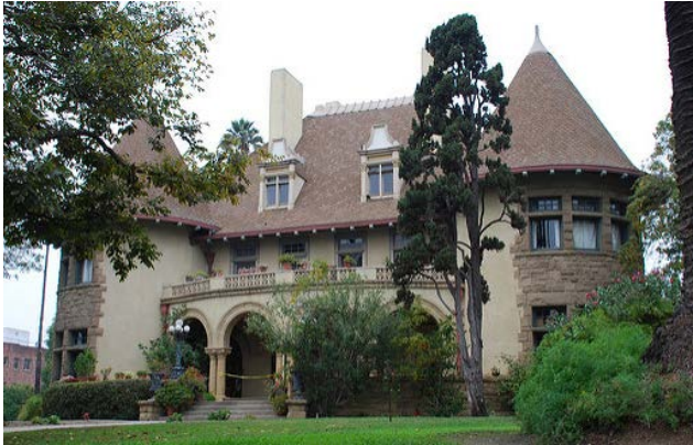
Rindge - Frederick Hastings House, 2256 S. Hobart Boulevard, 1887