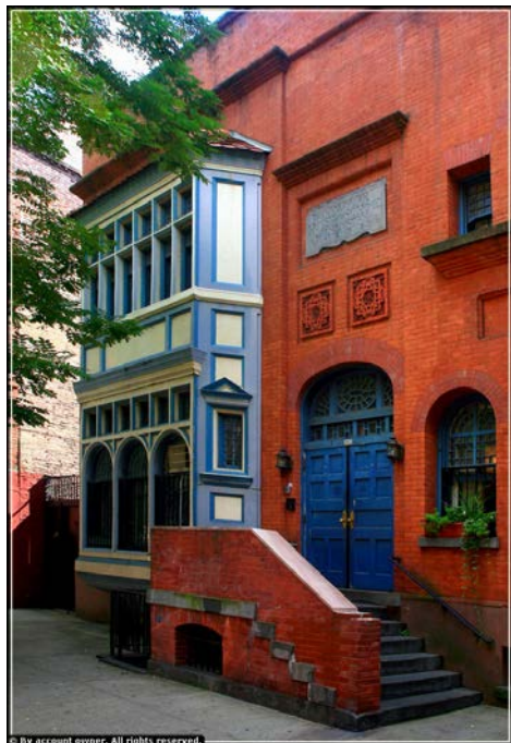
New York House and School of Industry, 1878

The Queen Anne style was named and popularized in England by a group of 19 th century architects led by Richard Norman Shaw. Somewhat of a misnomer, Shaw's picturesque architecture was not modeled on the buildings constructed during Queen Anne's reign. It was more closely related to the buildings constructed under Queen Elizabeth I, but not quite the stone and brick "Elizabethan," and too late to be classified as Gothic. 33 The style in England consisted of half-timbering and patterned masonry work that was more closely aligned with the Arts and Crafts movement than its American counterpart.