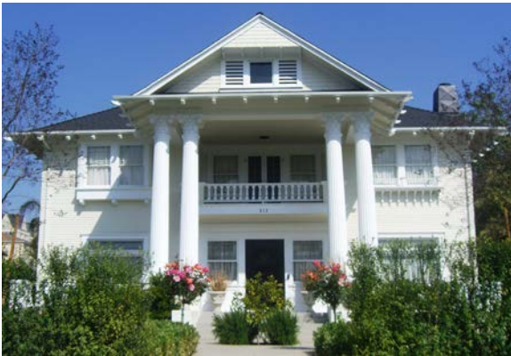
212 S. Wilton Place, constructed in 1908 (SurveyLA, 2006)

One facet of the Classical Revival, the Neoclassical style is an almost academic reinterpretation of Greek and Roman precedents. The style is primarily distinguished from Beaux Arts Classicism by its simpler treatment of classical forms, features, and ornament. The style was popularized at world fairs and practiced by such influential architects as McKim, Mead, and White. Neoclassical style buildings are monumental by definition; thus, the Neoclassical style was most commonly utilized in the design of monuments, public buildings, and banks. One of the most impressive and well-known buildings designed by McKim, Mead, and White was Pennsylvania Station (1902-1910, demolished) in New York City. However, they developed Neoclassical designs for both public buildings and private residences alike.