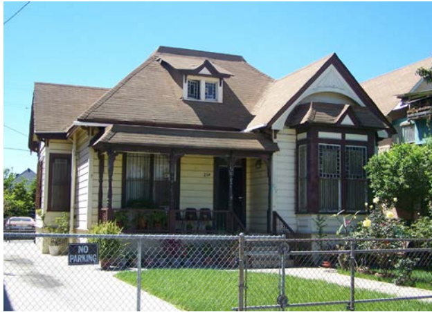
254 E. 23 rd Street, 1887 (SurveyLA, 2011)

Although rare, other examples of the Eastlake style can be found scattered throughout neighborhoods surrounding Downtown Los Angeles such as Angelino Heights, Lincoln Heights, Highland Park, Cypress Park, and Boyle Heights. Influences of the style applied to residences from the period are more common than pure examples of Eastlake architecture, such as 254 E. 23 rd Street and 124 E. 23 rd Street in Southeast Los Angeles.