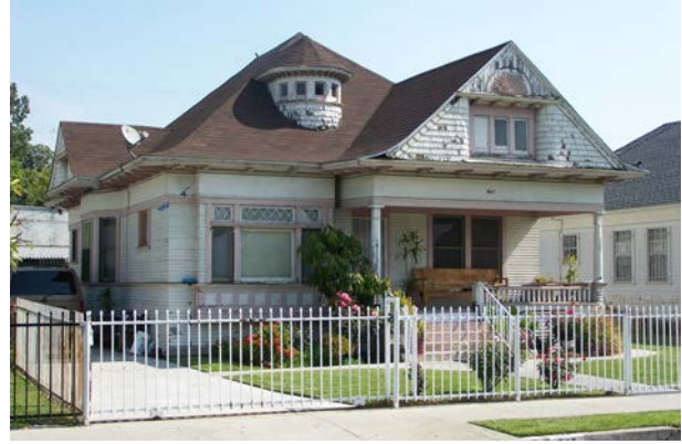
947 E. 21 st Street, constructed in 1902 (SurveyLA, 2011)

Hipped cottages are usually sited on city lots, particularly in the earliest streetcar suburbs north and northeast of Downtown Los Angeles, such as Angelino Heights, Echo Park, Highland Park, Lincoln Heights, and Boyle Heights. Numerous examples can also be found in the neighborhoods of South and Southeast Los Angeles as well as early cities later consolidated with Los Angeles such as San Pedro, Wilmington, and Venice. Hipped cottages reflect the earliest patterns of residential development in the neighborhoods in which they are located. Although once the most common form of middle class housing in Los Angeles, intact examples are becoming increasingly rare.