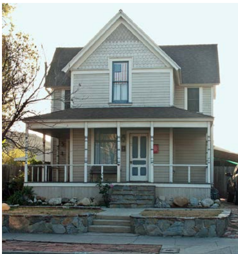
Drake House, 1892 L.A. Historic-Cultural Monument No. 338 (Charles J. Fisher)

Folk Victorian was perhaps the most popular residential style for Los Angeles's early homesteaders. Examples of the style in Los Angeles range in level of detail from simple to ornate with rows of spindlework and patterned shingle siding. Built in 1892, the Drake House (L.A. Historic-Cultural Monument No. 338) at 210-220 S. Avenue 60 in Highland Park is a classic example of the style. It is covered by a cross gabled roof with shallow overhanging boxed eaves. The exterior is sheathed in clapboard except for the gable ends that feature diamond and fish scale shingles. The porch is simply detailed with turned wood posts.