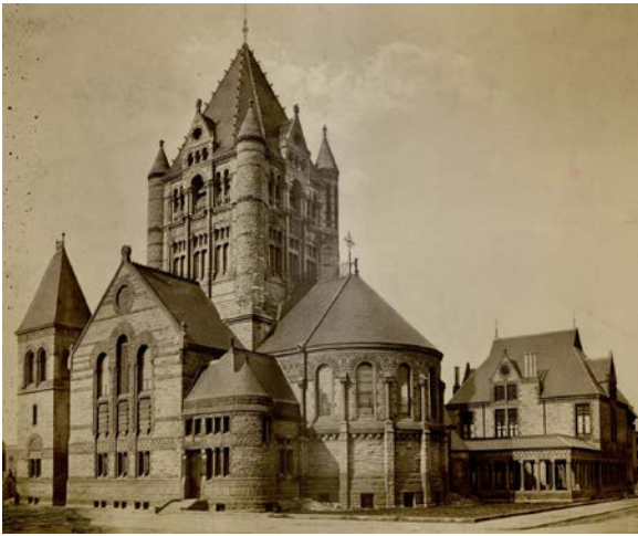
Trinity Church, designed by Henry Hobson Richardson between 1872 and 1877

Borrowing from French Romanesque forms, the Richardsonian Romanesque style was developed around 1880 by Henry Hobson Richardson, an American who studied at Harvard before attending the École des Beaux-Arts in 1860. Although Richardson was an influential architect in the Queen Anne and Shingle Styles, his development of a Romanesque style was so striking and influential that it was later called Richardsonian Romanesque in his honor. One of the earliest examples the style was his design of the Trinity Church in Boston Massachusetts (1872-77). The style achieved bold, coherent massing through abutting volumes of various height and form with rounded arches,