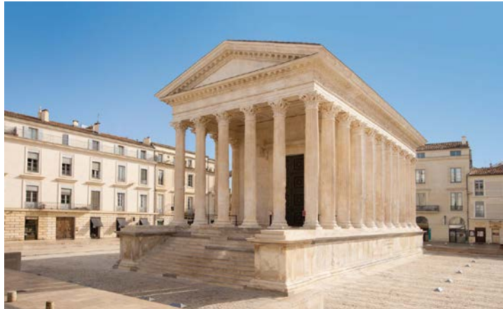
La Mason Carrée in Nîmes, France, constructed between 4 and 7 AD.

The Neoclassical style emerged in the eastern part of the United States around 1895, as a reinterpretation of classic Greek and Roman temple architecture. 8 In the 18 th Century, following the American Revolution, Classical Revival architectural forms were adopted to symbolize the “reincarnation of the virtuous republics of antiquity” and “Americans progressing toward ever-greater perfection via democratic institutions based on the republics of Greece and Rome.” 9 The early application of the style was uninformed by scholarship; based on only a few examples, such as the La Mason Carrée in Nîmes and the Pantheon in Rome. As American’s pride in country diminished after 1850 with the Civil War, so did Classical Revival architecture. It wasn’t until the 1890s that it was revived as Neoclassical.