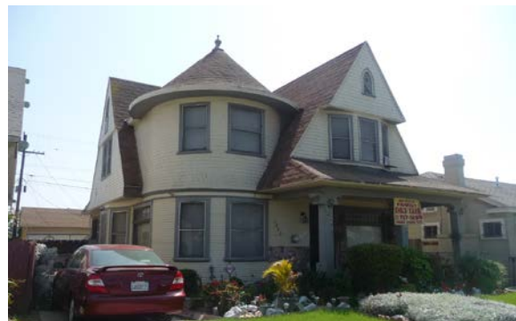
1430 W. 37 th Drive, 1905 (SurveyLA, 2011)

Residences in the Shingle Style are typically found in early neighborhoods surrounding Downtown or in areas such as Venice that were developed as early independent cities prior to their consolidation with Los Angeles. Examples can be found most frequently in the neighborhoods of South Los Angeles including Pico-Union, West Adams, Exposition Park, and University Park. The single-family residences at 824 E. Adams Boulevard and 1430 W. 37 th were constructed in 1910 and 1905 respectively, and both examples feature a prominent turret.