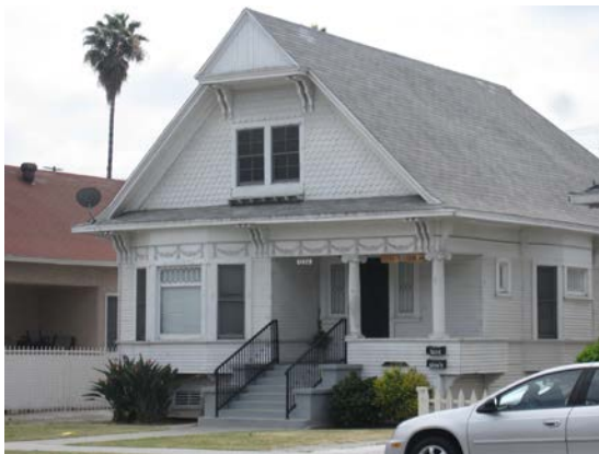
1234 E. Adams Boulevard, 1900 (SurveyLA, 2011)

The one-story gabled cottage first appeared in Los Angeles in the 1870s, although few pre-boom examples survive. The origins of the gabled cottage have been traced to the Greek Revival style house, best represented in Los Angeles by the Banning Residence in Wilmington (L.A. Historic-Cultural Monument No. 25.) The gabled cottage is distinguished from earlier house types in the folk tradition by its temple-like front created by a single, gabled roof. Early examples are typically sheathed with board and batten siding, while later examples have clapboard or shiplap siding.