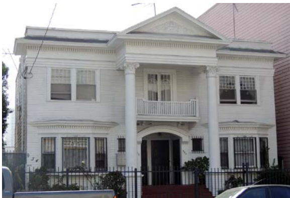
930 S. Albany Street, 1895 (SurveyLA, 2013)

Multi-family residences in the style are often duplexes or fourplexes, such as the one at 930 S. Albany Street in the Westlake neighborhood and at 9813 W. Venice Boulevard in the Palms neighborhood. Both rare examples of early apartment houses in their neighborhoods, these buildings have some of the same features as single-family residence but range from two to three-stories in height. The primary exterior materials, however, are typically stucco or clapboard, or a combination of both.