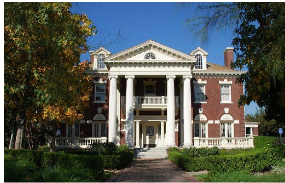
Britt Mansion, 2528 Gramercy Place, 1910

Multi-family residences in the style are often duplexes or fourplexes, such as the one at 930 S. Albany Street in the Westlake neighborhood and at 9813 W. Venice Boulevard in the Palms neighborhood. Both rare examples of early apartment houses in their neighborhoods, these buildings have some of the same features as single-family residence but range from two to three-stories in height. The primary exterior materials, however, are typically stucco or clapboard, or a combination of both.