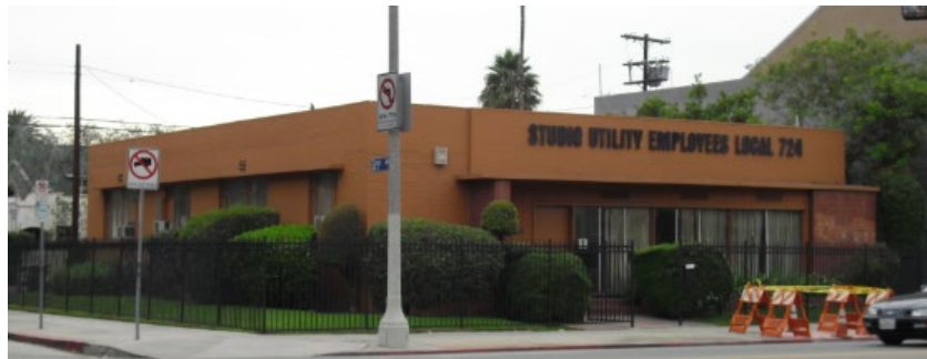
Studio Utility Employees Local 724, 6700 West Melrose Avenue