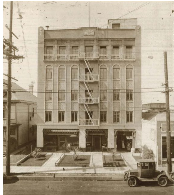
1920s American Federation of Musicians Local 47 Headquarters, 1417 ½ Georgia Street (AFM, Local 47)