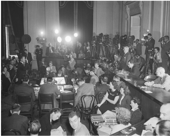
Meeting of the House Un-American Activities Committee (HUAC), 1947.

Panic about the alleged Communist threat in the United States, which became known as the Red Scare, worsened the political climate for labor. In the late 1940s and early 1950s, the Cold War between the