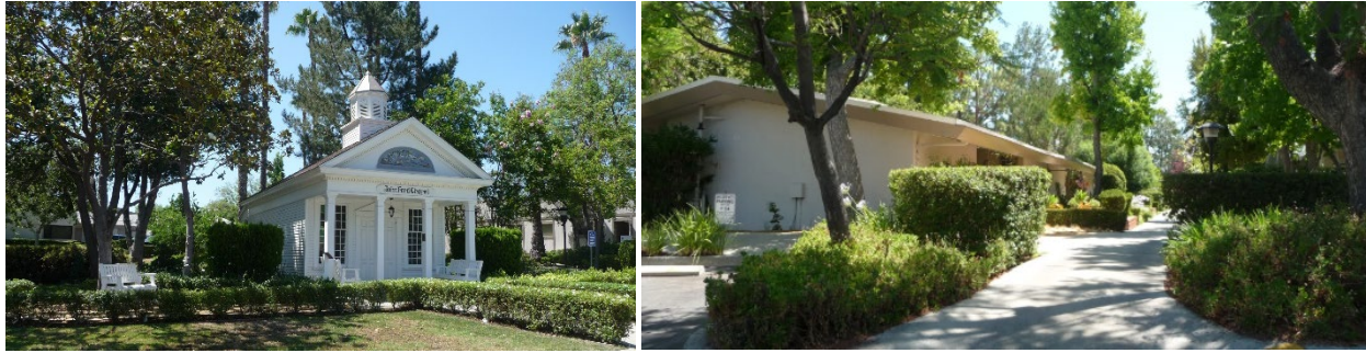
Motion Picture and Television Fund Historic District, Woodland Hills (HistoricPlacesLA)