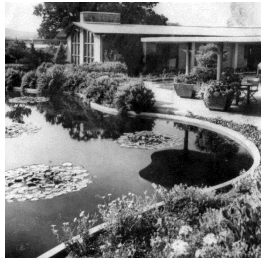
Motion Picture Relief Fund's Country House and Hospital, 1950