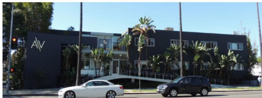
Screen Actors Guild Headquarters, 7750 West Sunset Boulevard

Numerous organizations represented entertainment workers in Los Angeles which have no known extant resources. These include the Motion Picture and Sound Editors, founded in 1953; the Producers Guild of America (formed out of the 1950 Screen Producers Guild and the 1957 Television Producers Guild); 80 the Association of Independent Commercial Producers (AICP), founded in 1972 with offices in New York and Los Angeles; and the Independent Film and Television Alliance, founded in 1980 as the American Film Marketing Association.