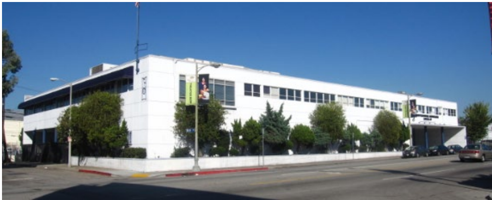
Musicians Union of Hollywood, 807-831 North Vine Street City Historic-Cultural Monument No. 1158 (HistoricPlacesLA)

Moviephone, and other phonograph record makers. On January 21, 1950, AFM Local 47 moved to its new location at 817 N. Vine Street in Hollywood. 40