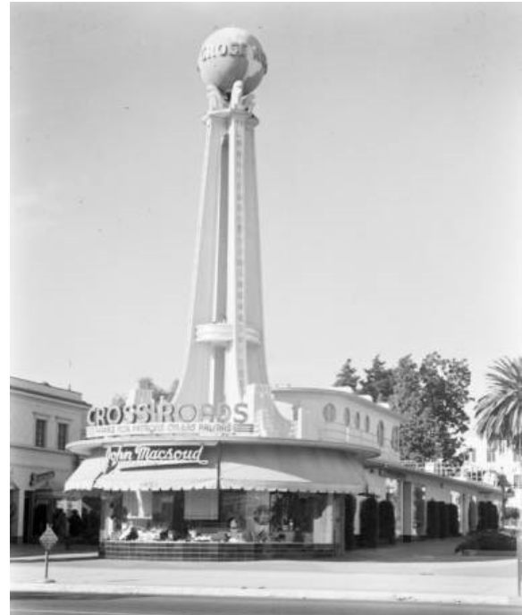
Entrance to Crossroads of the World, 1939 City Historic-Cultural Monument No. 134