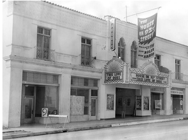
Marquis Theater, 9038 Melrose Avenue, c. 1945.

Movietone, and other sound systems, setting the stage to host advance screenings of as-yet-unreleased motion pictures. 61 Headquarters for the Academy were at 7046 Hollywood Boulevard from 1930 until 1935, when the offices moved to the Taft Building (6280 W. Hollywood Boulevard) and the library moved to North Gordon Street. In 1946, the Academy purchased the Marquis Theatre at 9038 Melrose Avenue (not extant) and moved operations there. The building had a 950-seat theater and space for staff offices and the ever-growing library holdings. Among the Academy's more notable achievements was the annual Academy Award ceremony. 62 In 1973, the Academy began construction on its new headquarters at 8949 Wilshire Boulevard (dedicated 1975) in the city of Beverly Hills.