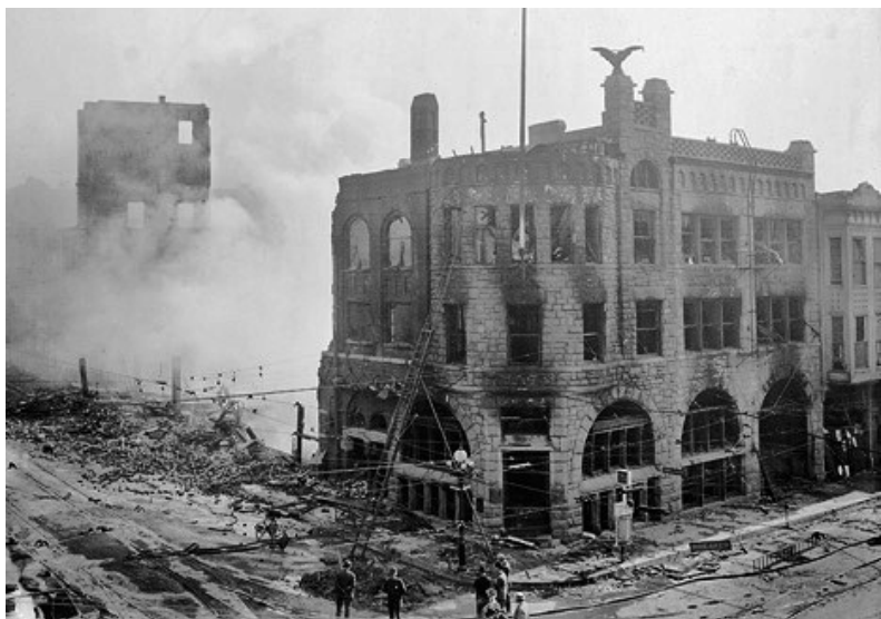
Ruins of the Los Angeles Times building, October 1, 1910.

Both sides consolidated forces during this conflict. The business elite launched a full-blown war against labor unions, seeking to make Los Angeles an open shop city. This campaign was spearheaded by "the disciplined and well-financed juggernaut" of the Merchants and Manufacturers Association (M&M), founded in 1896. 12 By 1900, the M&M had "the support of virtually all of [Los Angeles'] leading shipping, lumber, oil, iron and steel, and haulage firms, as well as the citrus growers in the surrounding countryside." 13