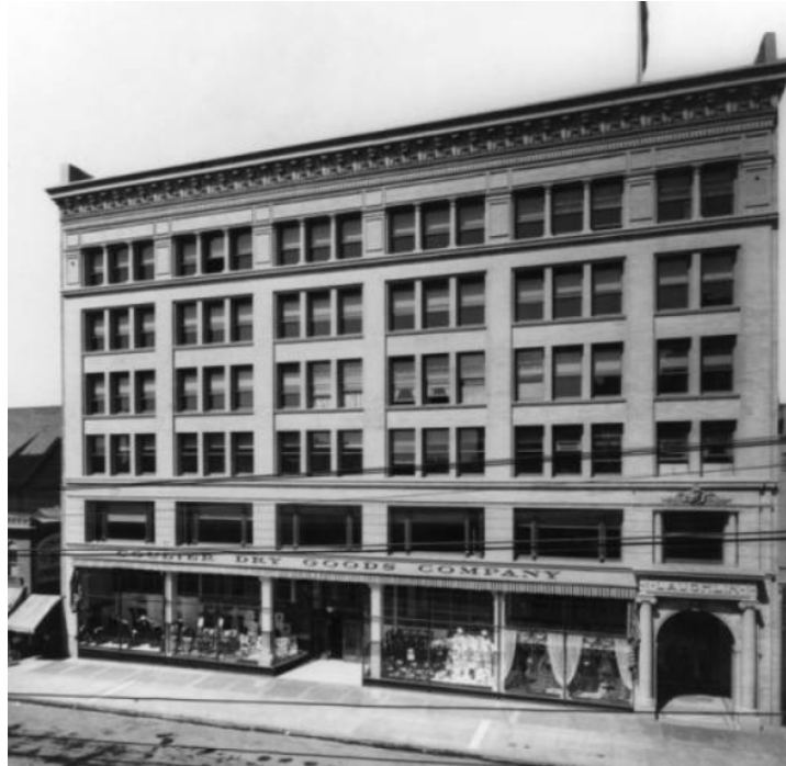
Homer Laughlin Building (Grand Central Market), 315 South Broadway City Historic-Cultural Monument No. 1183