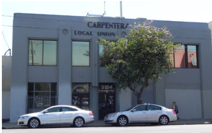
Carpenters Local Union 1506, 5168 W Santa Monica Blvd

Motion Picture Art Directors, which became the Art Directors Guild (ADG). Television art directors were included in 1949, and the organization joined IATSE the same year. 72