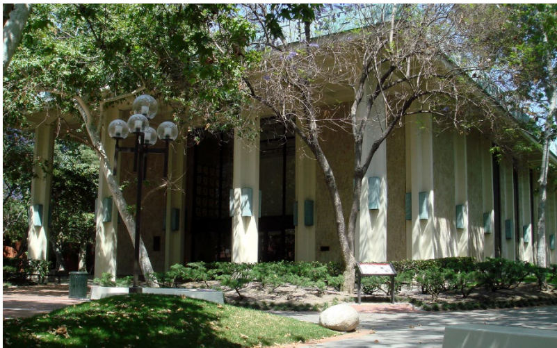
Norris Cinema Theater, University of Southern California