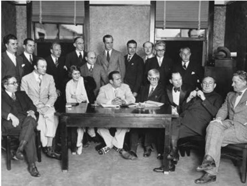
Founding members of the Academy of Motion Picture Arts and Sciences, Douglas Fairbanks seated at center, c. 1927.

proposal to found the Academy of Motion Picture Arts and Sciences. 56 Articles of Incorporation soon followed, and Douglas Fairbanks was elected the first president. 57 Initially, five branches were established: producers, actors, directors, writers, and technicians. “The film industry [...] managed to avoid any real labor strife into the thirties by coopting union sentiments through the Academy of Motion Picture Arts and Sciences.” 58 The Hollywood Reporter noted that the Academy “contributed to an unprecedented era of management-labor cooperation - but it also kept actors, writers and directors from forming unions.” 59 The Academy created the first standard contracts for freelancers and offered arbitration to its members, but was not regarded as a strong advocate for actors’ rights.