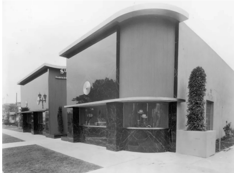
Hollywood Reporter Building, 6713 Sunset Boulevard, City Historic-Cultural Monument No. 1151

Although established daily newspapers often had buildings designed specifically for the production of newspapers, such as the 1930 building in Hollywood for the Hollywood News , the new location for The Hollywood Reporter was neither designed for use as a newspaper building nor even dedicated solely to that function. The building was mixed in use with men's haberdashery and barber shop on the ground floor when the Hollywood Reporter first opened its offices, although these retail and service spaces were soon vacated as the paper expanded. 86