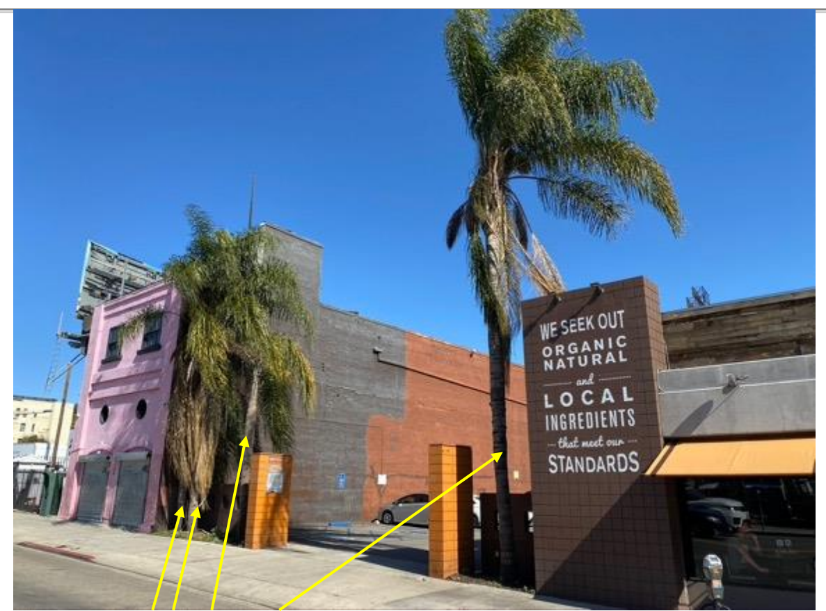
The four (#1, #2, #3, and #4) Queen Palm trees on the Cahuenga Blvd side of the property