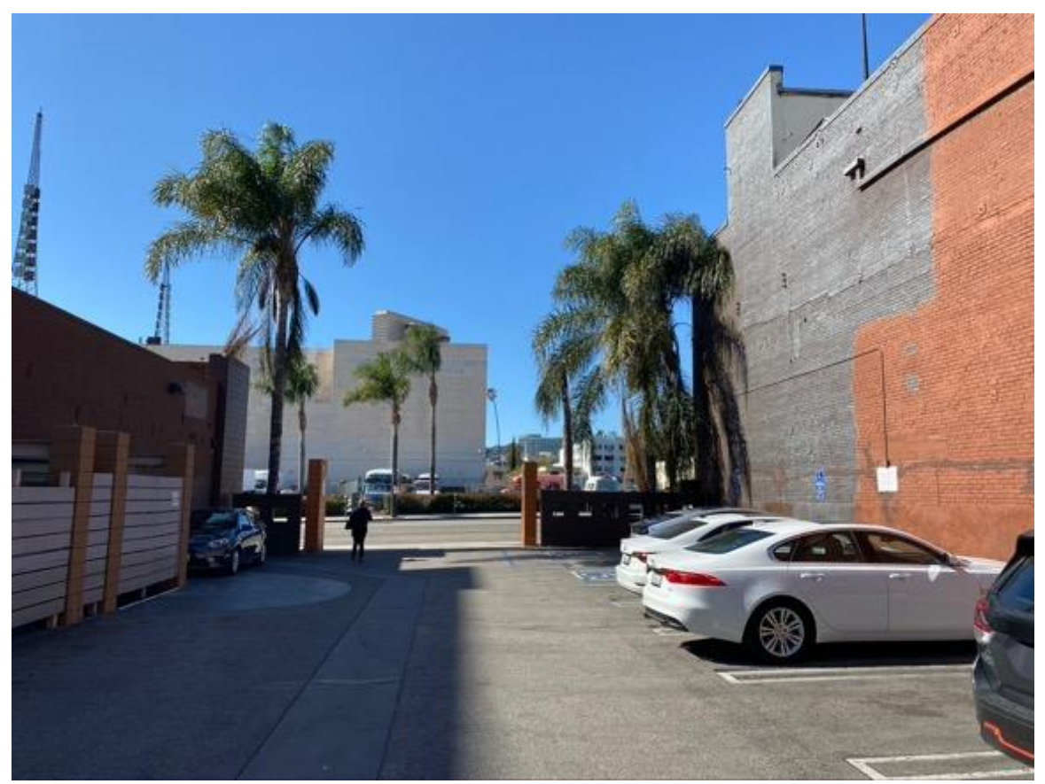
The four Queen Palm trees on the Cahuenga Blvd side of the property