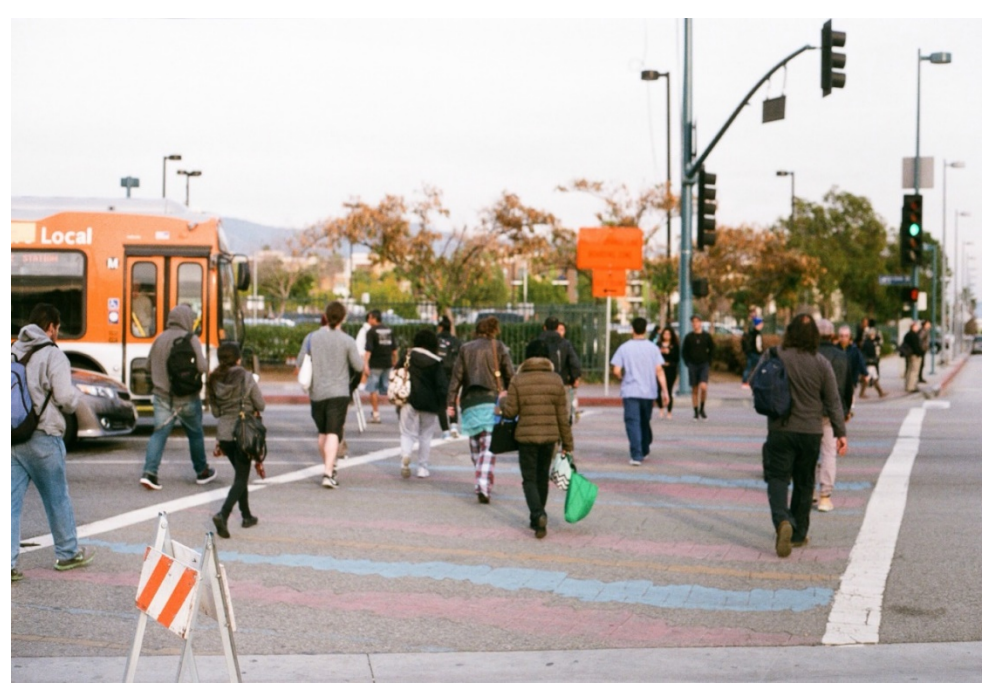
Figure 7 - The North Hollywood Transit Station