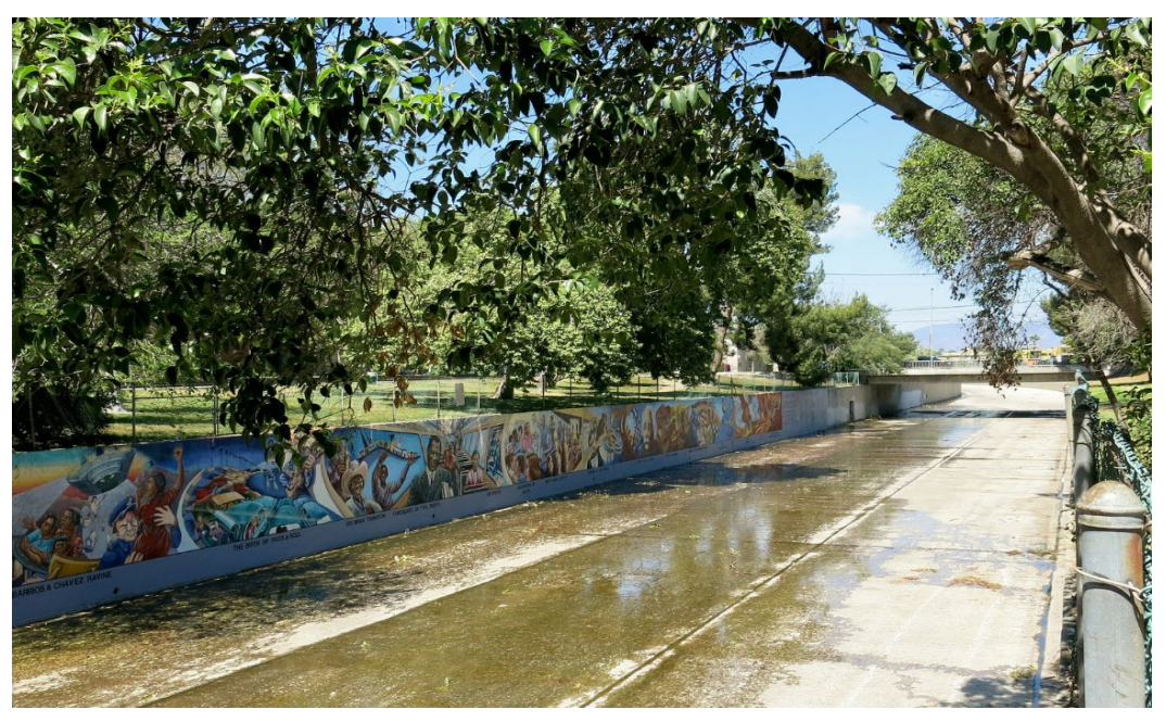
Figure 11 - The Tujunga Wash