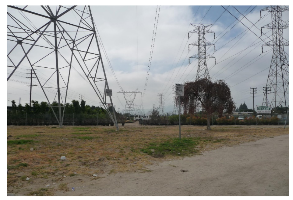
Figure 10 - Whitnall Highway Power Corridor