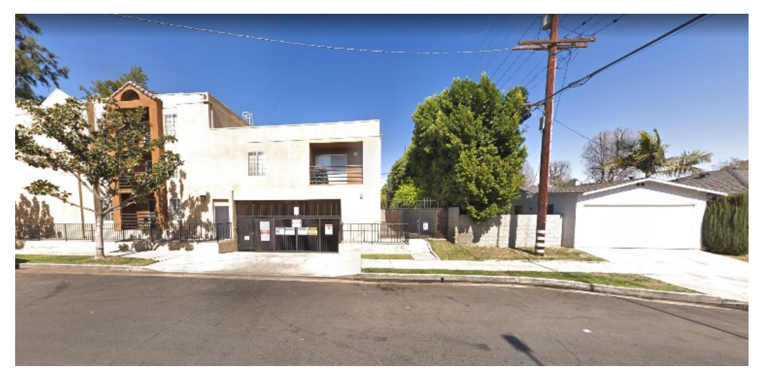
Figure 3 - Appropriate transition between multifamily and single-family homes