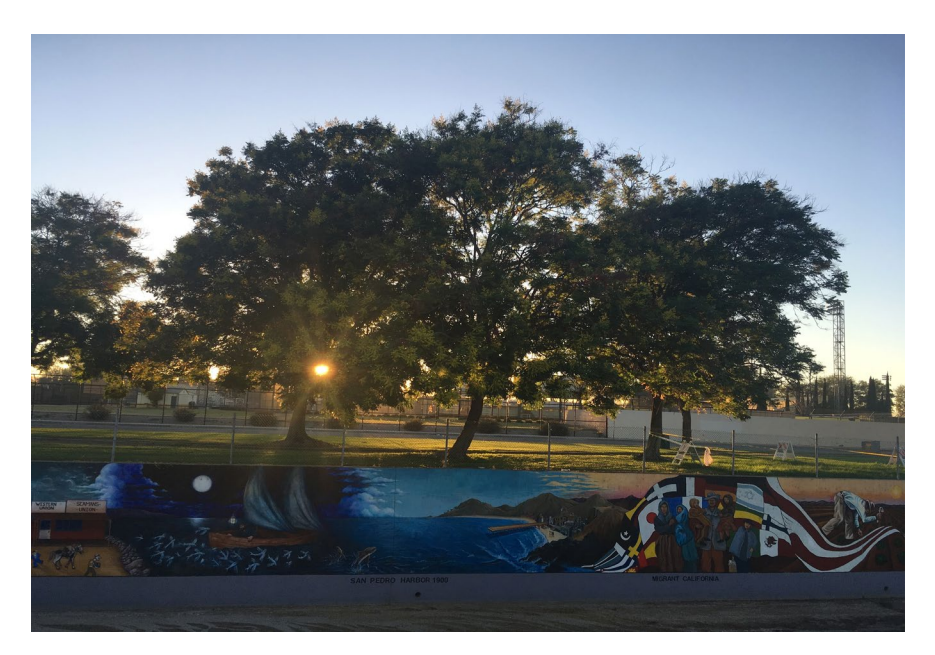
Figure 5 - The Tujunga Wash represents an opportunity for expanding and improving open space in the plan area