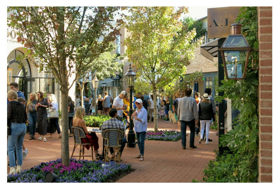
Figure 4 - Palisades Village