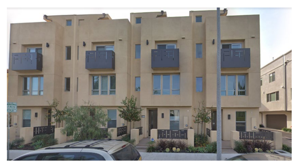
Figure 5 - Small lot homes are viewed as an opportunity to provide more affordable housing opportunities