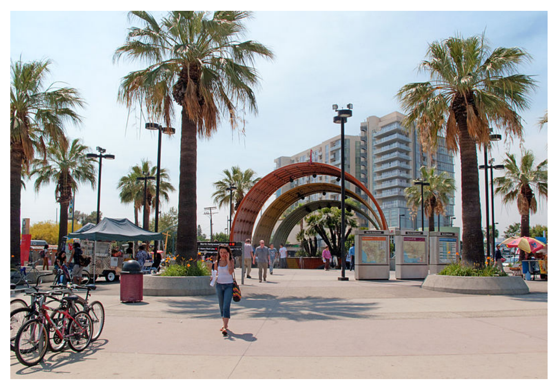
Figure 2 - Higher density housing near North Hollywood Station