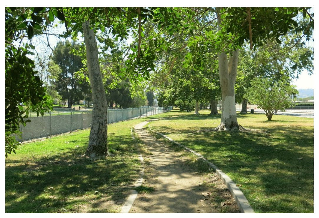
Figure 3 - The Tujunga Greenway