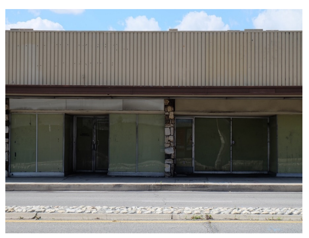
Figure 6 - Vacant storefronts in Valley Plaza