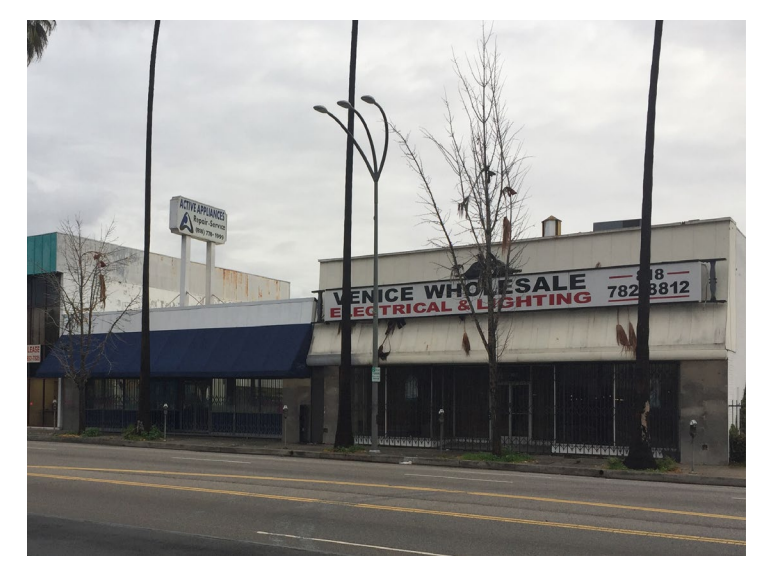
Figure 2 - Mixed-use development on Van Nuys Blvd. could reduce the number of vacant storefronts