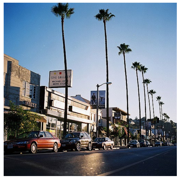
Figure 16 - Ventura/Cahuenga Boulevard is a major commercial corridor in the plan area.