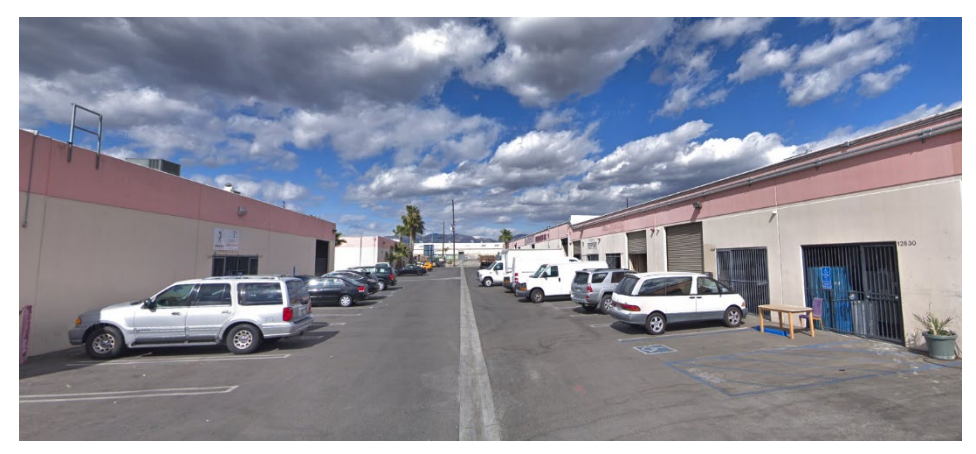
Figure 12 - An Industrial park off Raymer Street in North Hollywood