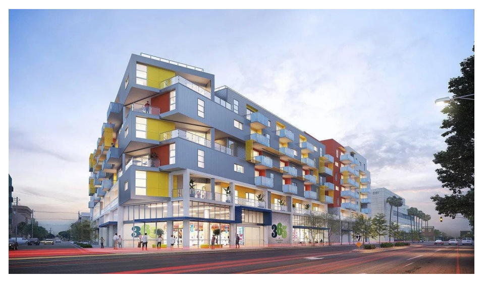
Figure 2 - Forthcoming Lankershim+Otsego mixed-use project in NOHO Arts District Image Source: DE Architects