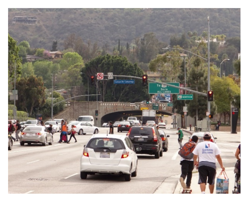
Figure 10 - Lankershim Boulevard near the freeway on-ramps