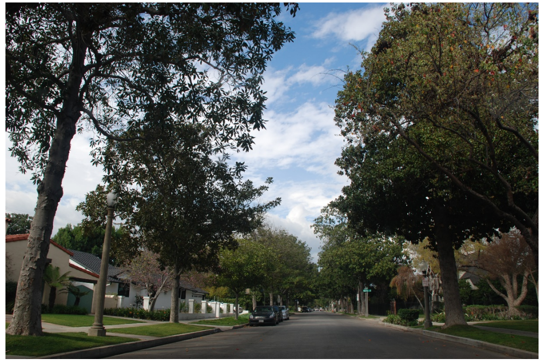
Figure 1 - Single family neighborhood in Toluca Lake