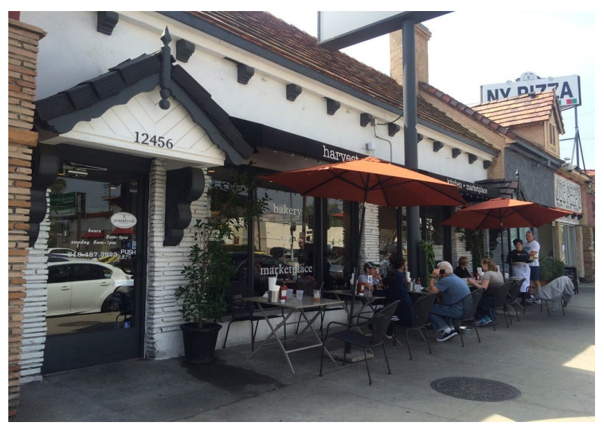
Figure 5 - Businesses along Magnolia in Valley Village