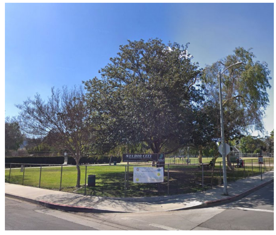
Figure 14 - Studio City Recreation Center was cited as a valuable place in the community