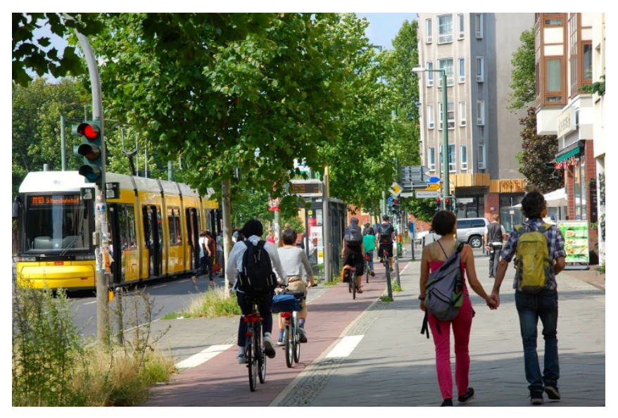
Figure 11 - Many stakeholders mentioned the need to enhance the pedestrian experience