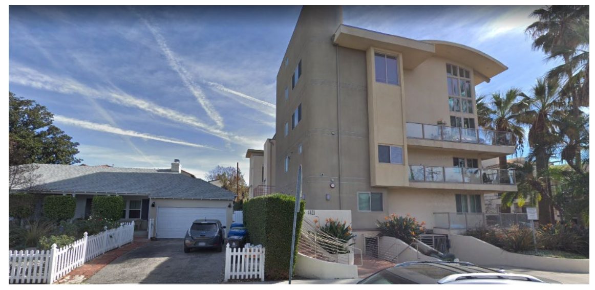
Figure 4 - Poor transition between multifamily and single-family homes.