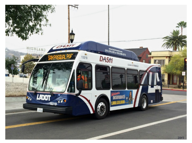
Figure 8 - People feel the DASH bus services could be improved.