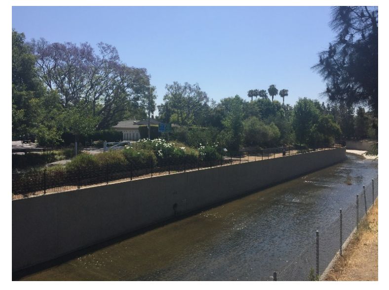
Figure 15 - People view the LA River as an opportunity to add more open space.