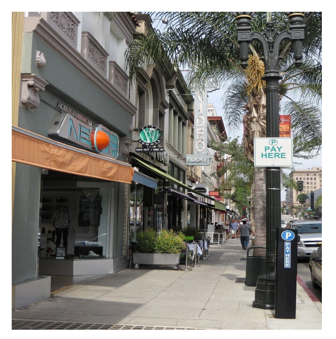
Figure 3 - Participants prefer business districts with interesting streetscapes, pedestrian amenities and a variety of stores

4. Participants say most Van Nuys-North Sherman Oaks residents commute outside the plan area for work, although they would prefer to work closer to home if possible. Some cited the plan area's lack of suitable building types, such as Class A office space and facilities for TV/film production, as a significant barrier to providing more jobs in the community.