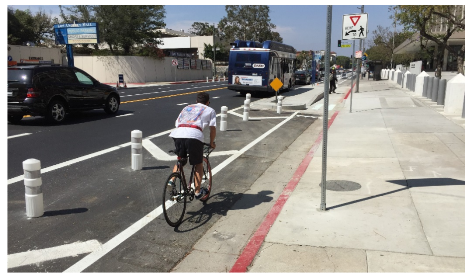
Figure 12 – Cyclist using protected bicycle lane