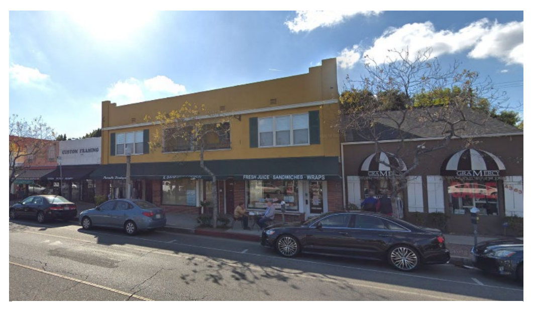
Figure 6 - Local retail options along Tujunga Avenue