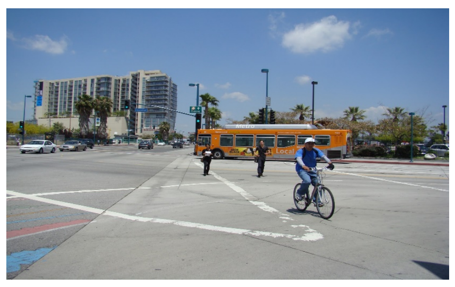
Figure 1 - The North Hollywood Transit Hub