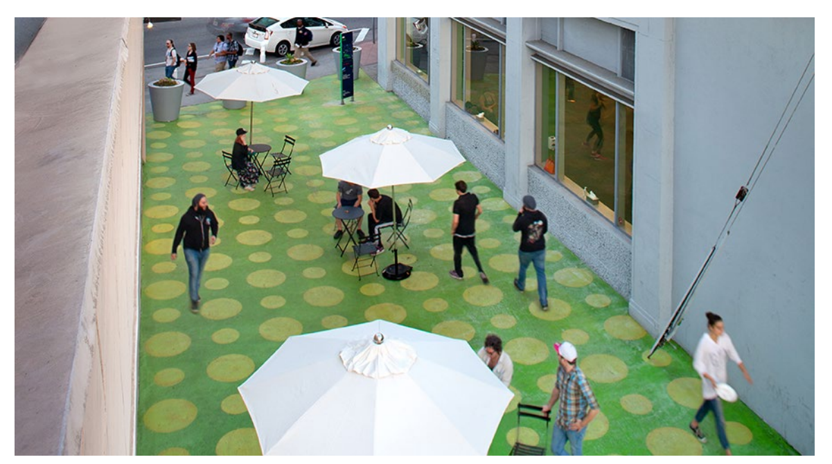
Figure 13 - More gathering places, such as plazas and paseos, were cited as needs for the community