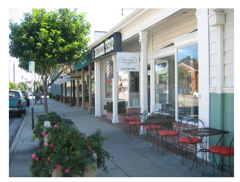
Figure 7 - Pedestrian friendly commercial corridor in Toluca Lake