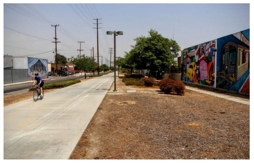
Figure 9 - The Chandler Bikeway in North Hollywood