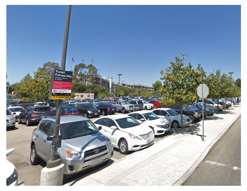
Figure 4 – Although Metro studies indicate that occupancy of parking lots at the Orange Line Sepulveda and Van Nuys stations is well below capacity each day, stakeholders expressed uncertainty about parking availability and cited that as a reason for not using public transit.