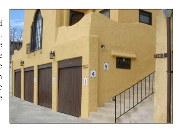
Example of plaque location mock-up

The artwork is sent to the City for review and approval by the Cultural Heritage Commission. The applicant shall also e-mail to the plaque coordinator a digital photograph indicating the desired installation location of the plaque. The location shall be approved by the Commission and/or the Office of Historic Resources to ensure visibility by the public and compatibility with the Monument.