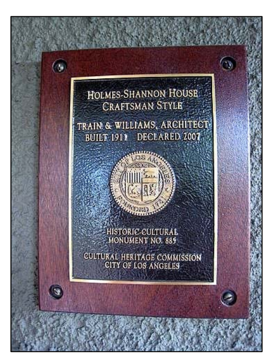
Historic-Cultural Monument Plaque

In some instances, a Monument may not warrant the listing of the builder if it is unknown; or the architectural style if the resource is a landscape feature (e.g. tree, rock, etc.). There may also be multiple architects associated with a resource and it may be more appropriate to list the firm name of the architect and not specific individuals associated with the project. Many of these types of plaque requests are handled on a case-by-case basis.