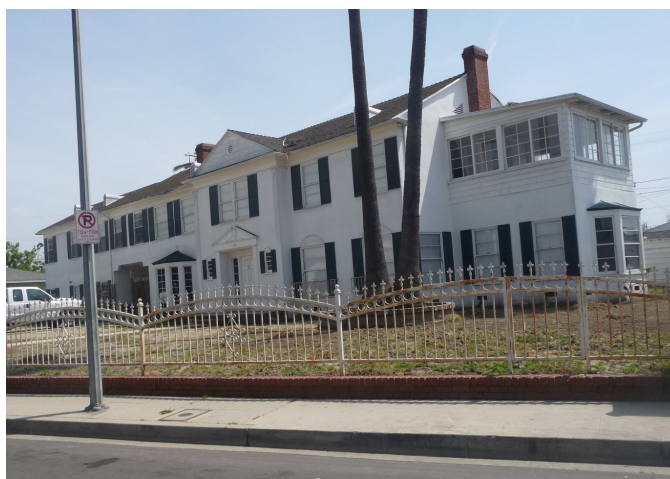
The Colonial Revival residence of Eddie “Rochester” Anderson in West Adams

1924 W. Rochester Circle , the grand Colonial Revival residence of Eddie “Rochester” Anderson, an African-American actor and comedian best known for his long-running role on radio and television in “The Jack Benny Show”. The house was designed by Paul R. Williams and constructed in 1941.