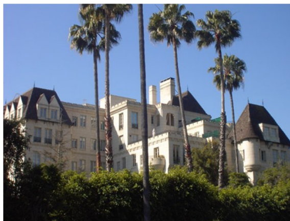
This year's HPOZ Conference took place at the elegant former Chateau Elysee

sion topics vary yearly, and we strive to keep the topics fresh for those who attend annually, while still covering basic information for those needing an introductory course on historic districts.