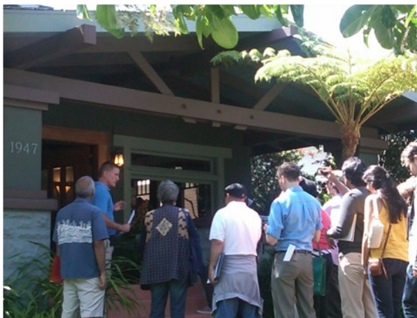
The Hollywood Grove HPOZ walking tour, one of three neighborhoods visited

To foster idea-sharing in a more informal setting, this year we introduced lunchtime discussions that took place in small groups. The conversation on sustainability projects for historic homes touted the significance of eco-audits, and recent challenges with permit violations made it clear that prevention via neighborhood outreach is critical.