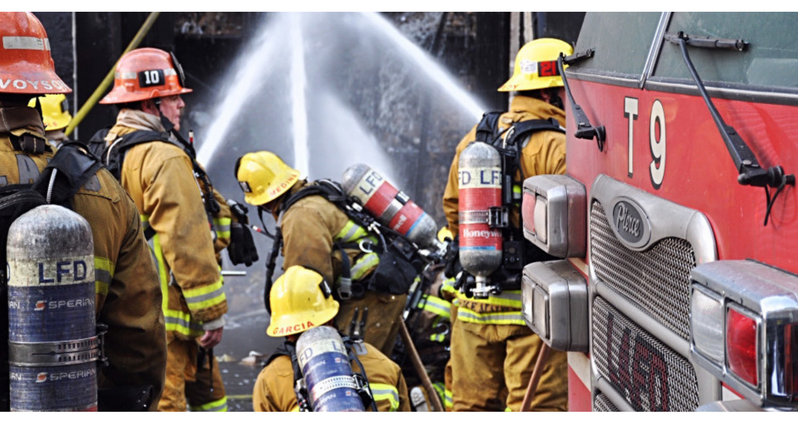
Los Angeles Fire Department responding to a structure fire.

The Los Angeles City Fire Department was established on February 1, 1886. Thirty firefighters, most of them former volunteers, were hired to man four leased firehouses. In addition, volunteer units were retained in the less populated areas outside the central city, including the San Fernando Valley. From the beginning the Department was an innovative, progressive agency which sought to secure the latest equipment, utilize the latest techniques and to develop better methods for fire fighting and prevention.