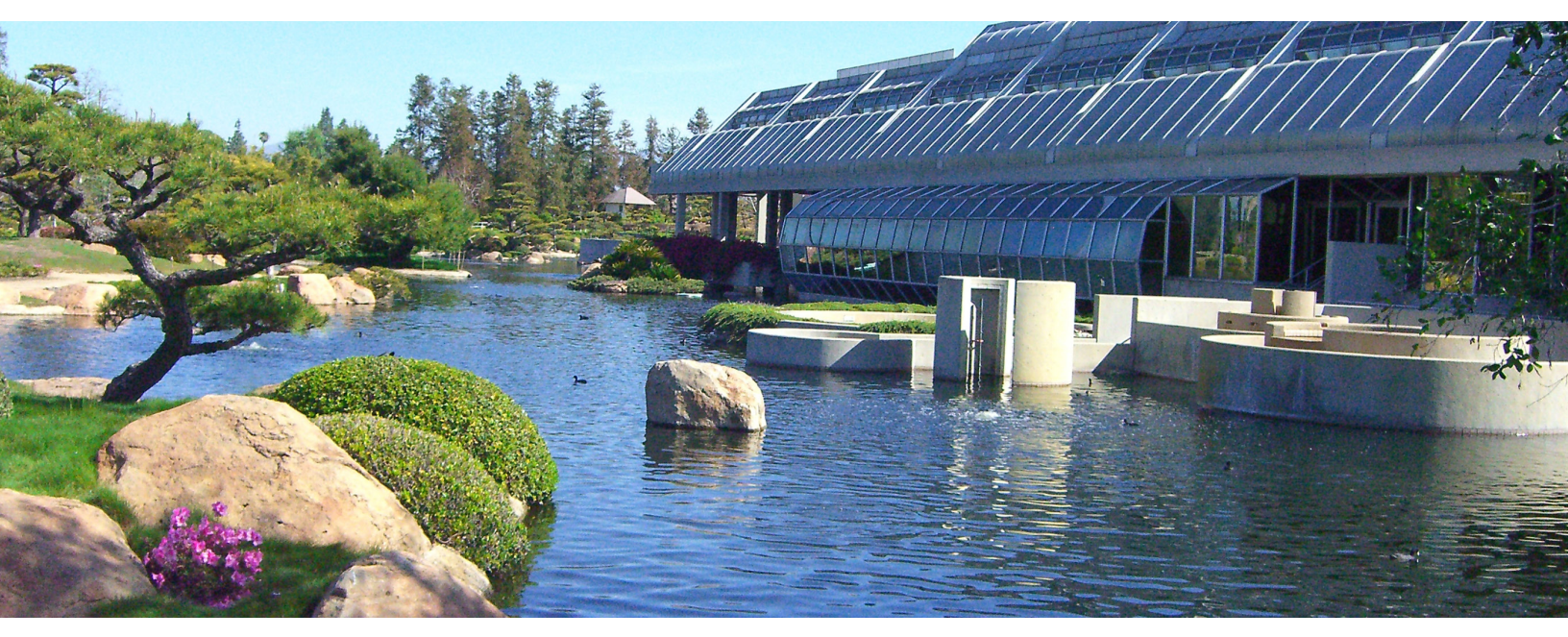
Donald C. Tillman Water Reclamation Plant and Japanese Gardens

Ecological systems. Environmental considerations are an important part of flood control systems. As the Los Angeles flood control system neared completion and public demand for water supplies, recreation and beautification increased, Congress provided for multiple use of facilities. By the 1960s watershed protection, electrical power, recreation, agriculture and water storage were integral secondary uses of flood control systems and considerations in flood control systems planning. Paving of the Los Angeles River bottom, and City in general, reduced groundwater recharge. To compensate for the loss, water spreading grounds were established to replenish underground aquifers. Three sections of the Los Angeles River have unpaved bottoms partially due to the existence of natural springs. These sections and dam basins provide natural habitats for wild animals and birds. The dam basins also provide land for recreation and agricultural uses. Sand bars, trees and heavy marsh growth provide protected habitats for water birds. Fish live in the river channel. Until 1984, the Los Angeles River channel, except for the unpaved sections, virtually was dry except during the rainy season. Upon completion of the San Fernando Valley Donald C. Tillman Wastewater Reclamation Plant (1984) a continuous flow of reclaimed water was sent down the channel creating a year round stream which has regenerated plant and animal