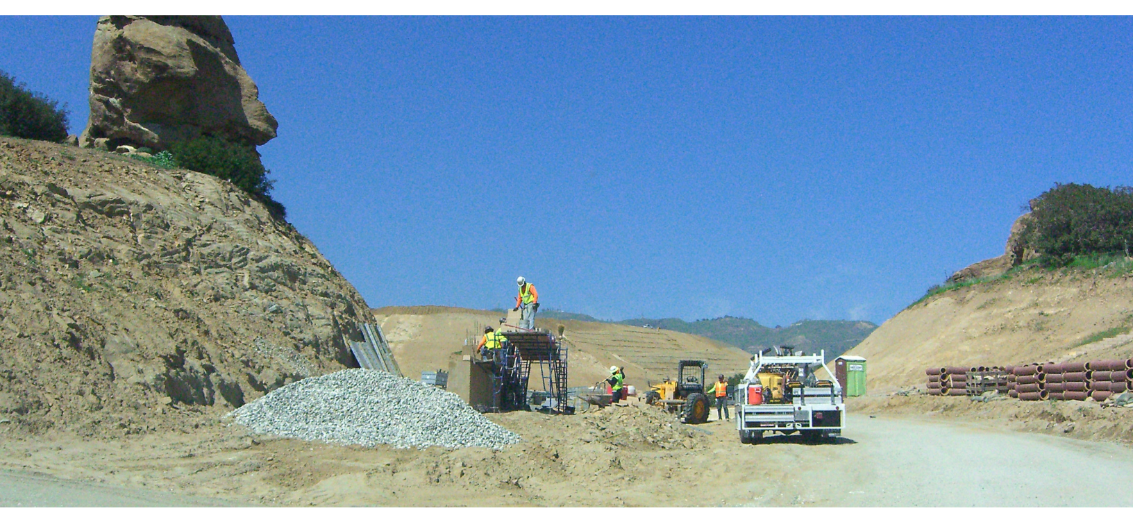
Hillside grading in the western San Fernando Valley .

The principal tools for mitigation of geologic hazards is the City's Municipal Code, including the Building and Zoning Codes. In 1929 the Building and Safety Department began to compile and correlate data on soil conditions for distribution to realtors,