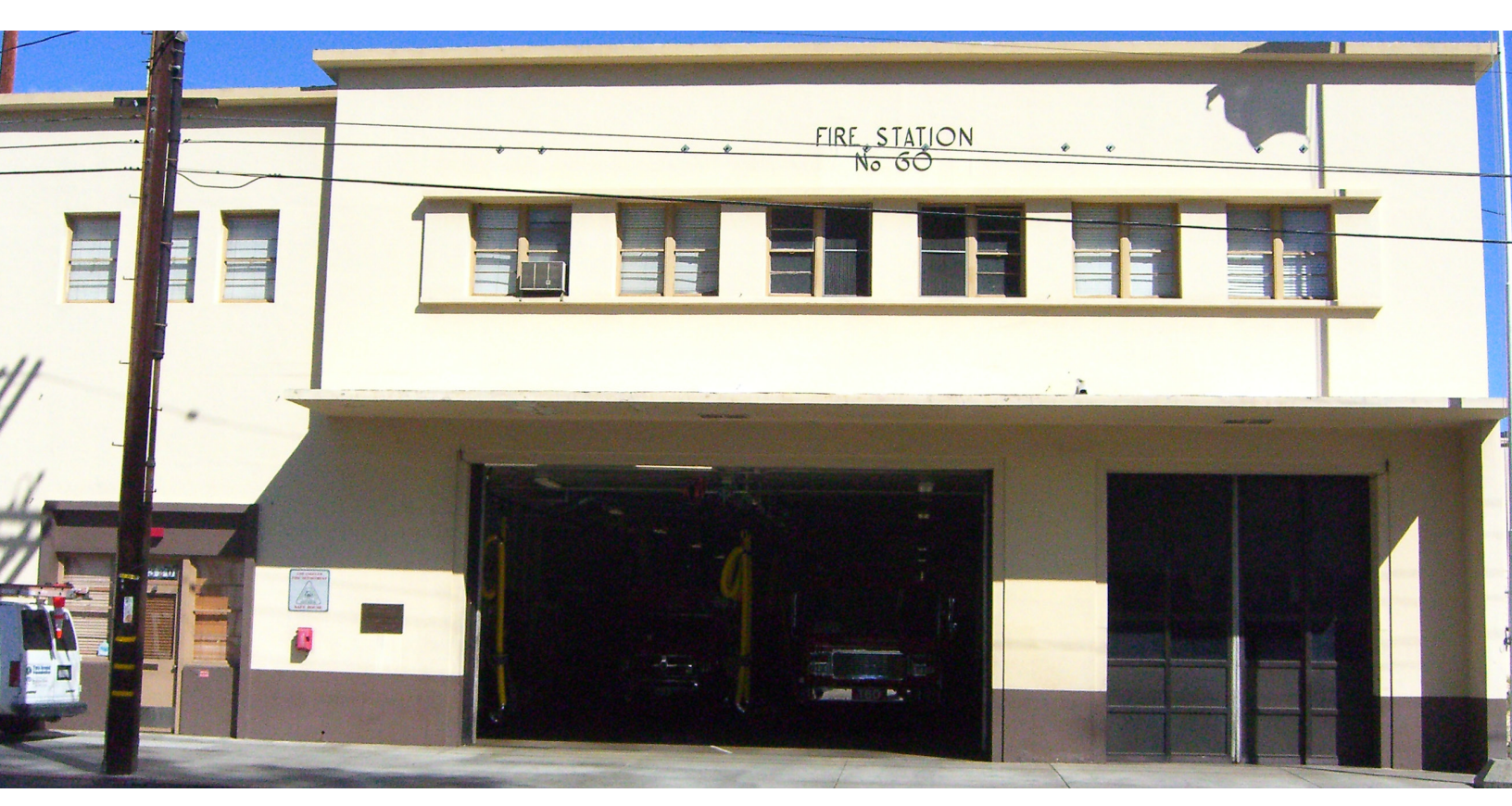
A fire station serving the North Hollywood community.

Today the City's approach to preventing and mitigating wildfire risk includes building standards, brush clearance, roadway requirements, parking restrictions, zoning limitations, and many more interventions detailed below.