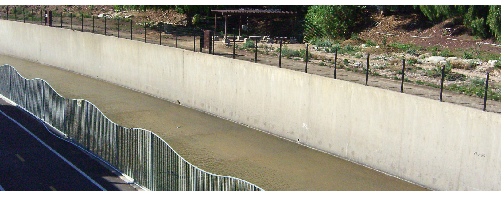
The Los Angeles River in Studio City, once a source of frequent flooding, now serves as a transportation and open space resource.

Capital floods. Major storms which cause a high magnitude of water flow can be devastating to a wide geographic area. They are the most dramatic and potentially the most hazardous water activity confronting the City. The Los Angeles region is a semiarid region with rainfall that can have dramatic variation from year to year. Rains tend to occur in heavy, short duration storms between November and April. Severe storms are periodic and may not occur for several years. Paving of the City with structures and impermeable surfaces has reduced natural ponding areas which allowed water to