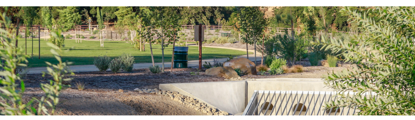
Stormwater infrastructure in Chatsworth Park South.

Generally short term goals are targeted for 0-5 years, medium term goals are 5-10 years, and long term goals are expected to take 15+ years to implement. A listing of department abbreviations is available in Appendix A.