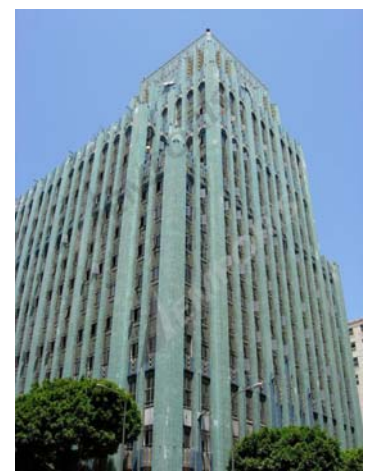
Eastern Columbia Building— A Mills Act property in Downtown's historic core that has been adaptively re-used as live-work units.

Angeles for a revolving ten-year term, agreeing to restore, maintain and protect their property in accordance with historic preservation standards in exchange for a potentially significant reduction in property taxes. Qualifying proper-