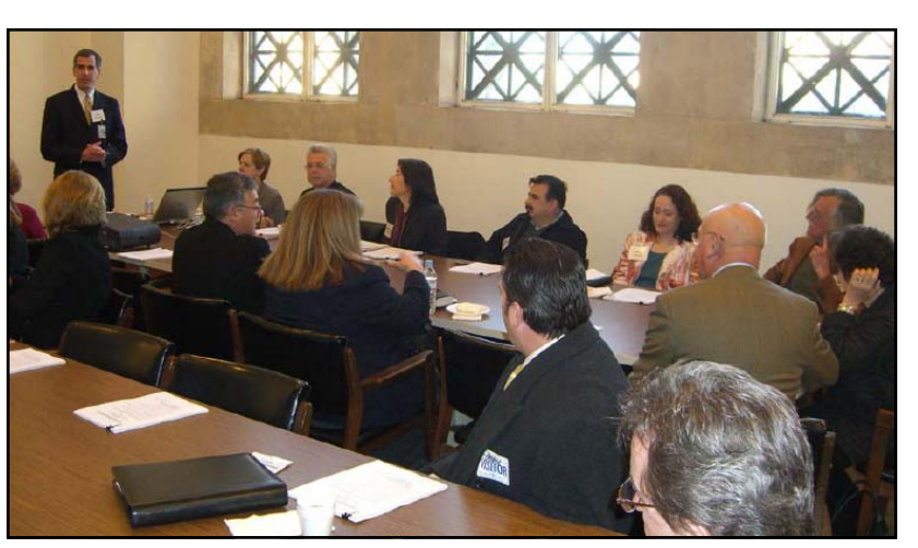
The Office of Historic Resources has created a 25-member Survey Project Advisory Committee, shown here at its first meeting, to provide ongoing input from Los Angeles' business community, neighborhood leadership, and top preservation professionals.

make it possible to conduct a survey in a city with the size and complexity of Los Angeles. State and Federal guidelines on historic resource surveys now strongly recommend preparation of a context statement to structure large-scale survey projects. A survey of the entire City of Los Angeles cannot merely proceed neighborhood by neighborhood and look at each property in a vacuum; the use of a context statement enables a more methodical, thematic approach that will streamline the survey process.