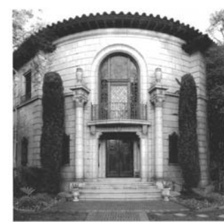
Petitfils-Boos Residence— A high-design property that will use its Mills Act savings to help support a significant rehabilitation

A recent Los Angeles Times article featuring the Mills Act has brought a great deal of attention to the pro-