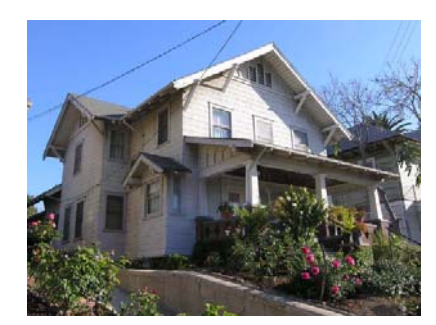
A Mills Act property within the Angelino Heights HPOZ.

gram. Last year, the Office of Historic Resources processed 51 contracts, which was the program's biggest year ever. Applications are ranked by priority consideration criteria to ensure that the program is benefiting targeted properties.