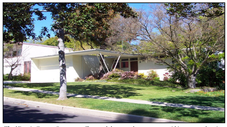
The Historic Context Statement will ground the survey's assessments within a comprehensive framework detailing Los Angeles' key property types, such as the post-World War II Modernist housing found in the Gregory Ain Mar Vista Tract HPOZ.

held computer database containing detailed information on bungalow courts throughout the city, assisting them in determining whether the particular example before them meets specific eligibility standards. The Field Guide will therefore be critical to ensuring that large survey teams apply consistent, objective evaluation criteria across the entire city.