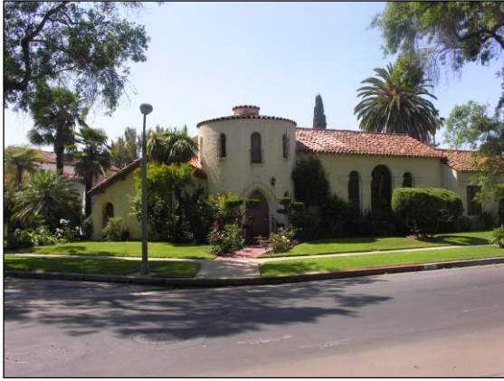
Carthay Circle Historic Preservation Overlay Zone (Office of Historic Resources)

architecture rooted in other places, from colonial New England to medieval Europe to an Arabian sheik's Kasbah. Period Revival neighborhoods were the standard in Los Angeles during the 1920s and 1930s and as such, the most intact of these neighborhoods represent the city as it looked during this critical period of development.