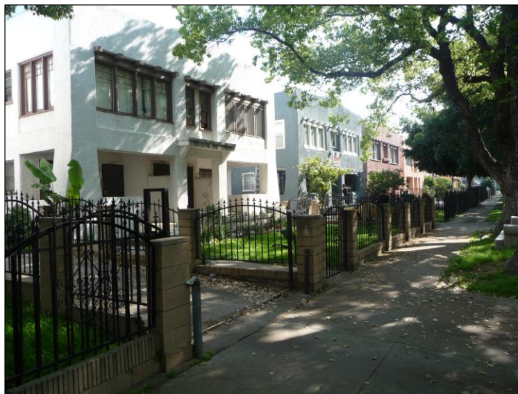
Exposition Park Square Historic District in South Los Angeles (SurveyLA)

The prevalence of Period Revival, American Colonial Revival, and Mediterranean and Indigenous Revival architecture in multi-family property types can be attributed to the popularity of these styles developed between 1918 and 1942, a period when Los Angeles grew dramatically. Period Revival styles were ideal for accommodating the requirements of multi-family housing, including multiple unit entrances and irregular fenestration patterns. Though a range of architecturally significant multi-family property types were constructed in Period Revival and related styles throughout the city during this period, districts and concentrations of multi-family housing built between 1918 and 1942 are rare in Los Angeles. Apartment buildings were an uncommon response to population growth in Los Angeles, where even in the 1920s much of residential development was low density in character and set farther from the inner city. 75 During the period, the population of the city boomed and multi-family residences were often constructed as “infill” development in areas that were previously developed with single-family homes, leading to combinations of property types on a single block, but rarely leading to the development of Period Revival multi-family residential neighborhoods. The few Period Revival multi-family residential neighborhoods that exist are distinguished by the consistency of a single architectural style across a single district.