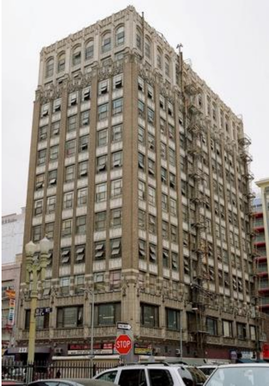
Garment Capitol Building, constructed in 1926 (Office of Historic Resources)

Gothic Revival architecture was one of the earliest Period Revival styles, gaining popularity in the late eighteenth century and remaining a preferred style of ecclesiastical, educational, and other institutional architecture through the nineteenth century. In the nineteenth century, the Gothic Revival spread across the United States initially as the style for church buildings. Its visual references to old world roots made it a popular style for educational and institutional buildings that needed to convey continuity with tradition. The popularity of the style continued through the twentieth century, ending in the 1940s when Gothic forms were abstracted into the geometric style of Art Deco. By the 1950s, the Gothic Revival fell out of fashion in favor of the technological sophistication and simplicity of modernism. 52 The Gothic Revival style was not common in Los Angeles until the decades following the First World War, the final period of the style's general popularity. From the 1910s until the 1940s, every prominent architect of the era in Los Angeles designed buildings in the Late Gothic Revival style.