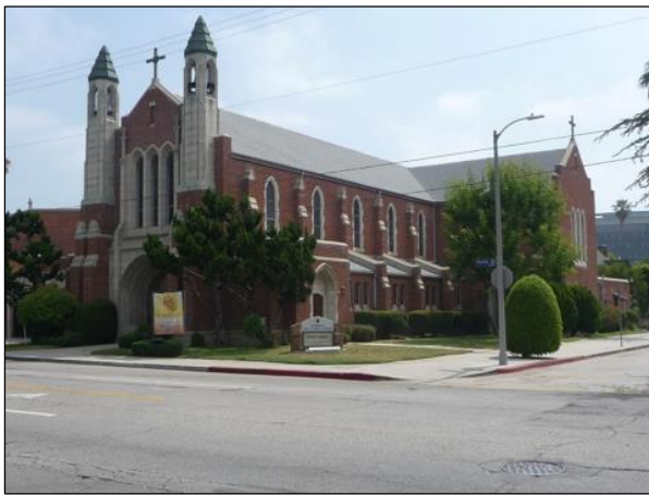
St. Paul's First Lutheran Church, constructed in 1933