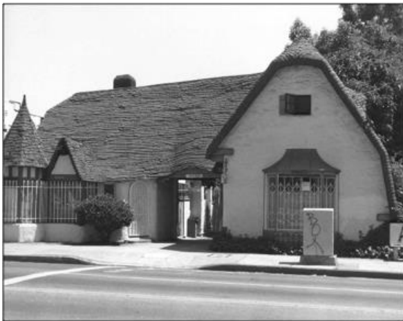
Einar C. Petersen Studio Court, constructed in 1921

Dream-drenched escapees from sobriety and responsibility looked to Los Angeles for their own happily-ever-after denouements. They would come here and build storybook houses that expressed their childlike credulity, lively imaginations, and irrepressible gaiety. 34