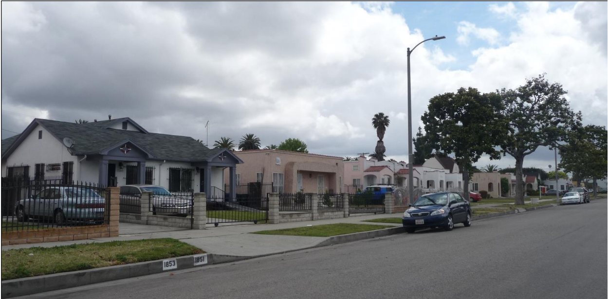
Browning Duplex Historic District in South Los Angeles (SurveyLA)

elaborate architectural detailing only on their primary, street-facing facades. Courtyard and L-shaped plans are common. Single exterior entrances leading to multiple units, giving the multi-family residences an appearance of single-family homes. This type of concentration is found along streets such as Crescent Heights Boulevard, Olympic Boulevard, and Sycamore Avenue to name a few.