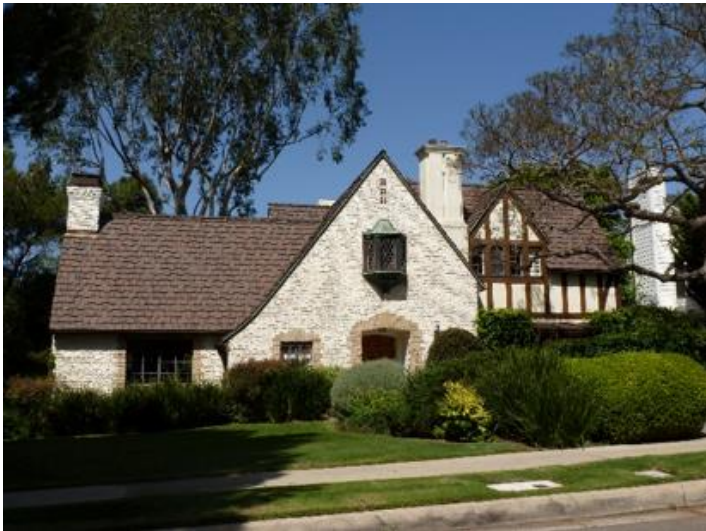
Glenbarr Avenue house, constructed in 1932

the Tudor Revival became a popular style of domestic architecture, particularly for large single-family residences in the 1920s. 46