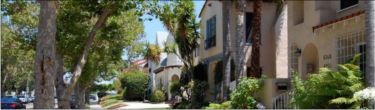
Streetscape of Period Revival duplexes in mid-city

As the population of Los Angeles expanded exponentially from 1918 to 1942, multi-family property types were constructed throughout the city in popular styles of the day to meet increasing demand for housing. Though entire districts of multi-family housing were rare in Los Angeles, these significant concentrations of Period Revival styles and historicist styles reflect a distinctive period of growth and development pattern in the city where dense corridors of rental housing provided a variety of people in Los Angeles with an opportunity to take part in the architectural fantasies of the styles.