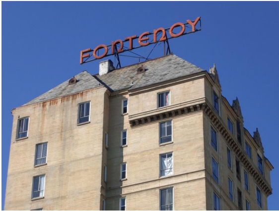
Fontenoy Apartments, Hollywood, constructed in 1929 (SurveyLA)

War veterans' first-hand experience in Europe created a desire for the style and a financially viable way to achieve it.