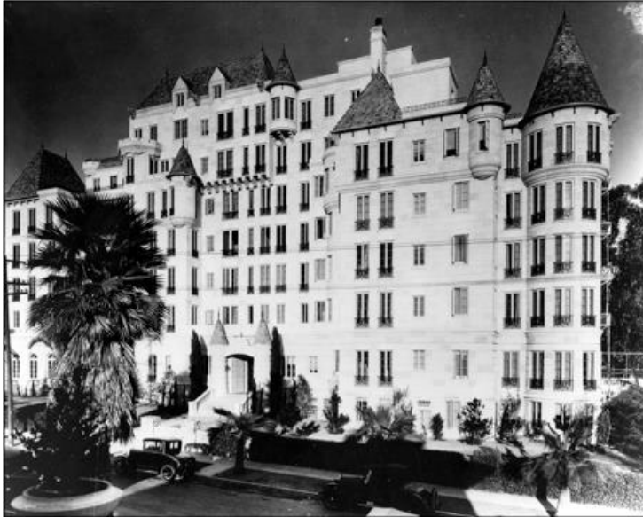
Château Élysée, Hollywood, designed by Arthur E. Harvey in 1927

single building. 16 In a completely undeveloped landscape, designers of apartment buildings, single-family house tracts, and commercial buildings could aggregate design elements of past eras to communicate an impression of European glamour, sophistication, and permanence. 17 While nineteenth century Period Revival styles attempted to impress and express authority, grandeur, and wealth, twentieth century Period Revival style buildings in Los Angeles communicated that the city was a canvas for creative energy; a raw space where newcomers could feel unbound by tradition or accurate historical precedents.