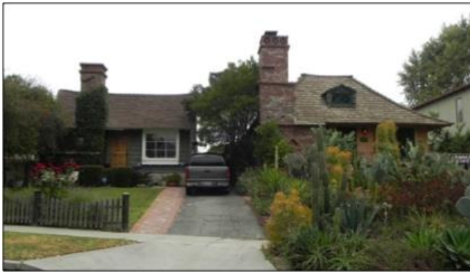
Fantasy Cottage Thematic Group, circa 1947-1950

bungalow court property type, the clustering of the detached bungalows, suggesting a village, and overgrown landscaping expressed the Storybook style. Meandering pathways provided opportunities for picturesque surprise and a village-like feeling. In a reflection of the fictional references the style evoked, several Storybook buildings were given names referencing fairytales, such as Hansel and Gretel. Buildings appeared in advertisements described as English Country Cottage, Cotswold Cottage, Hansel and Gretel, Fairy Tale House, Disneyesque, Hobbit House, and Storybook House.