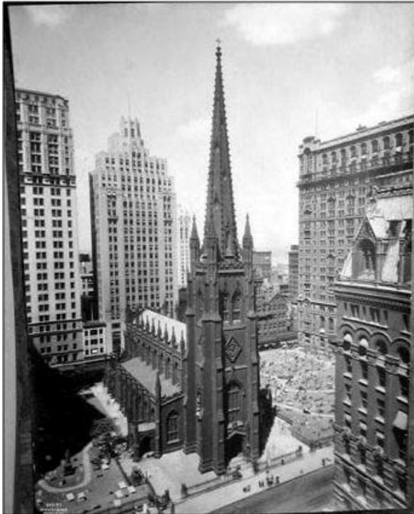
Trinity Church, New York City, designed by Richard Upjohn in 1839-1846

Period Revival architecture began as a reaction to industrialization in the nineteenth century and was inspired by a nostalgia for a past age separate from modern life. As the architecture moved from the United Kingdom across the United States to California, Period Revival evolved into a free, eclectic collection of styles embodying the fantasy, creativity, industry, and use of style as salesmanship that defined Los Angeles before World War II.