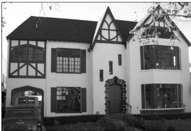
Oliver Flats duplex (SurveyLA)

In Los Angeles, the Late Tudor Revival style comprises buildings that form a bridge between the Arts and Crafts movement, rooted in authenticity, and Period Revival styles, rooted in evocative fantasy. The Late Tudor Revival style was usually chosen for demonstrating tasteful restraint and traditionalism with decorative elements. Its popularity continued through the Great Depression as a style that was neither extravagant nor austere. Its association with traditional domestic English architecture led to its popularity as a style of nostalgia, harkening back to simpler times. As a Period Revival style, the popularity of Late Tudor Revival corresponded to what historian Leland Roth describes as an "...era in which technological and financial changes...were reshaping the whole of American culture. Such houses were a defense against what is now sometimes called future shock; they were safe and secure refuges in a culture in rapid flux." 42