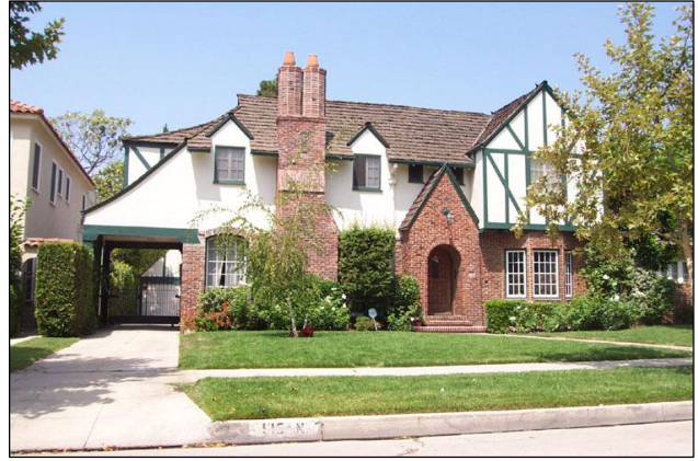
Hancock Park Preservation Overlay Zone (Office of Historic Resources)