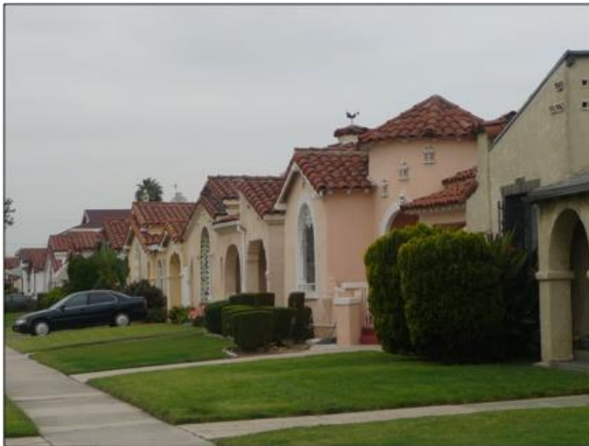
Vermont Knolls Historic District in South Los Angeles (SurveyLA)

Period Revival neighborhoods are subdivisions and tracts of land developed between 1918 and 1942 with concentrations of residences designed in the Period Revival styles discussed above, as well as those discussed in the themes for American Colonial Revival, Mediterranean and Indigenous Revival, and to a lesser extent, Exotic Revival. In the decades between the two world wars, Los Angeles experienced phenomenal population growth and residential development boomed to meet the demand for housing. This period corresponded to the time these styles were the most popular form of domestic architecture. Ranging in size and architectural aspirations, Period Revival neighborhoods are found throughout the city, across all socioeconomic groups and geographic areas with concentrations found in South Los Angeles and mid-city neighborhoods.