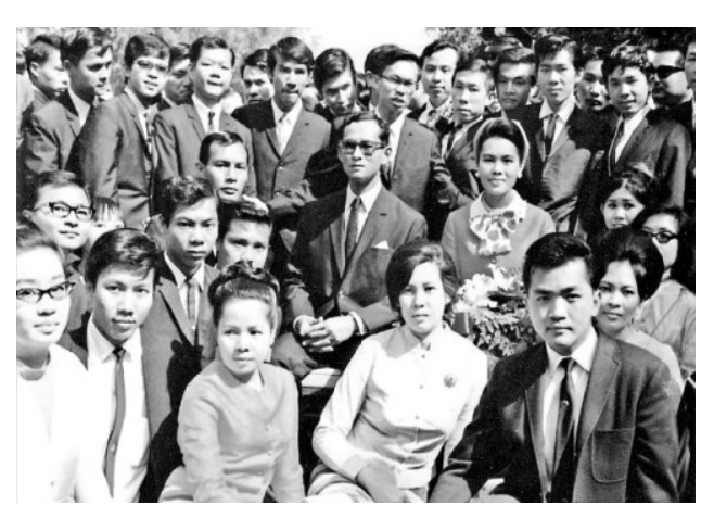
Members of the Thai Association of Southern California with the King and Queen of Thailand in Beverly Hills during a visit to Los Angeles, ca. 1960.