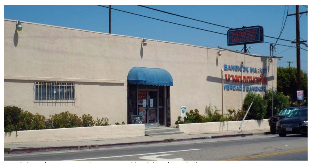
Bangkok Market at 4757 Melrose Avenue, 2017

Prior to 1980, the densest commercial development associated with Thais in Los Angeles could be found in East Hollywood along a two-mile stretch on Hollywood Boulevard.<sup>31</sup> In East Hollywood, Thai-owned businesses included Thai-language newspapers, travel agencies, auto repair shops, gas stations, souvenir shops, tailors, and beauty parlors.<sup>32</sup> In 1971, two important community touchstones opened in the neighborhood, the Royal Thai Consulate and Bangkok Market. Bangkok Market at 4800 Melrose Avenue (extant/altered) was opened by Pramote and Marasri Tilakamonkul, and was the first Thai and Southeast Asian food grocer in the U.S. In the early days, the market provided the local Thai population with Thai specialty items, and served as a "de facto community center and trading post."<sup>33</sup> This was before they began importing items and growing their own Thai vegetables, according to Tilakamonkuls' son, and restaurateur Jet Tila. In 1986, the Tilakamonkuls purchased a building across the street at 4757 Melrose Avenue and relocated their market to the larger building, where it remains.