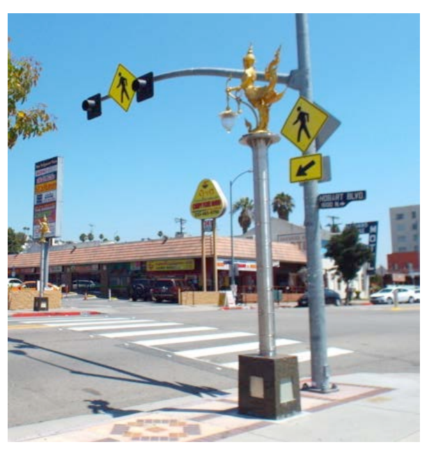
Kinarra lamp posts at Hollywood and Hobart in Los Angeles' Thai Town, 2017 (Photo by author).

In 2013, the City of Los Angeles was gifted Kinnara lampposts by the government of Thailand. The gift coincided with the signing of a friendship agreement between Los Angeles, United States and Bangkok, Thailand. This agreement, presided over by then-Councilman Tom LaBonge and former Mayor Antonio Villaraigosa, formalized the bond between the two cities named City of Angels, and recognized Los Angeles as home to the largest population of Thais outside of Thailand.<sup>74</sup>