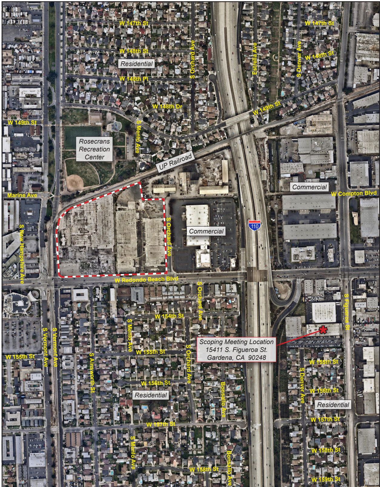
Figure 1 – Project Location Map