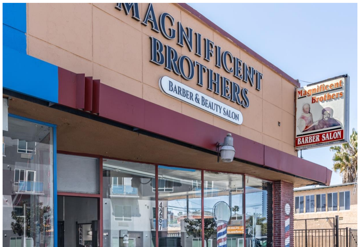
Magnificent Brothers Barber Shop, est. 1970, Crenshaw.

The project is led by the Getty Conservation Institute and the Office of Historic Resources (OHR) within Los Angeles' Department of City Planning, which is responsible for the management of historic resources within the city. A robust community engagement program will create a space for meaningful input and local partnerships, drawing upon community-based knowledge of lesser-known histories.