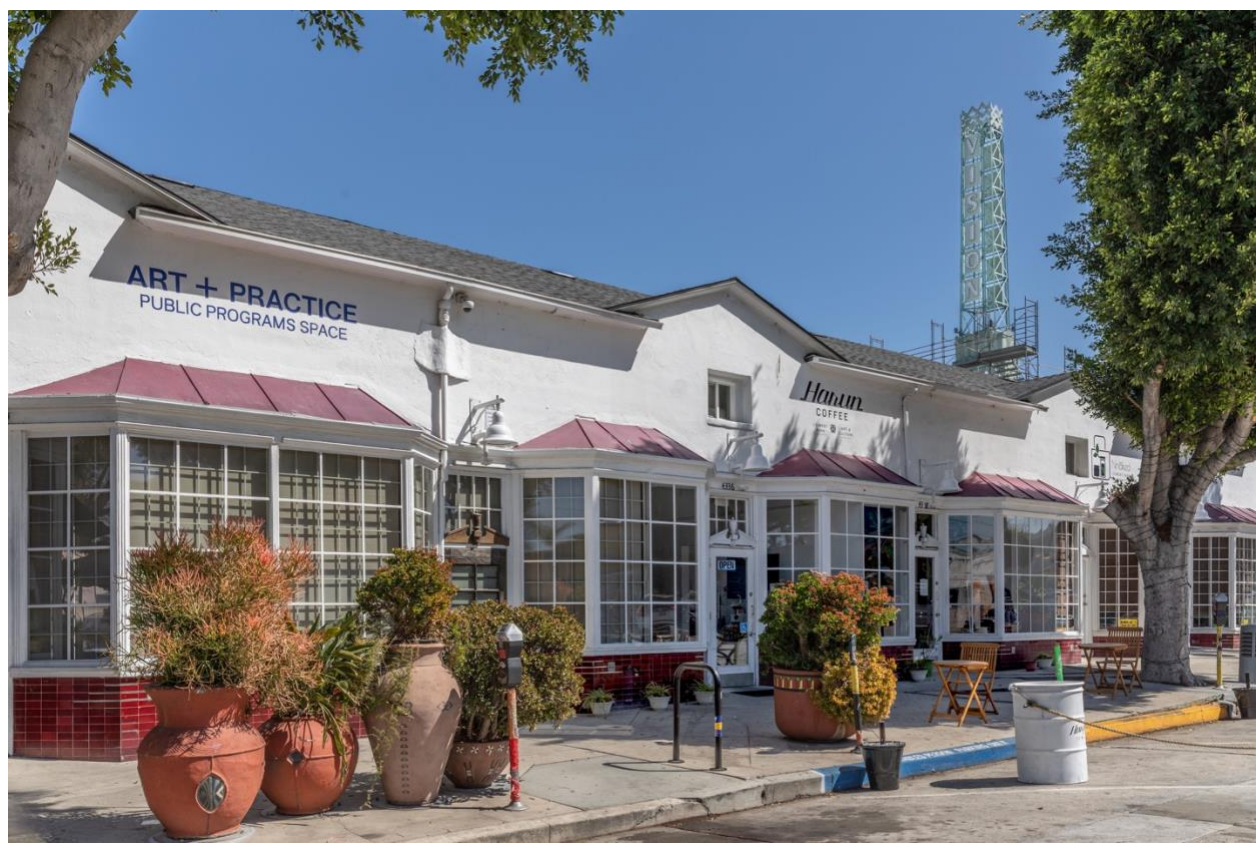
Brockman Gallery, 1967–90, Leimert Park. From 1967–90, this row of storefronts was occupied by the Brockman Gallery. The Black-owned gallery exhibited works of both emerging and established African American artists and helped forge a thriving Black art and business community in Leimert Park.

communities and residents to unearth stories that are vital to our understanding of the place we call home."