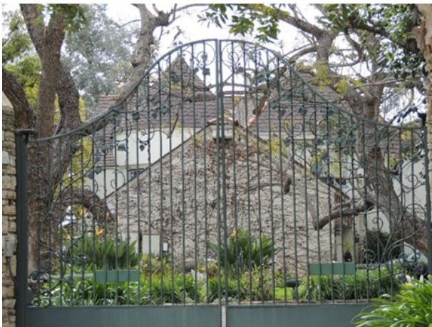
Shirley Temple House, Brentwood. Long-time home of child movie star and film actress Shirley Temple during the most productive period of her professional career. She resided here with her family from age 7 until she was married at age 17.