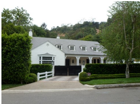
Judy Garland House, Bel-Air. Garland lived here with her mother from 1938 to 1943, an important period in her career when she rose to stardom in The Wizard of Oz .

The previous issue of this newsletter (October 2017) featured an overview article on development of the citywide historic context statement and highlighted those published to date. The context statement identifies important themes in the history of Los Angeles and relates those themes to properties identified as part of SurveyLA. The OHR continues to publish new themes as they are completed, posting the completed narratives here .