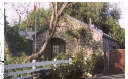
10107 Stonehurst Ave.