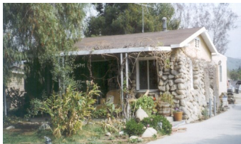
11254 Sheldon St.