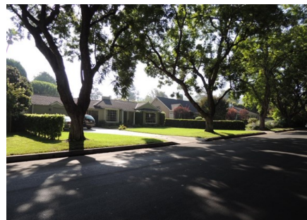
Stansbury Avenue Residential Historic District, Sherman Oaks. The Stansbury Avenue Residential Historic District in Sherman Oaks was developed between 1935 and 1951. By 1939 neighborhood residents were primarily motion picture stars, executives, and technicians as well as other professionals.

Office of Historic Resources Department of City Planning 200 N. Spring Street, Room 559 Los Angeles, CA 90012 (213) 978-1200 Fax: (213) 978-0017