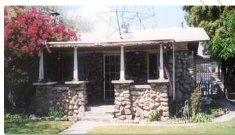
11103 Allegheny St.