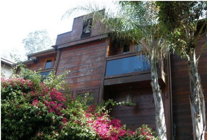
Jim Morrison residence, Hollywood. Lead singer of the 1960s rock group The Doors.