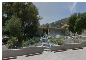
Theodore Payne Foundation 10459 Tuxford Street

The Foundation for Wild Flowers and Native Plants was established in 1960 to promote California landscapes and make local species available to the public. Sitting on 22 acres of land, the foundation includes a native plant nursery, seed room, book store, art gallery, demonstration gardens and hiking trails.