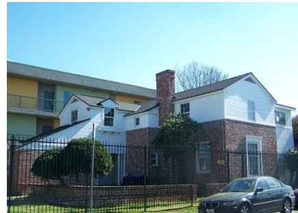
Bill "Bojangles" Robinson Residence, South Los Angeles. Robinson was a well-known and influential African American tap dancer and performer. The house was constructed for Robinson in 1938, who lived there until at least 1942.