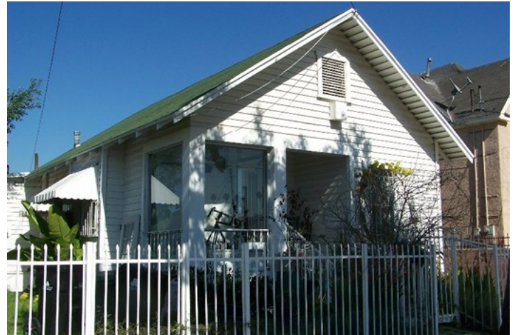
Eric Dolphy Residence, South Los Angeles. Dolphy was an important African American jazz musician. He lived in this house from 1942 until the late 1950s, when he moved to New York.

often designed and built for a significant person and/or were the long-term home of a significant person.