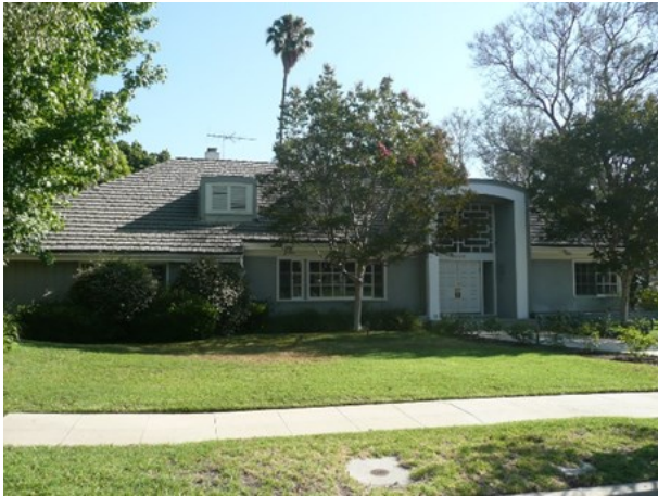
Liberace House, Encino. Long-time home of pianist, singer, and television entertainer Liberace. The house was designed and constructed for Liberace and included a piano-shaped swimming pool.