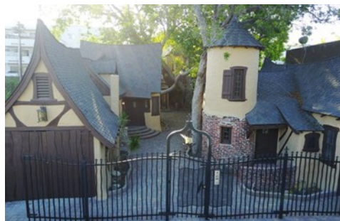
HCM #1153 Village Court, 1328-1330 1/2 N. Formosa Avenue

The Village Court property is a multi-family residential court consisting of four residences and three garages,