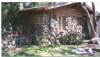
11202 Sheldon St.