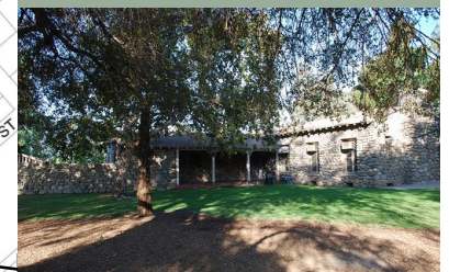
Stonehurst Recreation Center