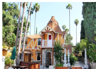
Villa Terraza 9955 Sunland Blvd

The Foundation for Wild Flowers and Native Plants was established in 1960 to promote California landscapes and make local species available to the public. Sitting on 22 acres of land, the foundation includes a native plant nursery, seed room, book store, art gallery, demonstration gardens and hiking trails.