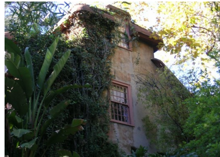
Humphrey Bogart residence, Hollywood. Home of the actor in the 1930s.