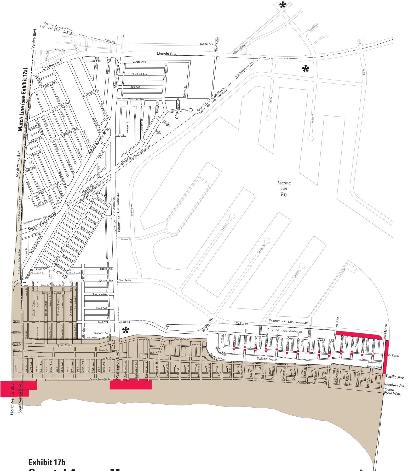
Exhibit 17b Coastal Access Map Parking and Beach Impact Zone