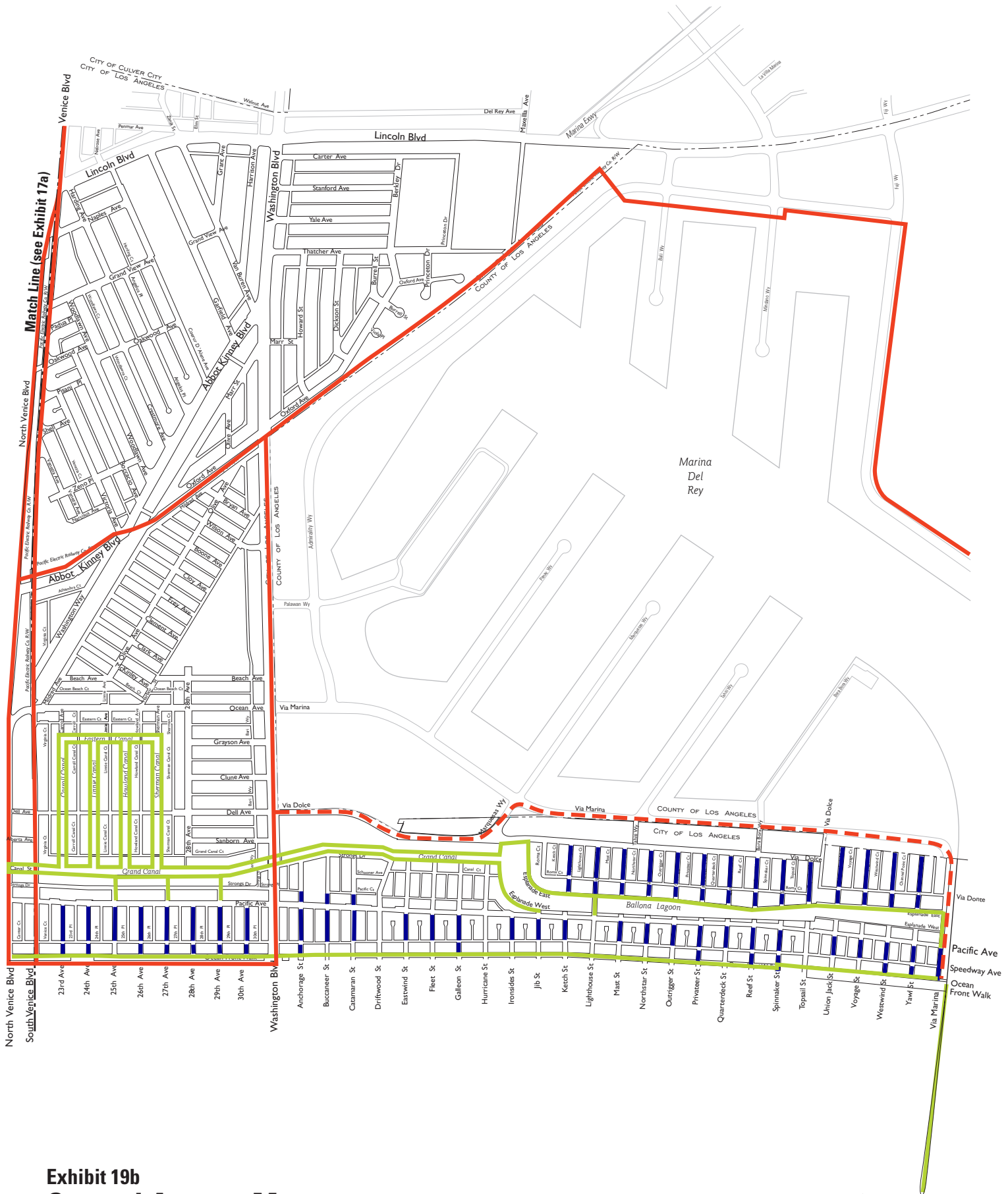
Exhibit 19b Coastal Access Map Pedestrian Access and Bikeways