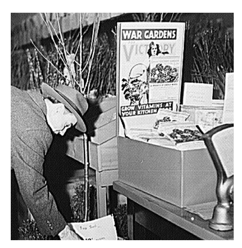
Citizen buys topsoil to improve a victory garden. May 1943.

As part of the campaign to find or produce enough rubber, Roosevelt in June 1942 said that Americans should collect "old tires, old rubber raincoats, old garden hoses, rubber shoes, bathing caps, gloves—whatever you have that is made of rubber."<sup>57</sup> Within a month, people had contributed 450,000 tons of scrap rubber in a multitude of forms. A variety of other scrap drives involved civilians in the war efforts and yielded mountains of materials. Boy Scouts went door-to-door, collecting paper for recycling to make up for the shortage of wood pulp caused by the demand for lumber, and the General Eisenhower Waste Paper Campaign of 1945 gave special awards to Scouts collecting 1,000 pounds of paper.