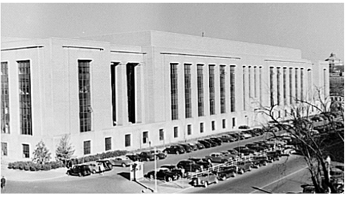
New Social Security Building in Washington, D.C. January 1942.

labor, but denied authority over the draft and military production decisions; and the Office of War Information, which worked closely with the entertainment industry and private advertising agencies to maintain morale and support for the war, both at home and abroad, but was criticized for using its powers for partisan propaganda purposes. Recommendation: This property should be evaluated for possible NHL designation.