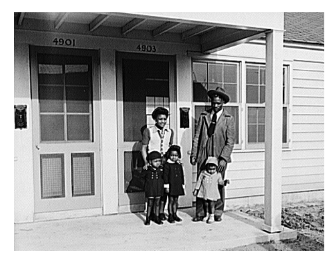
An African American family poses in front of the Sojourner Truth homes in Detroit, Michigan. February 1942.

The nearly 50,000 African Americans who migrated to Detroit, the nation's leading industrial city, met constant discrimination and frustration. They had difficulty in getting hired for the newly created war jobs, in getting promoted, and in finding decent housing. Most of the city's blacks were forced to crowd together in Paradise Valley, a black slum, where rents were high, housing substandard, and recreational facilities almost impossible to find. Recent Southern white migrants and local ethnic groups, particularly Polish Americans and Irish Americans, most of whom were themselves living in overcrowded, overpriced apartments, resented the black newcomers, who, they believed, were causing the rapid deterioration of "their" city and did not deserve priority in federal housing projects. Throwing bricks, burning crosses, overturning moving vans, Polish Americans protested violently when a federally-financed housing project being built in "their" neighborhood was designated for African American defense workers in early 1942. Only the presence of hundreds of state troops with fixed bayonets allowed black tenants to move into the spaces assigned to them in the Sojourner Truth Housing Project—named for the former slave and famous abolitionist.<sup>34</sup>