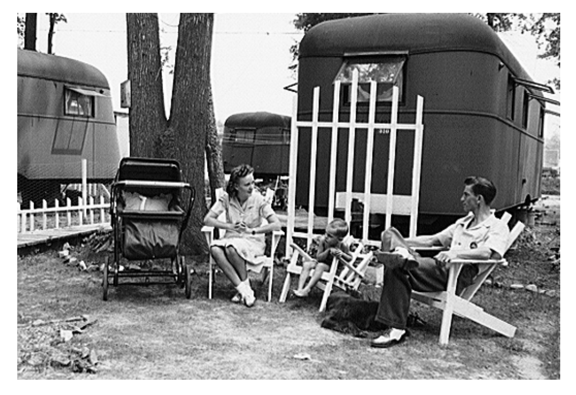
A worker's family is shown behind their trailer in a Farm Security Administration housing project for Glenn L. Martin aircraft workers, Middle River, Maryland. Possible date, August 1943.