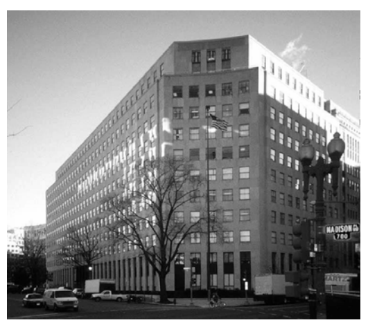
Lafayette Building.

This building, completed in 1940, was the headquarters of the Reconstruction Finance Corporation (RFC), which played an important role in the industrial expansion of World War II. Established as a Depression-relief agency in 1932 and given greatly expanded power, flexibility, and resources in 1940, the RFC, usually working through one of its defense-related subsidiaries, financed over one-third of the $25 billion invested in new industrial plants during the war. The building is also associated with Jesse Jones, who maintained his control over the powerful RFC even after being promoted to other posts in the administration. A "rugged product of Texas capitalism," Jones's close association with the