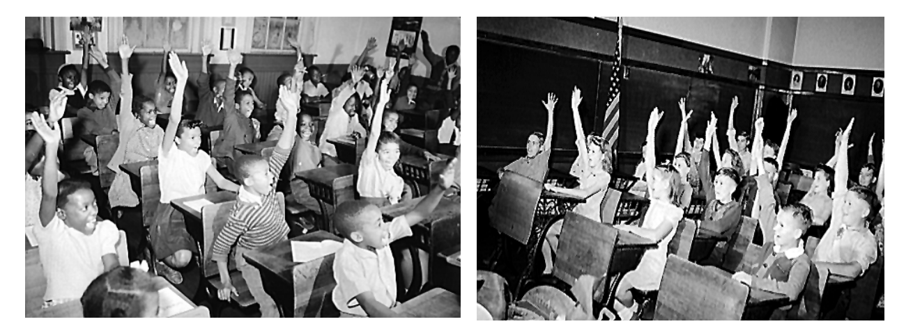
Office of War Information photographs taken inside a white school and a black school illustrate children volunteering to collect scrap for the war effort. Both photographs bear the identical caption: "... Everyone in this Roanoke, Virginia class wants to be one of the thirty-million children banding together throughout the United States to form America's junior army..." October 1942.

America's children and youth made important contributions to the war effort. They saved their nickels and dimes to buy War Bonds, and they pulled wagons from house-to-house collecting old newspapers, rubber tires, and tin cans. "I became fiercely patriotic," recalled a Nebraska farm girl, "and participated in every war effort that I could." Thousands of young people went to work. In 1940, for example, 900,000 Americans between the ages of fourteen and eighteen were employed. By the spring of 1944 their number had climbed to 3 million—one-third of their age group. Teenagers were dropping out of high school in record numbers, and some observers believed that the most pressing social problem afflicting young people was not juvenile delinquency but failure to finish school. High-school enrollments hit new lows during the war, which prompted a back-to-school drive in 1944.<sup>73</sup>