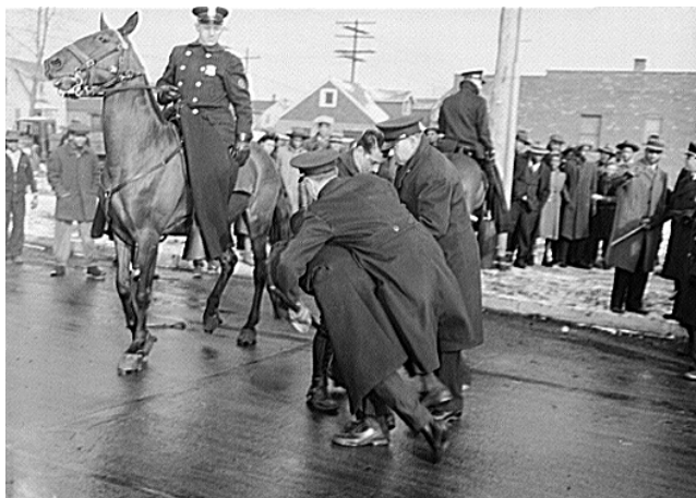
Police arrest an African American during the riot at the Sojourner Truth homes caused by white neighbors' attempts to prevent black tenants from moving in. February 1942.

The racial beatings, shootings, burning, and looting in Detroit in June 1943 symbolized the rawness of American race relations. Just a spark was necessary to ignite hostilities, and not surprisingly, that spark flared on a hot, sweltering Sunday in June, when whites started to stone a black boy who had mistakenly drifted into the white swimming area in Belle Isle Park, an island in the Detroit River. Quickly rumors of murderous attacks by each race on the other spread throughout the city; thousands of Detroiters poured into the streets bent on vengeance. Bands of whites attacked innocent black passengers on streetcars and buses, while African Americans