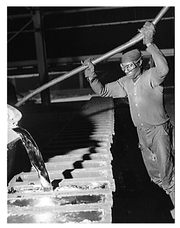
A workman pours aluminum into molds at the Reynolds Metal Company in Sheffield, Alabama. Possibly dates to August 1942.

But if wartime conditions made African American advancement possible, forceful and well-organized protests of black workers were necessary to persuade unions and the federal government to root out discrimination in jobs, housing, and politics. The first, and in many ways the most dramatic, protest movement began in 1940, when A. Philip Randolph and other leaders of the Brotherhood of Sleeping Car Porters decided that only a show of strength would win African Americans access to good jobs