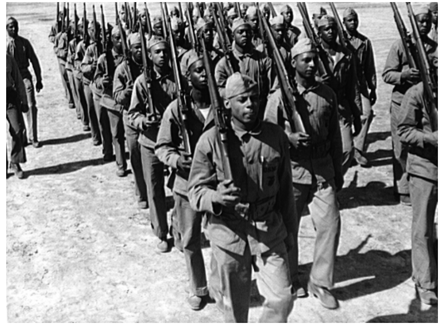
The U.S. Marine Corps trained its African American volunteers at Montford Point, North Carolina. March 1943. Library of Congress, Prints & Photographs Division, FSA/OWI Collection [LC-USW3-023008-D].

Ultimately about one million African Americans served in the World War II military. Blacks were eventually accepted into the Marine Corps and Army Air Corps. As the war proceeded, African Americans received a wider range of duties, including combat, and some served in integrated units by 1944 and 1945. Sometimes serious racial tensions and disturbances occurred on or near military training bases, many of them located in the segregated South. The wartime experience, including African American protest against discriminatory treatment, began the process that would end with the desegregation of the armed forces in 1948.<sup>33</sup>