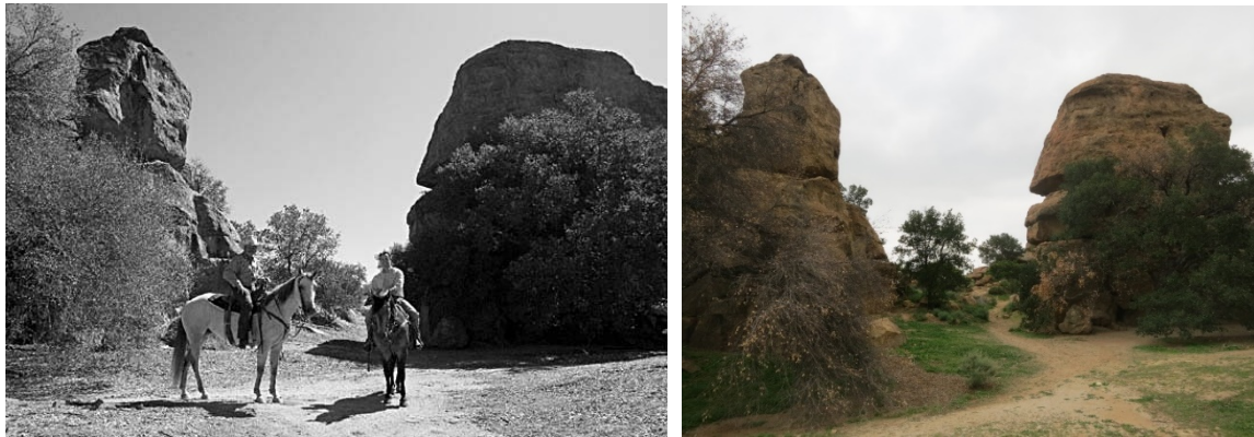
Left: Still frame of an unidentified Western filmed the Garden of the Gods, Lower Iverson Ranch, circa 1950; Right: Garden of the Gods Historic District, Lower Iverson Ranch, Chatsworth

television shows. Once dubbed “the most shot-up movie location ranch in motion picture history,” 66 historian Jerry England estimates that as many as 2,000 motion pictures and television shows have utilized the Ranch for some or all of their outdoor scenes over the course of the 20 th century, making it “one of the most recognizable sites to movie viewers of all generations.” 67