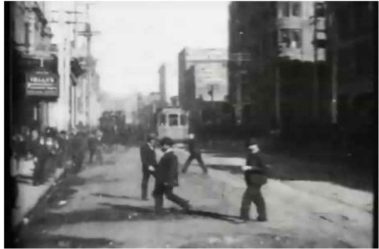
A still from South Spring Street, Los Angeles, Cal. (1897) , believed to be the first film shot on location in Los Angeles.

The practice of location filming first commenced in California, and in Los Angeles in particular, when Edison filmmakers James White and Frederick Blechynden toured the state on a railroad company-sponsored excursion in 1897. At least three of the actuality films they created on that expedition were recorded in Southern California: California Orange Groves, Panoramic View ; Through the Tunnel , which was filmed near Santa Monica; and South Spring Street, Los Angeles . Just over thirty seconds long, South Spring Street represents the first moving picture to be filmed in Los Angeles. 29