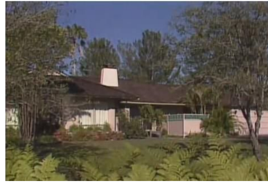
Left: The Brady Bunch residence at 11222 West Dilling Street as it appeared onscreen; Right: The Golden Girls residence at 245 North Saltair Road as it appeared onscreen