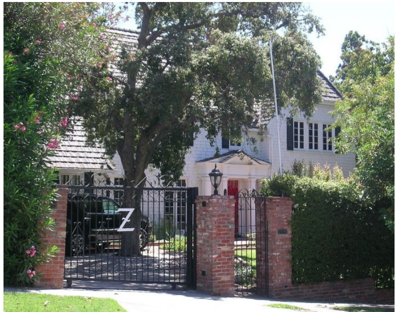
Ozzie and Harriet Nelson Residence at 1822 North Camino Palmero

Although the location-based establishing shot was utilized across all genres, some of the most memorable to television audiences were those which included a particular residence that was associated with the show’s characters – a trend that continues to the present day. One of the earliest examples is the home of Ozzie and Harriet Nelson, who starred along with their sons in The Adventures of Ozzie and Harriet (1952-1966). The Nelsons resided at 1822 North Camino Palmero in the Las Colinas Heights neighborhood of Hollywood, in a home the couple had purchased in 1941. The Adventures of Ozzie and Harriet was originally developed as a radio show, and the Nelsons brought the sitcom to television in 1952. By that point, their own home was so suited to the Nelsons’ personae as the quintessential, all-American family that their actual residence was used for the establishing shot during the opening credits of the show, and the interiors – which were filmed on a sound stage – were recreated from the family’s real-life rooms. The show still holds the record today as television’s longest-running live-action sitcom, 81 and the Nelsons continued to reside there even after the show ended; Ozzie Nelson died in 1975, and Harriet Nelson eventually sold the home several years later.