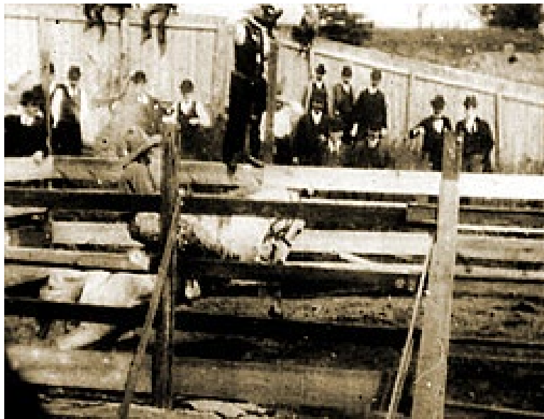
A frame from Bucking Broncho (1894), believed to be the first motion picture filmed outdoors. (Image has been tinted for clarity.)

In 1894, Edison moved outside, and produced what is believed to be the first motion picture to be filmed outdoors – Bucking Broncho , recorded in a specially-constructed corral adjacent to Edison’s studio. Logistics made traveling much further difficult as Edison’s existing camera equipment was heavy and cumbersome, making it virtually impossible to transport.