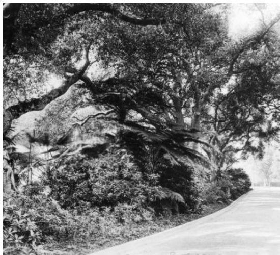
Road in Griffith Park, Los Angeles Historic-Cultural Monument No. 942.

Westerns, however, were not the only genre which could be improved by filming on location. Southern California's varied topography allowed for a wide variety of films to be made. As a 1911 article in Moving Picture World described it, "Within a twenty-mile radius of Los Angeles may be found conditions suitable for exteriors from a tropic to a frigid background, and from desert to jungle." 45 One of the most popular