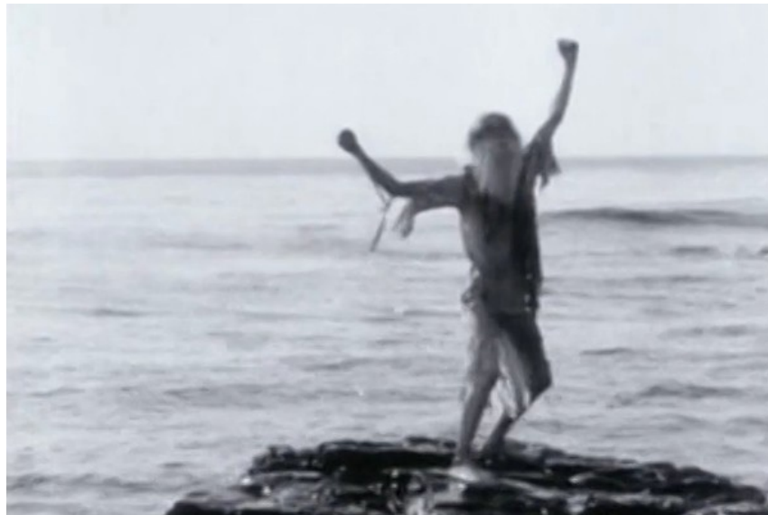
Dantes (here, played by a local amateur stunt double) emerges from the ocean in the climactic scene of William Selig's The Count of Monte Cristo (1908). The picture, was the first narrative film to be recorded in Southern California.

Boggs and cameraman Thomas Persons traveled to Los Angeles to film the sequence in the last months of 1907. After an eventful shoot where the amateur stuntman hired by Boggs nearly drowned, The Count of Monte Cristo was released on January 30, 1908. While the film received favorable reviews, the insertion of the location shots, which marked a turning point in the development of cinematic language and production, went unmentioned. 33