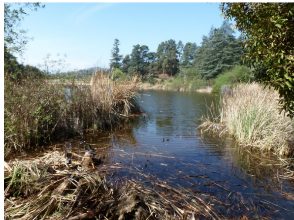
Left: Still frame of Upper Franklin Canyon in It Happened One Night , 1934; Right: Reservoir in Upper Franklin Canyon Park Historic District, filming location for film and television since the 1930s

While the surrounding landscape had offered a variety of natural location options, those filmmakers desiring a more metropolitan setting had been largely limited to Downtown Los Angeles. Now, newly-built communities and commercial centers of the 1920s and 30s became focal points for filming activity. With the establishment of Westwood Village and the University of California Los Angeles campus, locations in the western portion of the city became increasingly popular. By the 1940s studio location departments noted the Westwood area as one of the more popular location sites in Los Angeles. 63