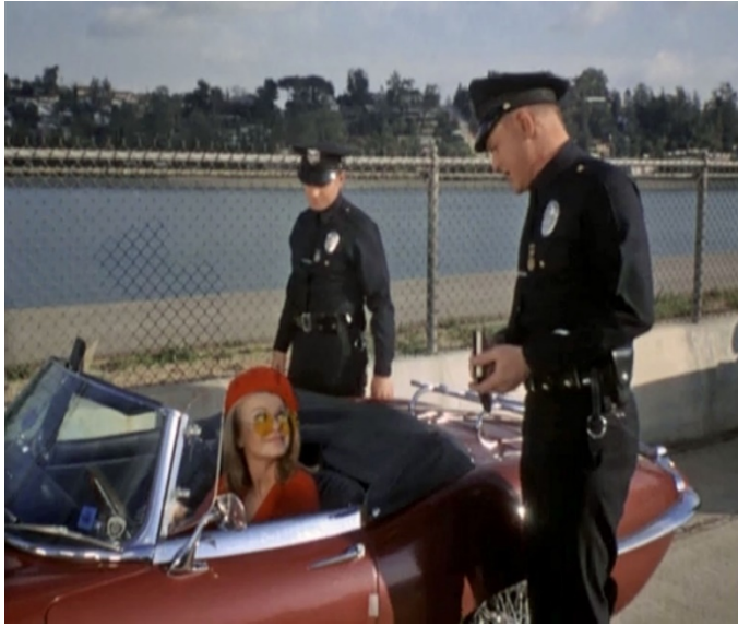
Officers stop a speeder at the Silver Lake Reservoir in the first season of Adam-12 (episode 24, "Boy, the Things You Do for the Job," 1969).

Although earlier films had been set in Los Angeles, it was more likely that location filming had been utilized to substitute for some far-flung locale evoked by the Southern California landscape. This time, the city simply played itself, lending an air of gritty realism and authenticity to programming which reflected the turbulent political and cultural climate of the period. Among the action/adventure shows which defined the character of location filming of the era were Dragnet (1951-1959, 1967-1970), Adam-12 (1968-1975), Columbo (1968, 1971-2003), Emergency! (1972-1979), The Rockford Files (1974-1980), Quincy M.E. (1976-1983), and CHiPs (1977-1983).