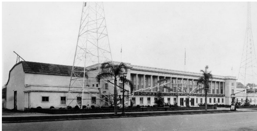
The Executive Office Building, at the Old Warner Brothers Studio, circa 1927, 5800-5858 Sunset Boulevard, Los Angeles Historic-Cultural Monument No. 180

The practice of filmmaking was forever transformed with the release of The Jazz Singer , filmed on the Warner Brothers lot in 1927. The film represented the first feature-length film to be recorded with synchronized dialogue. The advent of sound triggered a shift in location filming practices as well. Silent films had relied heavily on visual presentation to communicate the narrative. The early styles, such as slapstick, which had most effectively incorporated location filming, began to fall out of favor. However, location filming continued to flourish in other ways. Most studio properties were expanded to include extensive backlots, where many location scenes were filmed. 60 At the time, space on studio lots was