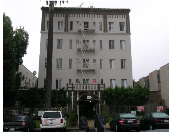
Left: Still frame of 6301 W Quebec Dr. in Double Indemnity, 1944 ; Right: 1825 N Kingsley Dr.