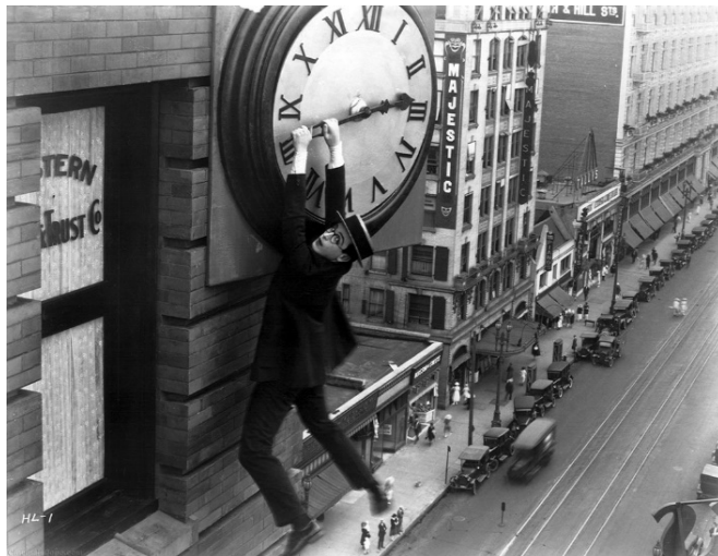
Harold Lloyd in Safety Last! (1923), filmed at the Western Costume Company building.

Although studio attitudes towards location filming may have begun to shift, it remained the preferred practice for some of the industry’s most popular and influential comedic filmmakers. Buster Keaton, Harold Lloyd, and Charlie Chaplin all incorporated location filming into their films and considered the practice to be a vital part of motion picture production. 58 The three men all rose to prominence during the silent film era for their distinctive character-driven comedies, which relied heavily on physical comedy, elaborate slapstick stunt sequences, and extensive chase scenes filmed in now-iconic locations around Los Angeles. One of the most famous examples of the period is Harold Lloyd’s Safety Last! (1923). While Lloyd filmed extensively in the Hill Street tunnels (not extant) in many of his earlier films, he rose