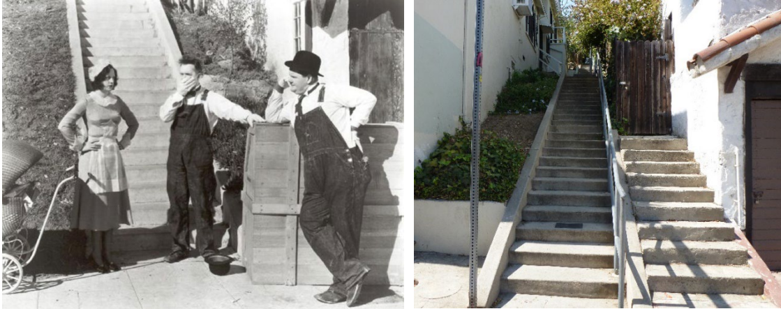
Left: Still frame of the Vendome-Descanso Public Stairway in The Music Box , 1932 (National Film Registry, Library of Congress); Right: The Vendome-Descanso Public Stairway, Silver Lake (SurveyLA)

specific sites influencing the plot and structure of the film. One of the most enduring examples of slapstick comedy is also one of the most iconic examples of location filming: The Music Box (1932), starring the comedic duo Laurel and Hardy. The short film includes a climactic scene depicting the two comedians attempting to carry a piano up a steep flight of stairs located immediately to the south of 939 North Vendome Street in the Silver Lake neighborhood.