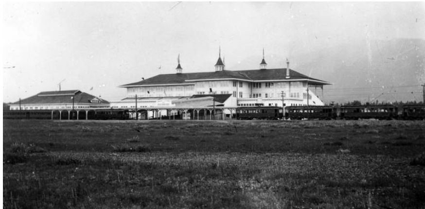
Santa Anita Racetrack in as it appeared in 1909 when William Selig filmed The Heart of a Race Tout.

observes, “the inclusion of scenes staged at a genuine racetrack enhanced the film’s authenticity, subtly suggesting to the spectator a real slice of life. This was an aesthetic that William Selig imparted to each of his directors and that would become a foundational component of virtually all subsequent commercial filmmaking.” 36