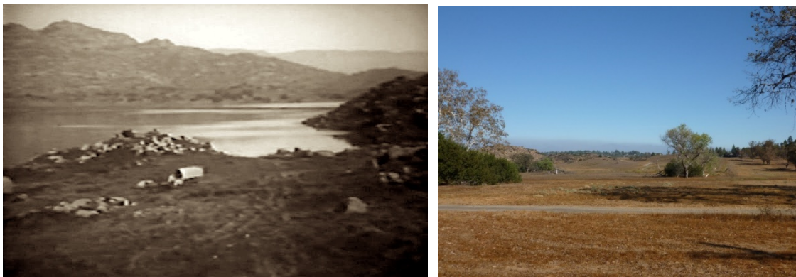
Left: Still frame from William S. Hart’s Three Word Brand (1921) with Chatsworth Reservoir in the background ; Right: Chatsworth Reservoir Historic District

Another popular filming location in the same area was the Chatsworth Reservoir. Although not technically a purpose-built movie ranch, the reservoir – which was originally known as Chatsworth Lake – became the site of frequent filming activity as early as the 1920s. Early films made at Chatsworth Reservoir included William S. Hart’s Three Word Brand (1921), Mary Pickford’s Tess of the Storm Country (1922), and Howard Hughes’ Hell’s Angels (1930).