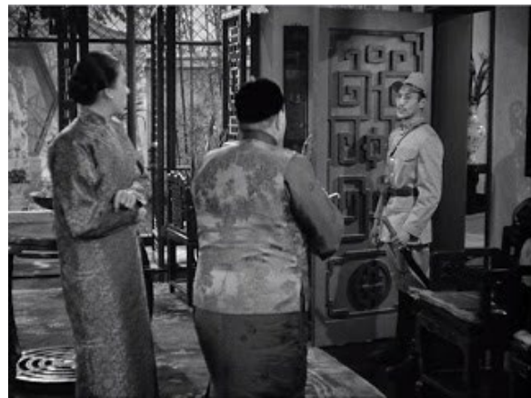
Left: Still frame of Shanghai Gesture, 1941; Right: Still frame of Dragon Seed, 1944

Location filming continued apace throughout the 1930s and 1940s, with filming activity taking place across the city. Studio location departments created and used maps of the Southern California region to quickly identify areas that could double for sites around the world. It was the United States' entrance into World War II and the resultant restrictions on production activity that would eventually alter the course of location filming activity in Los Angeles.