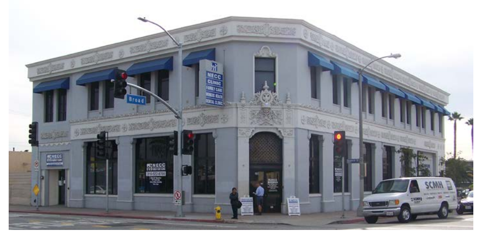
Citizens National Bank / Wilmington Post Office, 1934 200 E Anaheim Street (SurveyLA)

Context: Architecture and Engineering/Beaux Arts Classicism, Neoclassicism, and Italian Renaissance Revival Architecture, 1895-1940