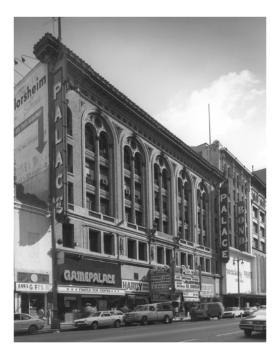
Palace Theater, 634 S. Broadway, 1911

During Los Angeles' 1920s construction boom, the style became one of the most popular for midrise commercial and office building. Architects drew upon the historic forms of the Italian Renaissance to lend their designs monumentality and an aura of refinement. Most of the surviving examples of commercial and institutional buildings in the Italian Renaissance Revival style therefore date from the 1920s and are located Downtown. Examples include the Commercial Exchange Building (416-436 W. 8th Street, Los Angeles Historic-Cultural Monument No. 1145 by Walker & Eisen completed in 1922, the Giannini Building (aka the Bank of Italy Building, 649 S. Olive Street, Los Angeles Historic-Cultural Monument No. 354) by Morgan, Walls & Clements also completed in 1922, and the Petroleum Building (714 W. Olympic Blvd., Los Angeles Historic-Cultural Monument No. 596) by Meyer & Holler completed in 1925. <sup>89</sup> The architectural firm Curlett & Beelman designed a number of significant Italian Renaissance Revival buildings Downtown, including the Roosevelt Building (715-735 W. 7th Street, Los Angeles Historic-Cultural Monument No. 355) built in 1923, Barker Brothers Building (800-898 W. 7th Street, Los Angeles Historic-Cultural Monument No. 356) built in 1925, and the Mayfair Hotel (1256 W. 7<sup>th</sup> Street) built in 1926.<sup>90</sup>