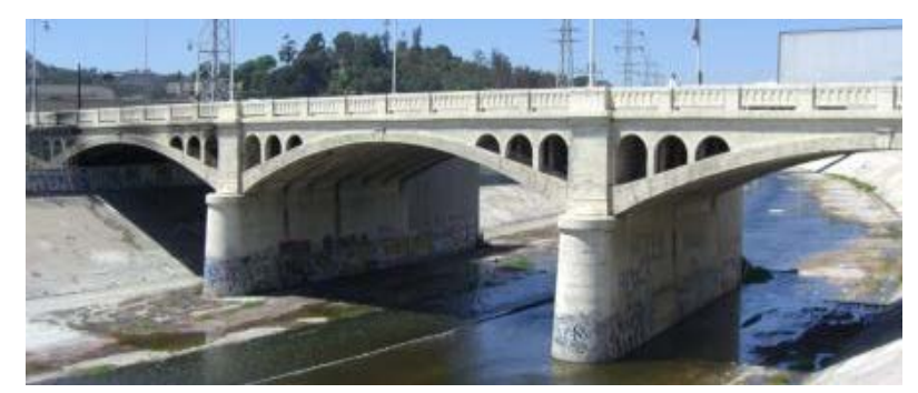
North Main Street Bridge Los Angeles Historic-Cultural Monument No. 901, 1910

Many of the Beaux Arts-style buildings constructed in Los Angeles, particularly Downtown, are designated as City Historic-Cultural Monuments and/or listed in the National Register. In addition, a number of Beaux Arts-style bridges spanning the Los Angeles River east of Downtown were built as part of a monumental bridge building program that incorporated the principles of the City Beautiful movement. These bridges are also designated Los Angeles Historic-Cultural Monuments and have been determined eligible for listing in the National Register.<sup>62</sup>