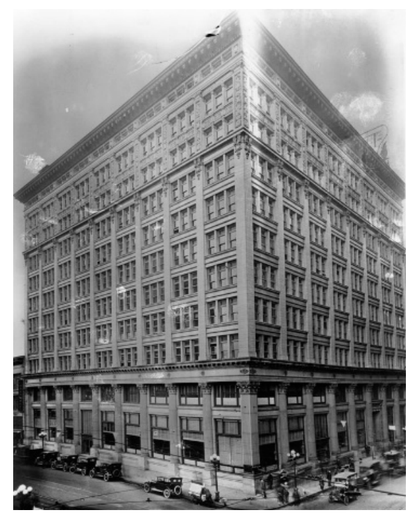
Van Nuys Building, 1926

Hotel (103-107 W. 4<sup>th</sup> Street, Los Angeles Historic-Cultural Monument No. 288).<sup>57</sup> Designed by the architectural firm Morgan & Walls, the Barclay Hotel was one of the finest hotels in Los Angeles when it opened in 1897. The building features a tripartite design scheme with Corinthian pilasters that rise from the second to the sixth floor and is capped with a modest cornice. Unlike typical Beaux Arts-style buildings, the Barclay Hotel is clad in cream-colored pressed brick rather than terra cotta.