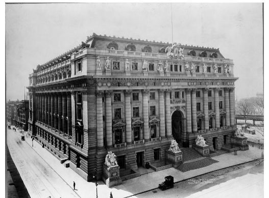
Alexander Hamilton U.S. Custom House, 1908

Supervising Architect's office, with some designed by private architectural firms.<sup>28</sup> The Tarsney Act, passed in 1893, authorized the Treasury Department to contract private sector architectural services through a competitive bidding process. For funding, Taylor was able to utilize the first federal omnibus public buildings law passed in 1902, which saved authorization time in Congress and allowed construction of vastly more federal buildings. Federal buildings constructed during this period became models for other public buildings at the local, county, and state levels.<sup>29</sup>