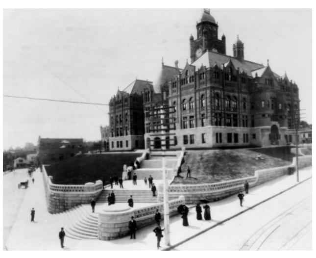
Second County Courthouse, circa 1892, Demolished

roofs. In the west, examples of the style were often near replicas of monumental civic buildings from eastern cities. 42 The most important examples of the Richardsonian Romanesque style constructed in Los Angeles (both demolished) were Los Angeles' first City Hall constructed in 1888 and the second County Courthouse constructed in 1891 (a copy of the Allegheny Courthouse in Pittsburgh).<sup>43</sup> The style quickly fell of fashion and out few Richardsonian Romanesque buildings were constructed in Los Angeles after the 1900s. There are no surviving examples of Richardsonian Romanesque commercial, institutional, or industrial buildings or structures in Los Angeles.44