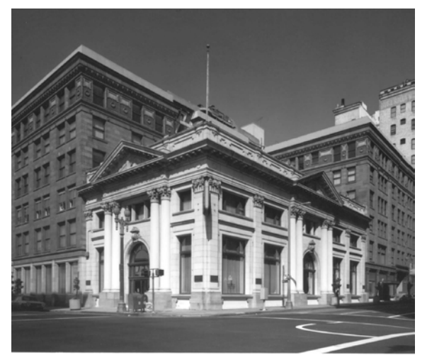
Farmers and Merchants Bank Building, 401 S. Main St., n.d.

Neoclassicism was also favored by financial institutions during this period, and bank buildings in this style are located throughout Los Angeles. Early examples of this property type Downtown, and later examples of banks in areas outside the central business district, generally resemble a small classical temple and are often sited on a corner lot. One of the finest surviving examples is the Farmers & Merchants Bank building (401 S. Main Street, Los Angeles Historic-Cultural Monument No. 271) constructed in 1905.<sup>73</sup> Designed by Morgan & Walls, it features two entrances framed by paired Corinthian columns supporting pediments with raking cornices. The building is topped with a tall parapet that surrounds a barrel-vaulted skylight. Later examples of