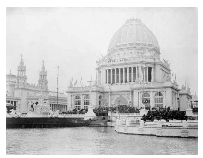
World's Columbian Exposition, Administration Building, 1893

Beaux Arts Classicism was the dominant type of high style architecture during the late 19<sup>th</sup> and early 20<sup>th</sup> centuries.<sup>52</sup> The style was inspired by the architectural principles taught at the École des Beaux-Arts from where it derives its name. After Richard Morris Hunt became the first American to attend the École in 1846, the American architectural profession would subsequently be dominated by men who attended the École or were trained in studios or schools established by those who had.