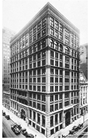
Home Insurance Company, 1885

size. In additional to its vertical organization, commercial buildings of this period were also horizontally organized into a tripartite design: base, shaft, and capital.