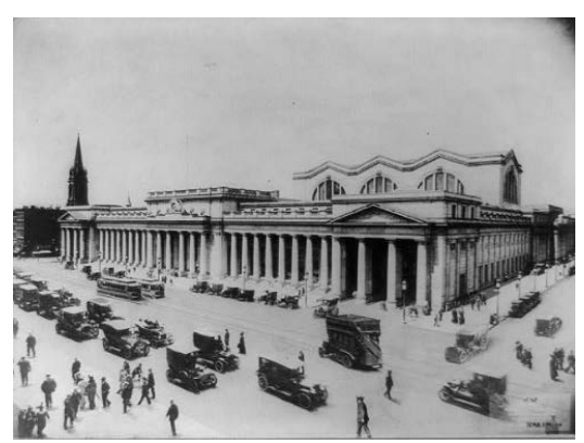
Penn Station, 1920

Context: Architecture and Engineering/Beaux Arts Classicism, Neoclassicism, and Italian Renaissance Revival Architecture, 1895-1940