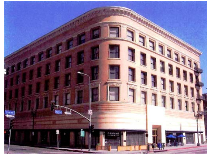
Douglas Building, 257 S. Spring Street, n.d.

most famous for the National Archives Building completed in 1935, Jefferson Memorial completed in 1943, and National Gallery of Art completed in 1941, all in Washington, D.C.