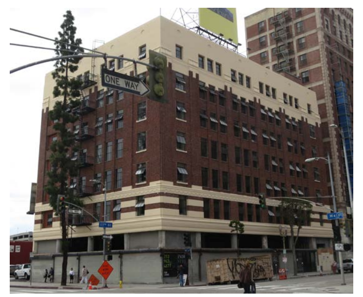
Harris Building, 1923 110 W 11th Street

Examples of industrial buildings in this style include the Harris Building (110 W 11th Street) by Henry Harwood Hewitt constructed in 1923 for the Union Manufacturing Company, a local garment manufacturer.