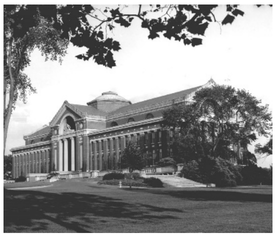
Roosevelt Hall, Washington D.C., 1972 National Register of Historic Places Nomination

style building. Cary designed the building in the Greek Doric order.<sup>67</sup> Its south portico is a scaled-down version of the east façade of the Parthenon. The monumental scale of both the Neoclassical Palace of Fine Arts and the New York State Building ended up capturing the imaginations of architects and fair-goers alike.