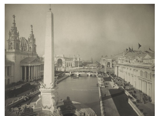
World's Columbian Exposition, 1893

Context: Architecture and Engineering/Beaux Arts Classicism, Neoclassicism, and Italian Renaissance Revival Architecture, 1895-1940