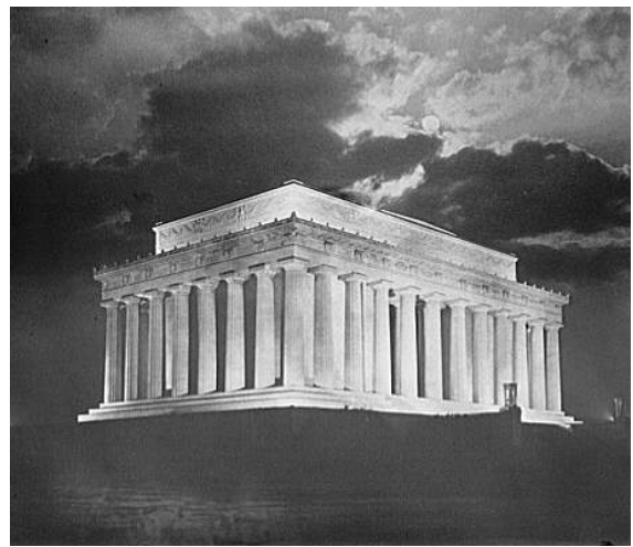
Lincoln Memorial, date unknown

Context: Architecture and Engineering/Beaux Arts Classicism, Neoclassicism, and Italian Renaissance Revival Architecture, 1895-1940