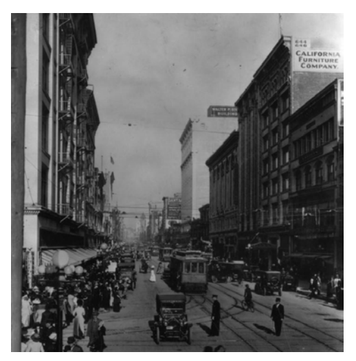
Broadway at 7<sup>th</sup> Street, circa 1910

<sup>42</sup> Whiffen, American Architecture Since 1780, 140.