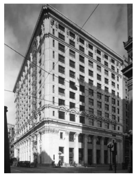
Pacific Southwest Trust & Savings Bank, National Register, Spring Street Financial District, 215 W 6<sup>th</sup> Street, 1920

Context: Architecture and Engineering/Beaux Arts Classicism, Neoclassicism, and Italian Renaissance Revival Architecture, 1895-1940