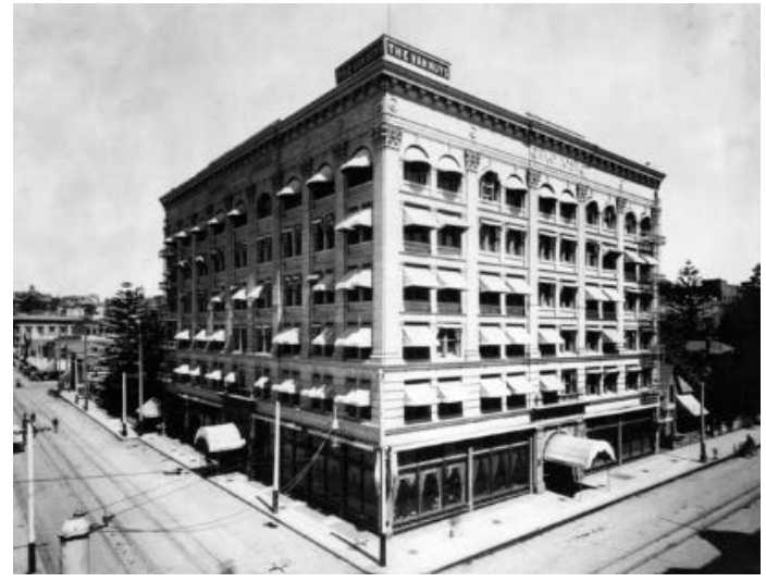
Barclay Hotel, 1897

The completion of a transcontinental rail connection to Los Angeles in 1876 ushered in a period of unprecedented growth. Investors poured their resources into local real estate, triggering a boom in building construction. Following nationwide trends in architecture in the late 19<sup>th</sup> and early 20<sup>th</sup> century, Los Angeles embraced Beaux Arts Classicism to display the city's sophistication. Because Beaux Arts tripartite form was easily stretched to several stories, the style was repeatedly applied to mid- and high-rise buildings. An early example of a Beaux Artsstyle mid-rise in Los Angeles is the Barclay