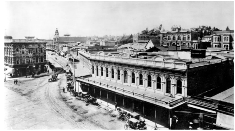
Junction of Main, Spring, and Temple Streets, circa 1887

During this period of growth in the final quarter of the 19<sup>th</sup> century, much of the city's development was concentrated in and around Downtown Los Angeles. By this time, the area surrounding the intersection of Main, Spring, and Temple Streets grew into a thriving commercial district with older low-rise adobe structures and newer Italianate-style commercial buildings. <sup>34</sup> As the population grew, doubling between 1880 and