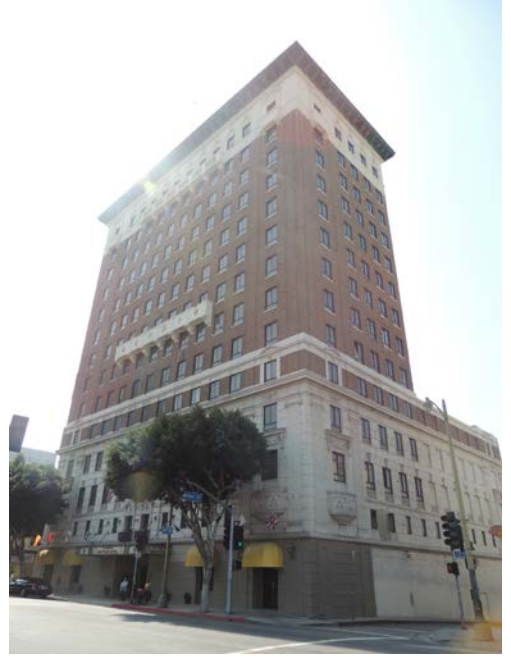
Mayfair Hotel, 1256 W. 7th Street, 2010