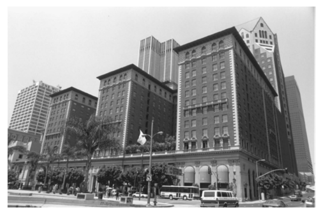
Biltmore Hotel, 515 S. Olive Street, n.d.

Context: Architecture and Engineering/Beaux Arts Classicism, Neoclassicism, and Italian Renaissance Revival Architecture, 1895-1940