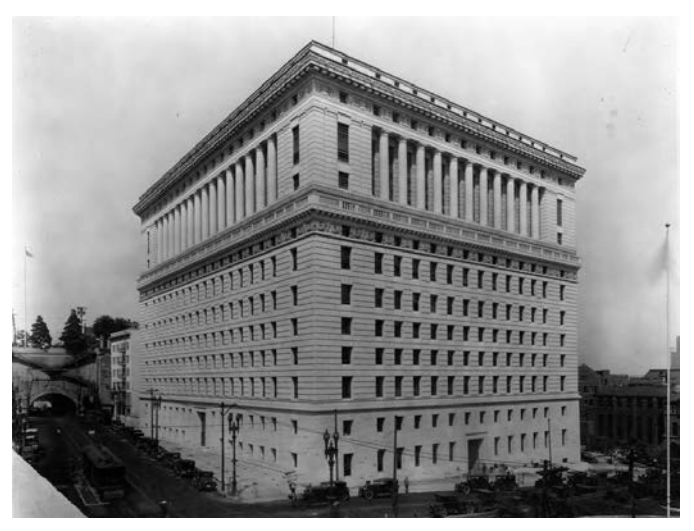
Hall of Justice, 211 W. Temple Street, circa 1925

Unlike in other American cities at this time that boasted grand Beaux Arts-style libraries, railway stations, and museums, the style was more rarely applied to institutional buildings in Los Angeles. In the early 20<sup>th</sup> century, the Los Angeles Municipal Art Commission hired Charles Mulford Robinson to make recommendations for the Los Angeles Civic Center.<sup>59</sup> Robinson's plan reflected the tenets of the City Beautiful movement, which arose out of the École des Beaux-Arts and the 1893 World's Columbian Exposition. The scheme that was eventually adopted for the Civic Center in 1927 combined two Beaux Arts axial plans designed by Cook & Hall and the Allied Architects of Los Angeles.<sup>60</sup> However, the City plans were never realized. The Beaux Arts-style Hall of Justice (211 W. Temple Street) completed in 1925 and designed by the Allied Architects Association is the only building in the Civic Center that hints at what it could have been.<sup>61</sup>