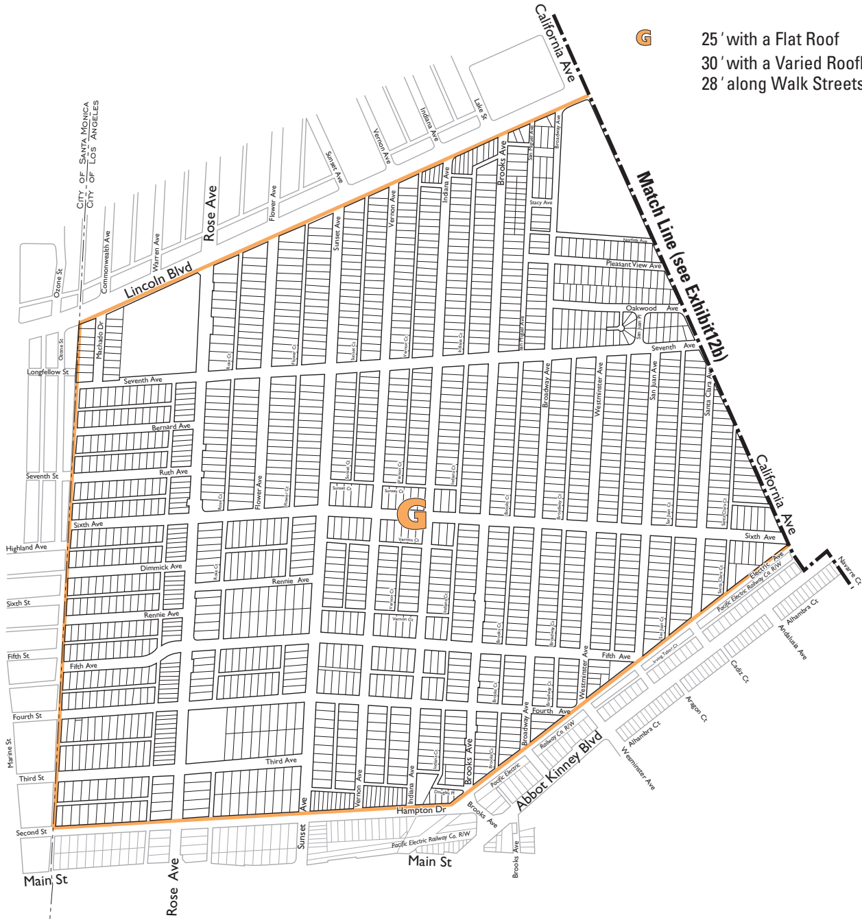
Exhibit 12a Height Subarea: Oakwood • Milwood • Southeast Venice