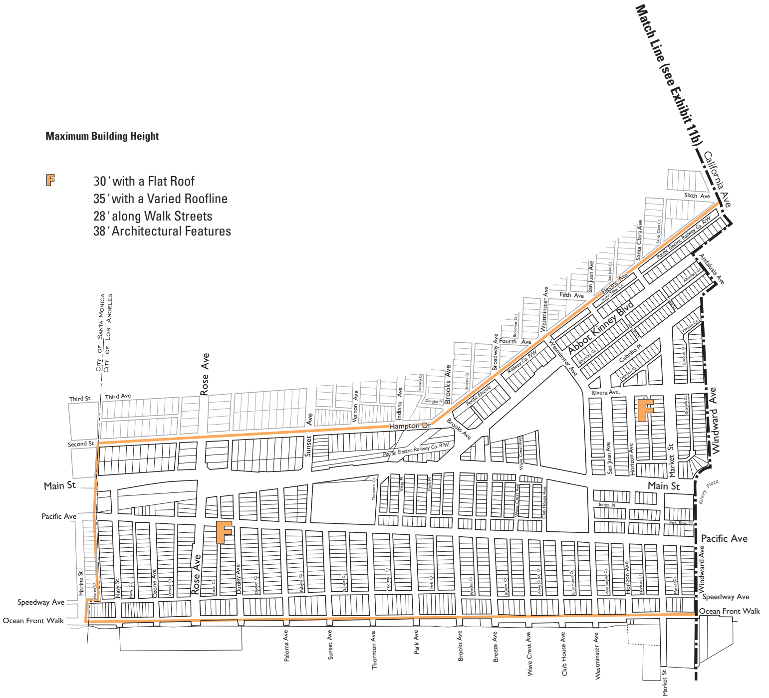
Exhibit 11a Height Subarea: North Venice • Venice Canals