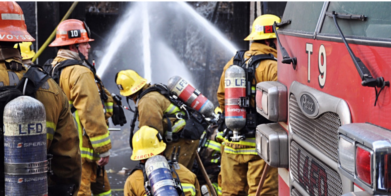
Los Angeles Fire Department responding to a structure fire.

The Los Angeles City Fire Department was established on February 1, 1886. Thirty firefighters, most of them former volunteers, were hired to man four leased firehouses. In addition, volunteer units were retained in the less populated areas outside the central city, including the San Fernando Valley. From the beginning the Department was an innovative, progressive agency which sought to secure the latest equipment, utilize the latest techniques and to develop better methods for fire fighting and prevention.