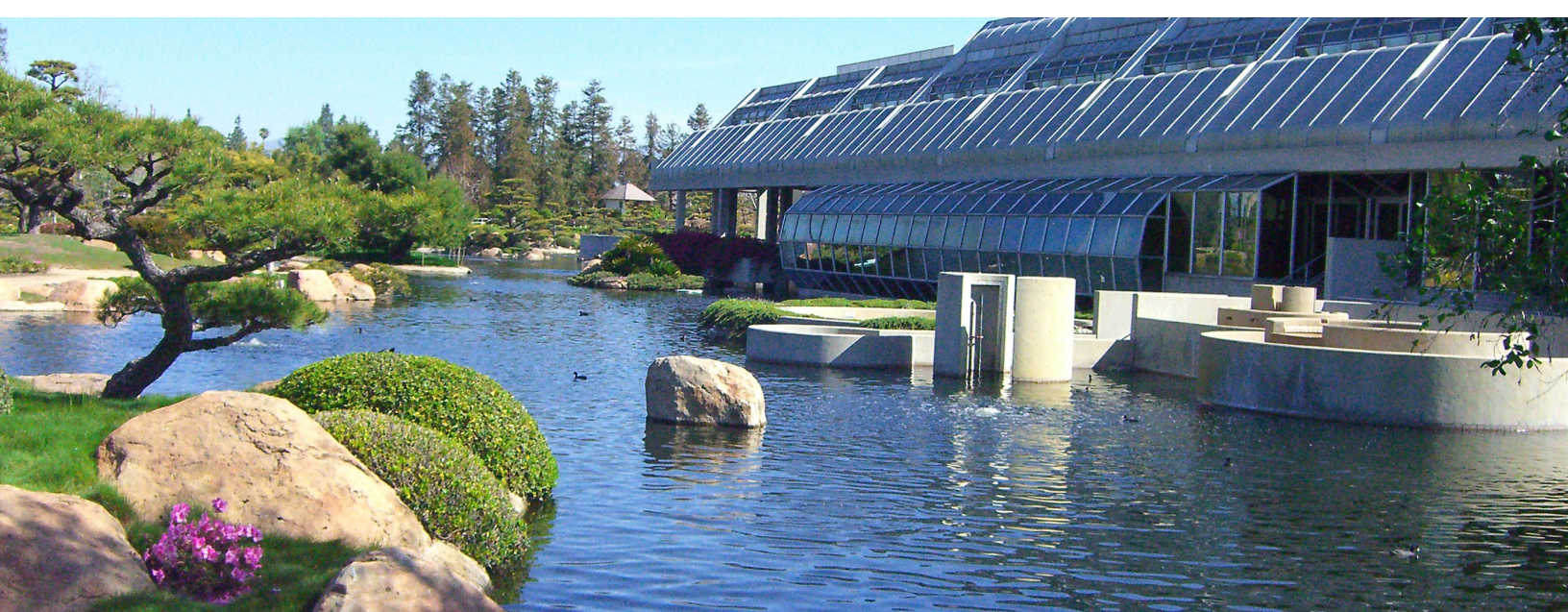
Donald C. Tillman Water Reclamation Plant and Japanese Gardens

Ecological systems. Environmental considerations are an important part of flood control systems. As the Los Angeles flood control system neared completion and public demand for water supplies, recreation and beautification increased, Congress provided for multiple use of facilities. By the 1960s watershed protection, electrical power, recreation, agriculture and water storage were integral secondary uses of flood control systems and considerations in flood control systems planning. Paving of the Los Angeles River bottom, and City in general, reduced groundwater recharge. To compensate for the loss, water spreading grounds were established to replenish underground aquifers. Three sections of the Los Angeles River have unpaved bottoms partially due to the existence of natural springs. These sections and dam basins provide natural habitats for wild animals and birds. The dam basins also provide land for recreation and agricultural uses. Sand bars, trees and heavy marsh growth provide protected habitats for water birds. Fish live in the river channel. Until 1984, the Los Angeles River channel, except for the unpaved sections, virtually was dry except during the rainy season. Upon completion of the San Fernando Valley Donald C. Tillman Wastewater Reclamation Plant (1984) a continuous flow of reclaimed water was sent down the channel creating a year round stream which has regenerated plant and animal