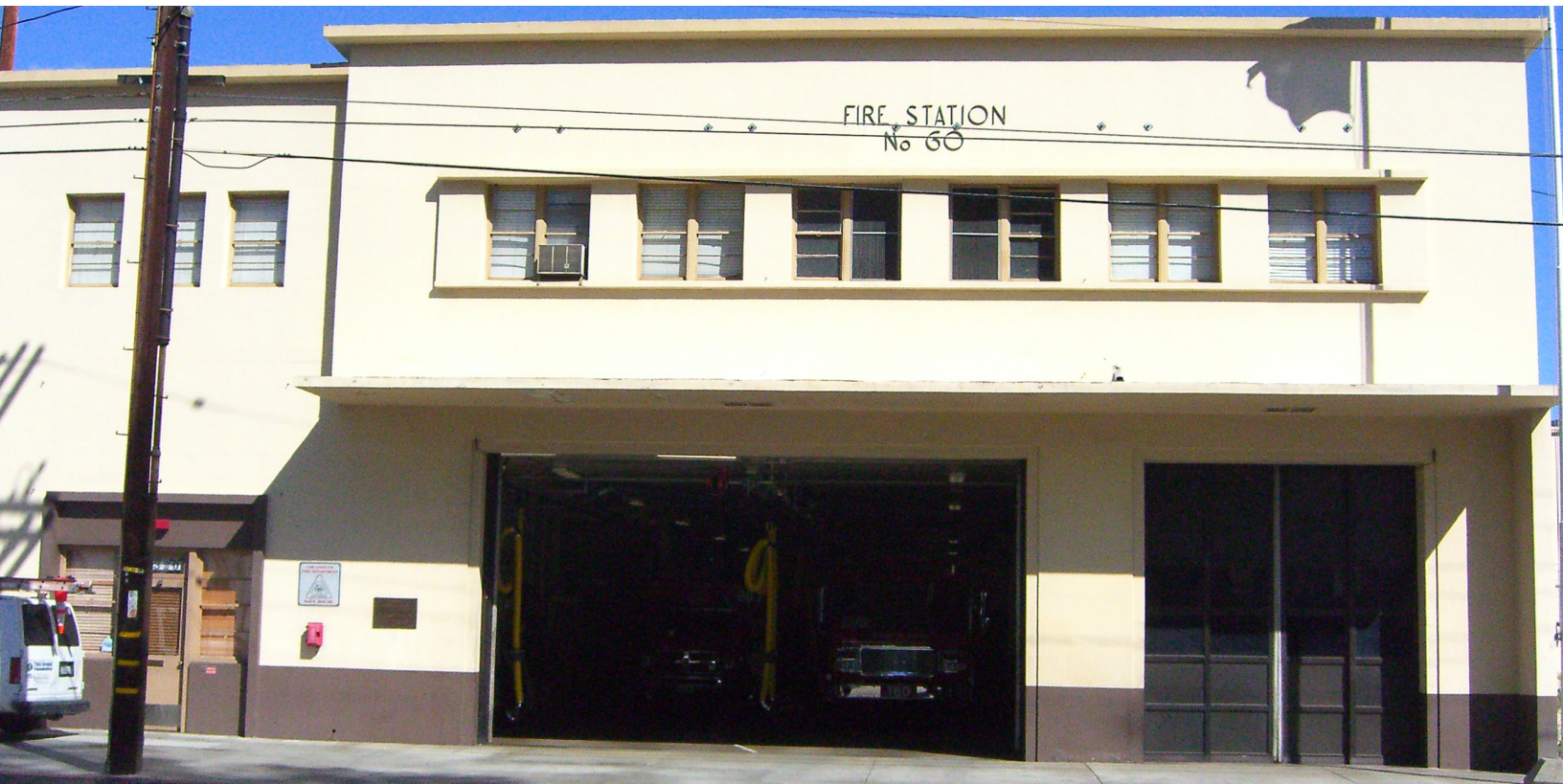
A fire station serving the North Hollywood community.

Today the City's approach to preventing and mitigating wildfire risk includes building standards, brush clearance, roadway requirements, parking restrictions, zoning limitations, and many more interventions detailed below.