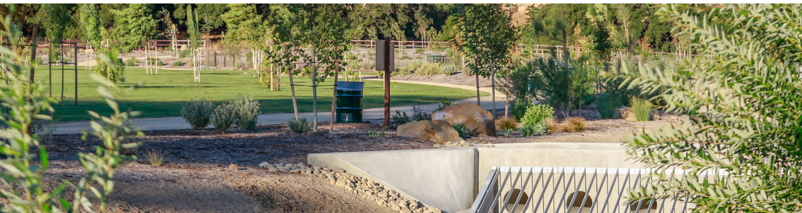
Stormwater infrastructure in Chatsworth Park South.

Generally short term goals are targeted for 0-5 years, medium term goals are 5-10 years, and long term goals are expected to take 15+ years to implement. A listing of department abbreviations is available in Appendix A.