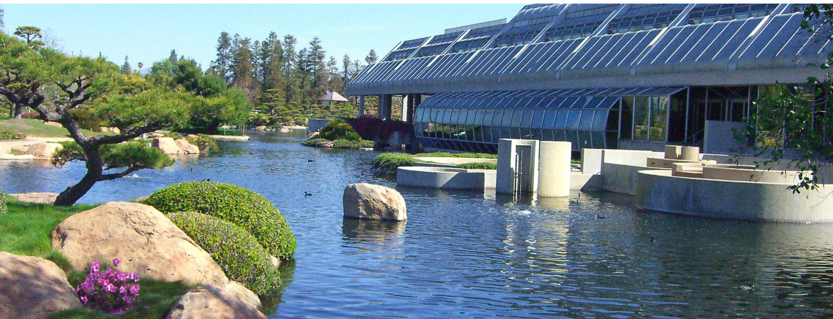
Donald C. Tillman Water Reclamation Plant and Japanese Gardens

Ecological systems. Environmental considerations are an important part of flood control systems. As the Los Angeles flood control system neared completion and public demand for water supplies, recreation and beautification increased, Congress provided for multiple use of facilities. By the 1960s watershed protection, electrical power, recreation, agriculture and water storage were integral secondary uses of flood control systems and considerations in flood control systems planning. Paving of the Los Angeles River bottom, and City in general, reduced groundwater recharge. To compensate for the loss, water spreading grounds were established to replenish underground aquifers. Three sections of the Los Angeles River have unpaved bottoms partially due to the existence of natural springs. These sections and dam basins provide natural habitats for wild animals and birds. The dam basins also provide land for recreation and agricultural uses. Sand bars, trees and heavy marsh growth provide protected habitats for water birds. Fish live in the river channel. Until 1984, the Los Angeles River channel, except for the unpaved sections, virtually was dry except during the rainy season. Upon completion of the San Fernando Valley Donald C. Tillman Wastewater Reclamation Plant (1984) a continuous flow of reclaimed water was sent down the channel creating a year round stream which has regenerated plant and animal