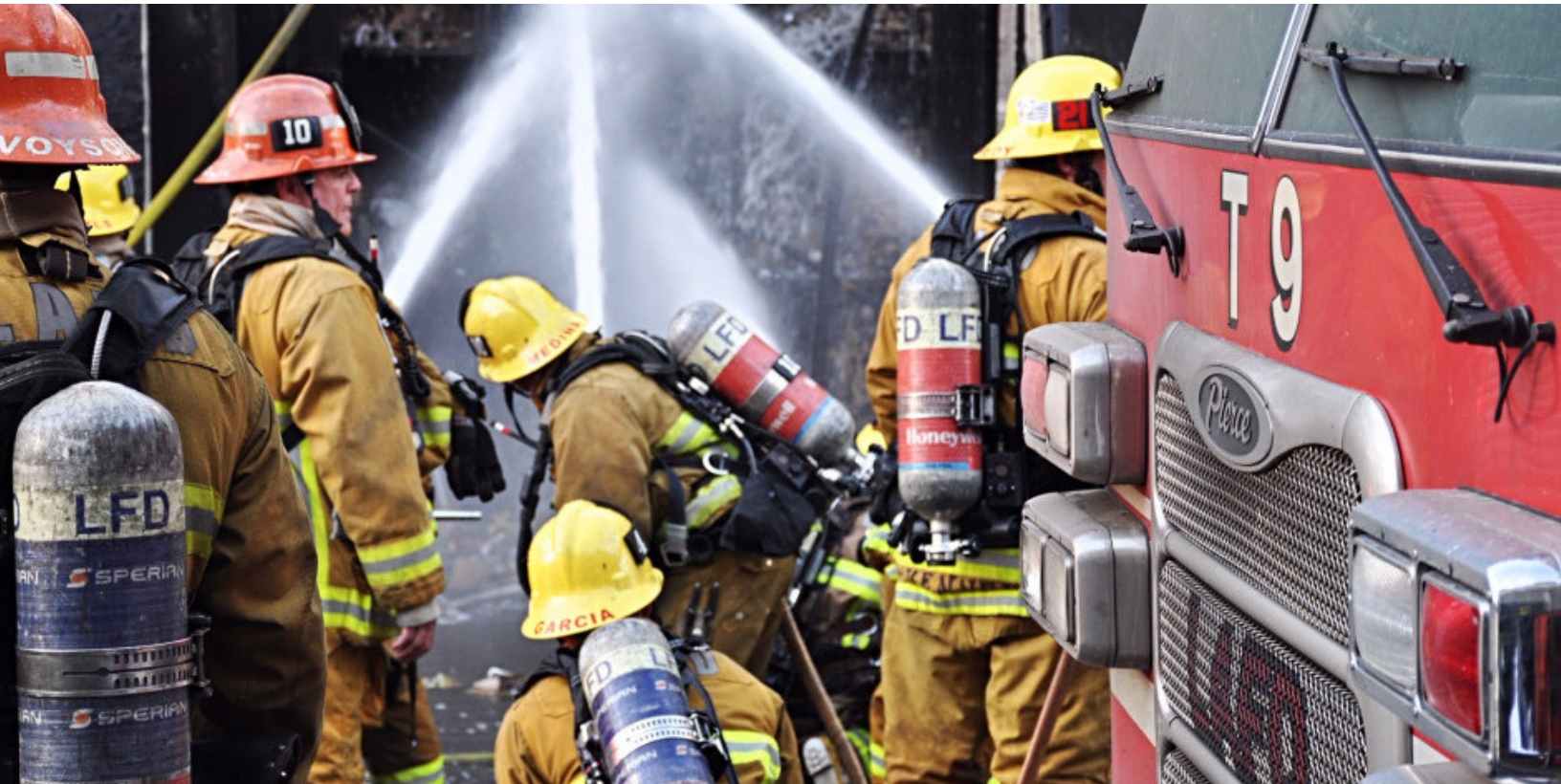
Los Angeles Fire Department responding to a structure fire.

The Los Angeles City Fire Department was established on February 1, 1886. Thirty firefighters, most of them former volunteers, were hired to man four leased firehouses. In addition, volunteer units were retained in the less populated areas outside the central city, including the San Fernando Valley. From the beginning the Department was an innovative, progressive agency which sought to secure the latest equipment, utilize the latest techniques and to develop better methods for fire fighting and prevention.