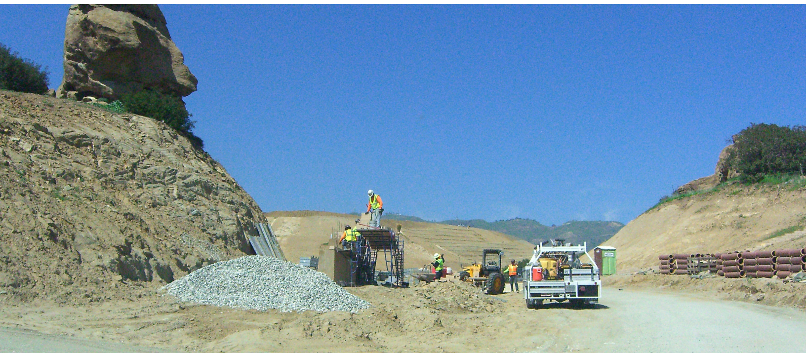
Hillside grading in the western San Fernando Valley .

The principal tools for mitigation of geologic hazards is the City's Municipal Code, including the Building and Zoning Codes. In 1929 the Building and Safety Department began to compile and correlate data on soil conditions for distribution to realtors,