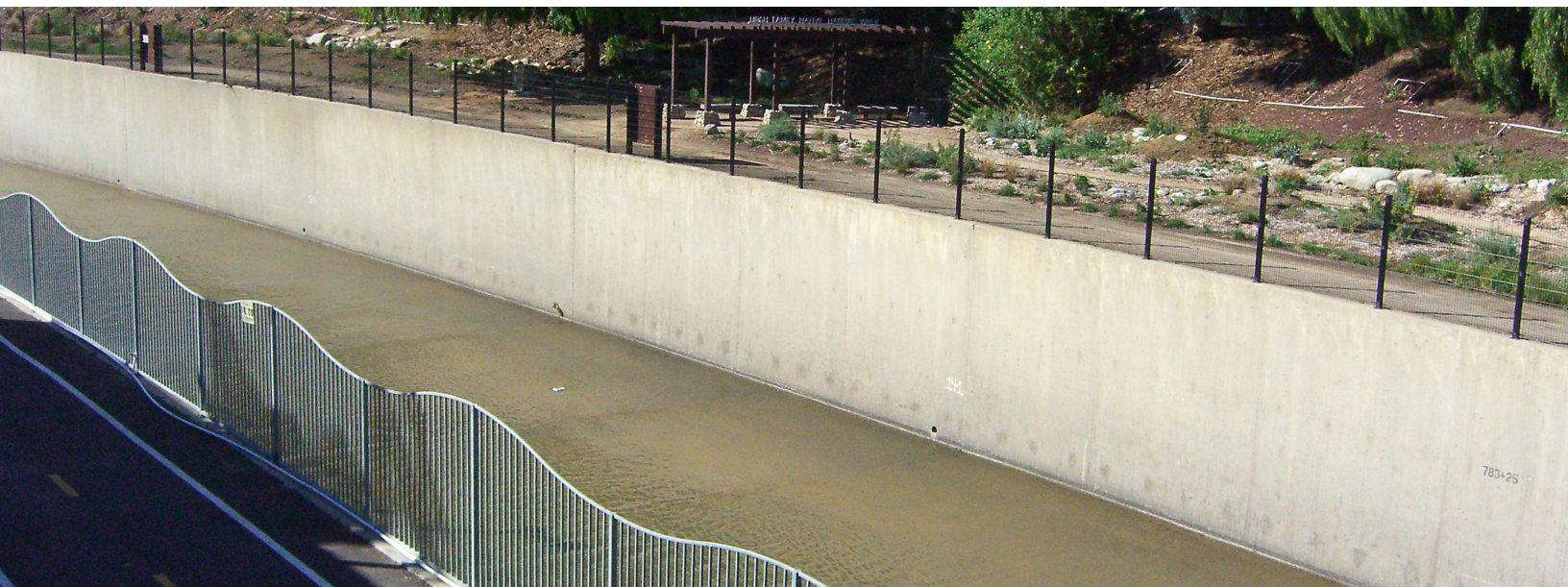
The Los Angeles River in Studio City, once a source of frequent flooding, now serves as a transportation and open space resource.

Capital floods. Major storms which cause a high magnitude of water flow can be devastating to a wide geographic area. They are the most dramatic and potentially the most hazardous water activity confronting the City. The Los Angeles region is a semi-arid region with rainfall that can have dramatic variation from year to year. Rains tend to occur in heavy, short duration storms between November and April. Severe storms are periodic and may not occur for several years. Paving of the City with structures and impermeable surfaces has reduced natural ponding areas which allowed water to