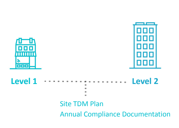
Figure 1: Compliance Requirements

Projects in all project levels are required to implement qualified TDM strategies to meet Program goals. For projects subject to the TDM Program, the Project applicant must prepare a TDM Plan that demonstrates compliance and submit the TDM Plan to LADOT for their review and approval. Before any use permit and/or certificate of occupancy are issued for the project, the Project applicants must execute and record a Covenant and Agreement that an approved TDM Plan, and the TDM strategies contained therein, will be maintained throughout the life of the project. A TDM Plan may be modified as specified in the TDM Ordinance and at the discretion of LADOT. The largest development projects (Level 3), with greater quantities of housing units and/or square footage, must also commit to more substantial monitoring obligations to ensure TDM strategies are effective. The figure below demonstrates the compliance and monitoring requirements by Project Level. Failure to meet monitoring obligations can subject the project to penalties.