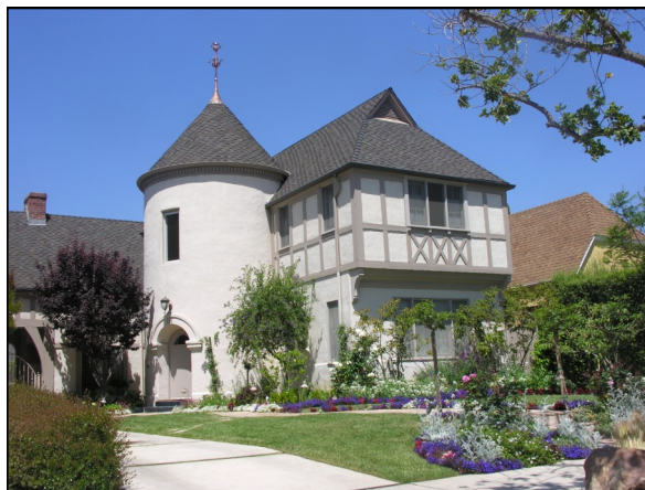
A home in the Miracle Mile North HPOZ, one of 16 historic districts with newly adopted Preservation Plans