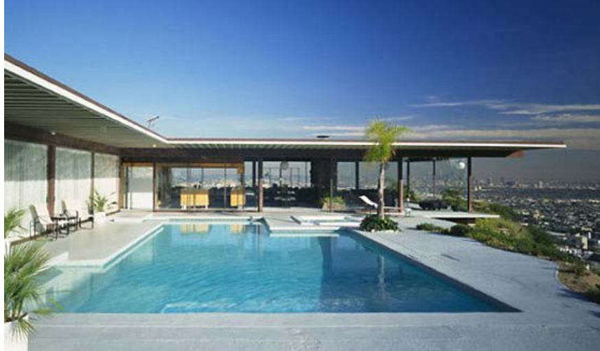
Stahl House, 1959-1960 L.A. Historic-Cultural Monument No. 670

Koenig built two steel-framed Case Study Houses, both of which are designated. 72 His first was the Bailey House, a level-lot project completed in 1958 (L. A. Historic-Cultural Monument No. 669, listed in the National Register) and identified as Case Study House Number 21. The second was his hillside Stahl House, completed in 1960 and identified as Case Study House Number 22 (L.A. Historic-Cultural Monument No. 670, listed in the National Register). Located on Woods Drive in the Hollywood Hills, north of the intersection of Sunset Boulevard and Sweetzer Avenue, it is best known for Julius Shulman's nighttime photograph of the city's lights viewed from the living room.