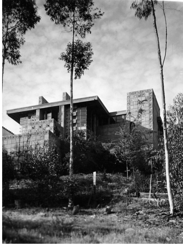
Freeman House, 1924 L.A. Historic-Cultural Monument No. 247

The Freeman House is located on Glencoe Way, a few blocks north of Hollywood Boulevard where it intersects with Highland Boulevard coming from the south. The site is steep, sloping downward to the south and east. The surrounding area had been subdivided in the early 1900s, but until 1922 Glencoe Way did not exist. In 1923, when work on the Freeman house began, Glencoe had been graded but still remained unpaved. 7