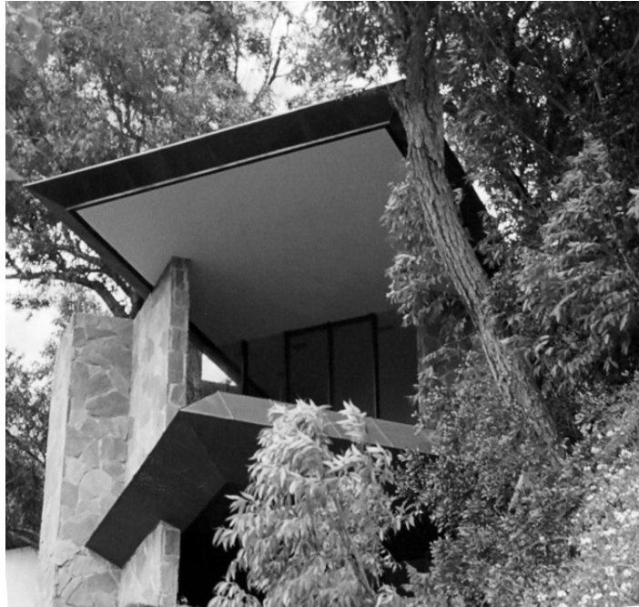
Wolff House, 1963

L.A. Historic-Cultural Monument No. 852 (L.A. Office of Historic Resources)