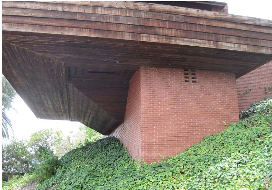
Cantilever support, Sturges House, 1939 L.A. Historic-Cultural Monument No. 577

To hold up this cantilever, Wright installed a row of diagonal wood brackets or struts. They begin about one-quarter of the way in from the corners of the brick foundation, and rest vertically against the upper half of the foundation wall. They extend diagonally upward and end below the living area wall. At this point they support a beam that runs parallel to the front of the house, under the living area wall. This beam extends beyond the row of brackets on both sides as far as the edges of the balcony. It supports all the joists and permits the balcony to cantilever beyond. 49