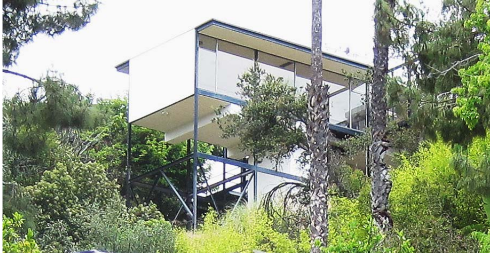
Smith House, 1955-1958 1095 Kenter Avenue, Brentwood

The first was Ellwood's Smith House. Craig Ellwood is still a controversial figure. Questions remain as to how many of the designs produced by his office were his and how many came from his talented staff. To some historians he was primarily the affable and well-connected head of the firm who brought in the commissions. Regardless of his role, the office of Craig Ellwood produced a series of stunning houses and commercial structures during the 1950s and 1960s that made expressive use of the steel frame. 66 The Smith House is one of these. Designed in 1955 and built in 1958, Reyner Banham has called it a classic among steel-framed hill houses. It is located at 1095 Kenter Avenue in Brentwood. The site slopes down toward the west from its high point along Kenter, a narrow and winding street extending north from Sunset Boulevard. 67