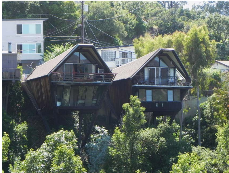
Boathouse Thematic Group, 1959 Pacific View Drive and Woodrow Wilson Drive, Cahuenga Pass

popular among developers. One was Sherman Oaks-Studio City area, overlooking Cahuenga Pass and the San Fernando Valley. The other was Northeast Los Angeles, particularly the neighborhoods of Mount Washington and Montecito Heights.