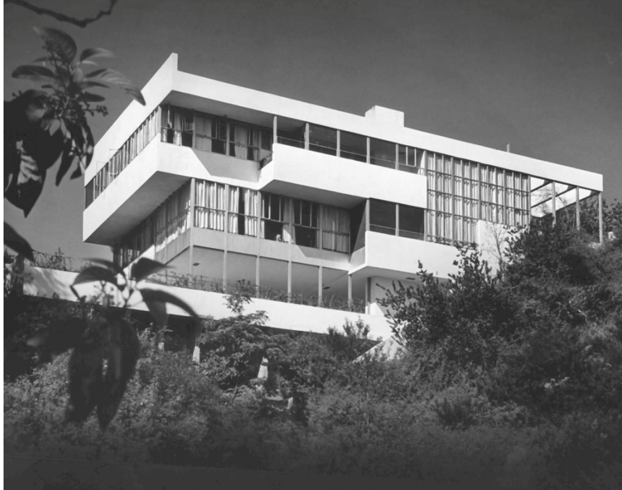
Lovell-Health House, 1929 L.A. Historic-Cultural Monument No. 123