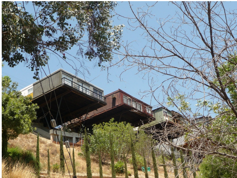
Montecito Drive Residential Historic District, 1961-1964 Montecito Drive, Montecito Heights (SurveyLA)

uniform, shallow setbacks from Montecito Drive and span the full width of their lots. Street-facing facades are dominated by one- and two-car garages or carports and entrance courtyards.