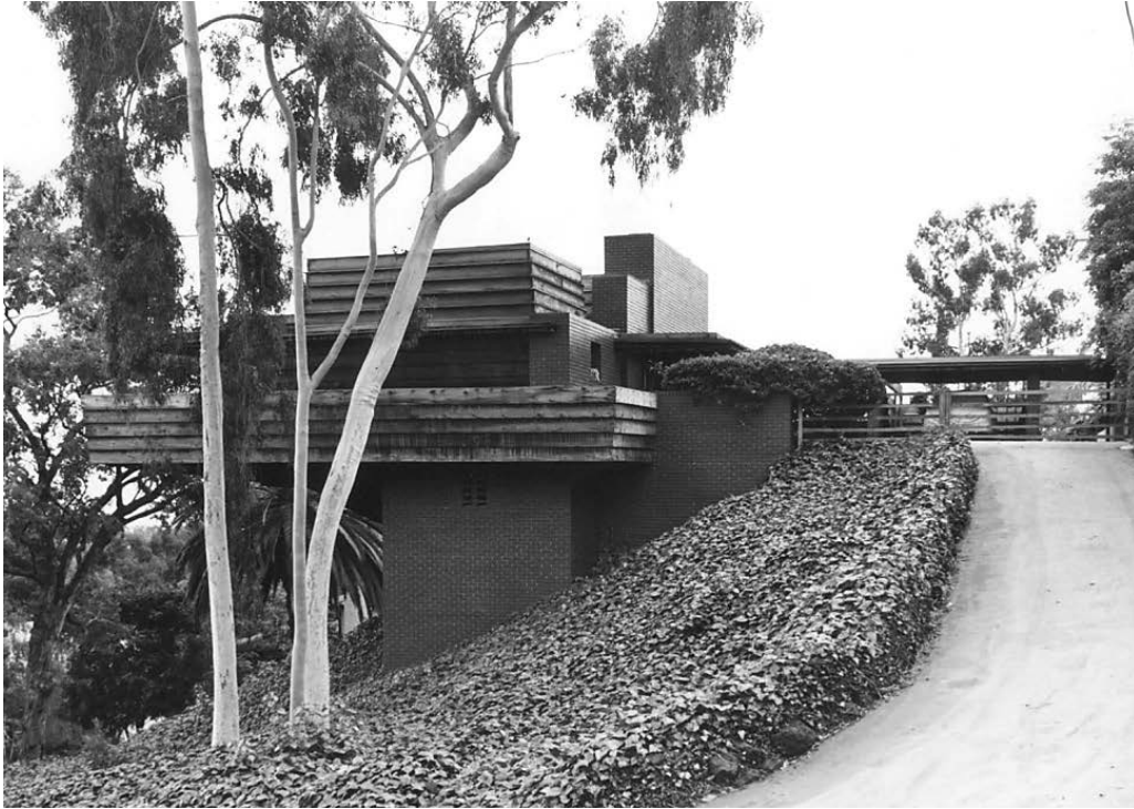
Sturges House, 1939

L.A. Historic-Cultural Monument No. 577 (L.A. Office of Historic Resources)