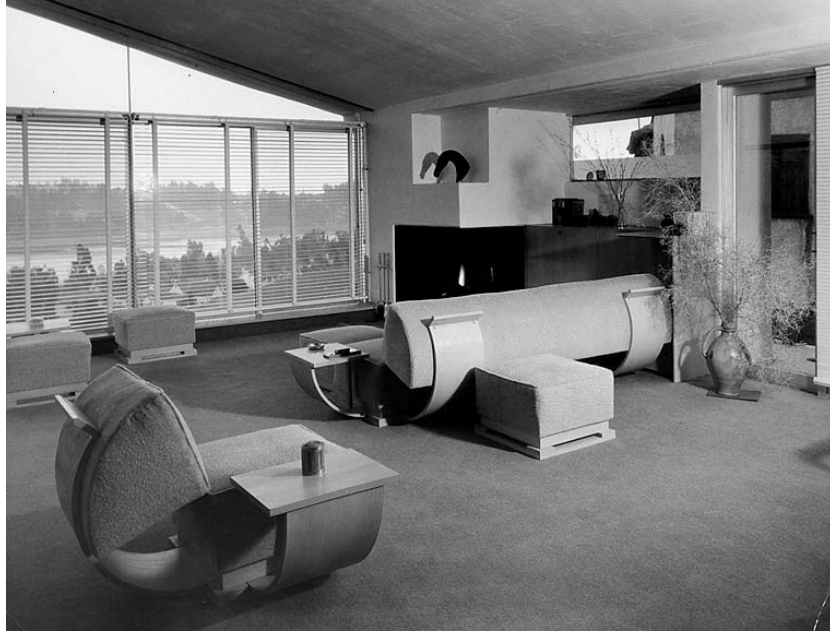
Living Room, Van Patten House, 1935 2320 Moreno Drive, Silver Lake

Schindler's hill houses from the 1930s were more varied in exterior composition, reflecting his interest in exploring different ways of expressing interior space. One which is notable for its use of the inverted floor plan is the Van Patten House of 1934-1935. It is located at 2320 Moreno Drive, on the western side of the Silver Lake Reservoir. The street runs along the high western edge of the lot, and the grade slopes steeply downward toward the east. 40