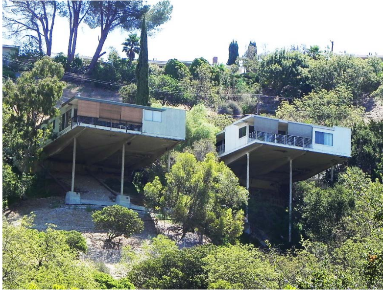
Platform House Residential District, 1962-1966 Oakfield Drive, Sherman Oaks