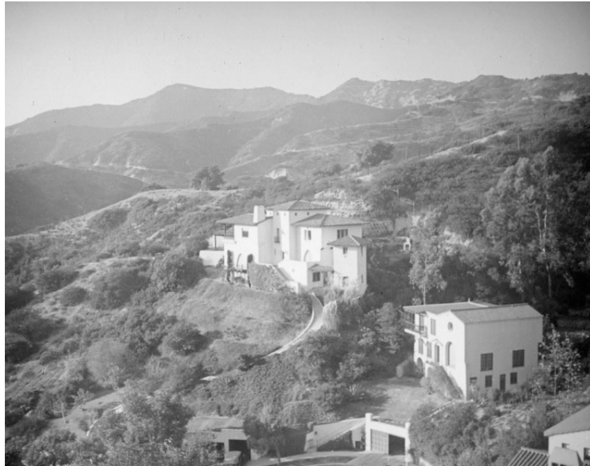
Spanish Colonial Revival houses from the 1920s Hollywood Hills

through the use of continuous stucco walls. These continuous walls could follow the slope of the lot, and the asymmetric assemblage of masses possible with the Spanish Colonial Revival allowed the house to adjust to the site in a picturesque manner. 5