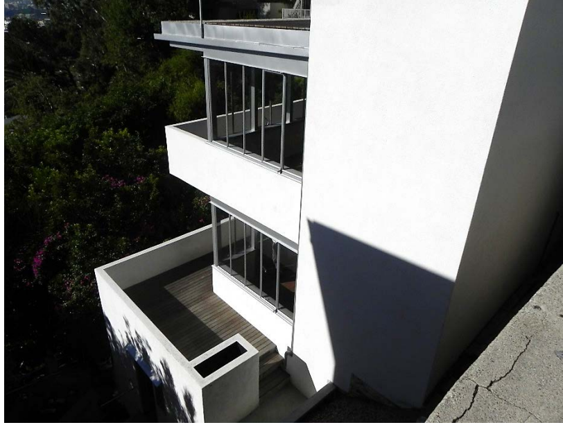
Kun House, 1935

L.A. Historic-Cultural Monument No. 1006 (L.A. Office of Historic Resources)