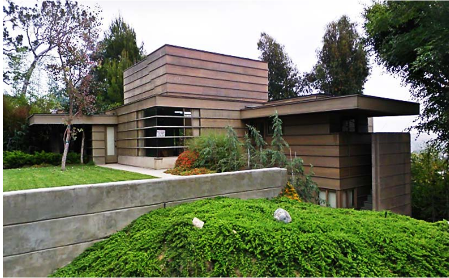
How House, 1925 (the garage is at the lower center, in the shadow)

L. A. Historic-Cultural Monument No. 895