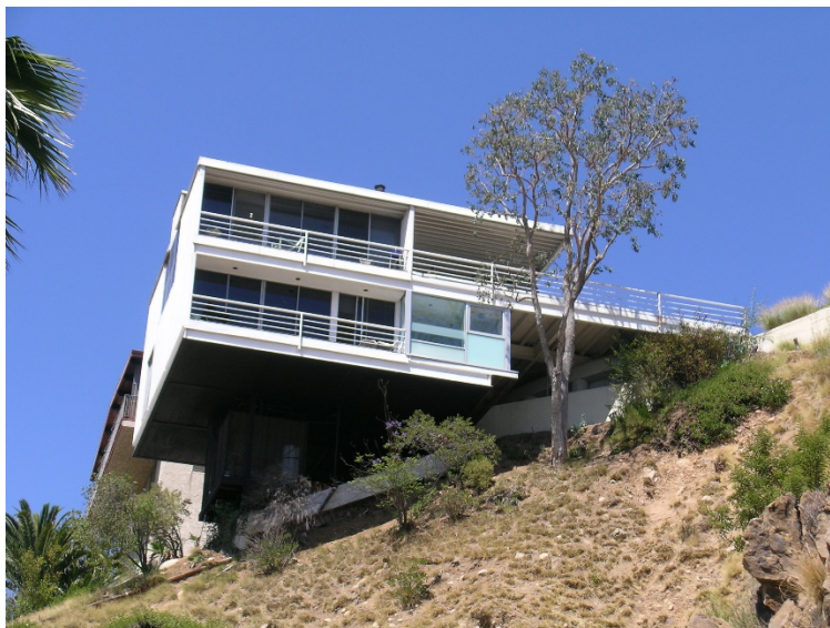
Gantert House, 1983 6431 West La Punta Drive, Hollywood

By the late 1960s the hill house as a type had lost popularity. This can be attributed to decreasing interest in Mid-Century Modernism, a style commonly associated with the hill house, and to changing regulations that discouraged the open underside of the platform house.