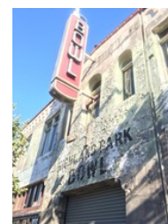
Highland Park Bowl

Across the street from the iconic Highland Theater, the much-celebrated Highland Park Bowl recently opened as the oldest bowling alley in Los Angeles. The bowl replaced Mr. T's—a popular concert venue that operated for decades as a favorite bar for a locals and an underground party destination for young revelers. Art Deco aluminum cladding was removed to reveal a concrete tilt-up construction Spanish Colonial Revival structure. The simple facade of the exterior remains intact, complete with peeling paint from the original 1940s bowling alley. Visitors should be sure to step inside for a view of the surprisingly ornate bowling lanes.