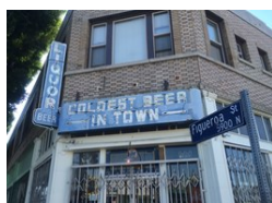
"Coldest Beer in Town"

On Avenue 59, a neon sign proudly advertising "Coldest Beer in Town" has been rehabilitated and serves as a glowing welcome to the historic corridor. Next door, a former post office built in 1932 has been partially restored and reopened as a bakery. The owners worked with the HPOZ Board to restore character-defining features such as the storefronts and lighting, while also incorporating some modern playful details, like brass-plated triangles inlaid into the bulkhead. The owner hopes to restore the original parapet sometime in the future.