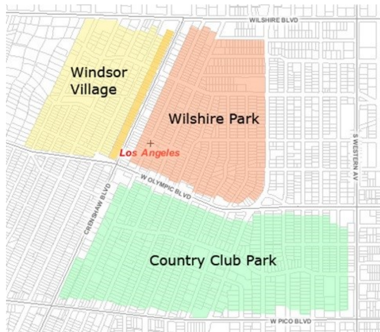
The new HPOZ Ordinance allows multiple HPOZs to share a single Board—an approach that was pioneered by the "Triplets"—Country Club Park, Windsor Village, and Wilshire Park

The current ordinance requires that almost all Conforming Work on Non-Contributing features be "signed-off" or approved. In implementation, the lack of review authority and design standards has resulted in projects that have proven detrimental to the overall historic character of HPOZ neighborhoods. The amendments remedy this discrepancy by enabling review of projects affecting Non-Contributing Elements for conformity with the Preservation Plan and allowing for design guidelines for alterations to Non-Contributing Elements, which will still provide greater leeway for changes than on projects affecting Contributing Elements.