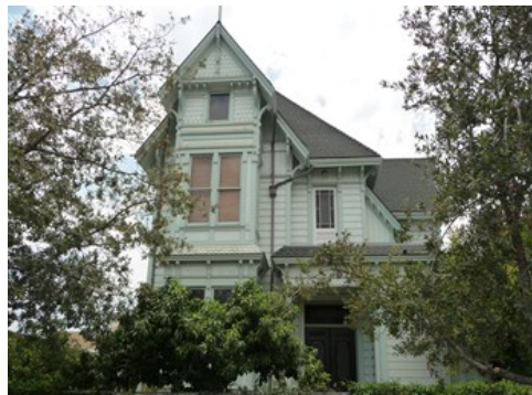
2419 N. Sichel Street, Lincoln Heights

2419 N. Sichel St. (1887), representing some of the earliest development in Lincoln Heights and an excellent example of Eastlake residential architecture.