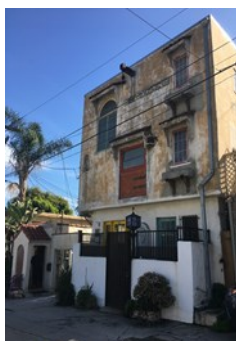
HCM #1143 — Finn Frolich House, 5152 La Vista Court

Built in 1925, the Finn Frolich House is a multi-family dwelling located in the Larchmont Village neighborhood. The structure was designed and constructed by the sculptor and original occupant, Finn Haakon Frolich (1868-1947), and has served primarily as a sculptor's studio, cultural hub, and residence throughout its history.