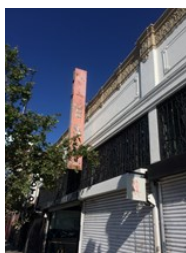
"ESS" on the blade sign

Up the street, it's still possible to make out the "ESS" on the blade sign that marked the second home of the Highland Park Kress Department store. The Highland Park HPOZ Board has encouraged the preservation and maintenance of these details, and guided new tenants to adopt this historic vernacular by installing signage and storefronts consistent with those original to the area.