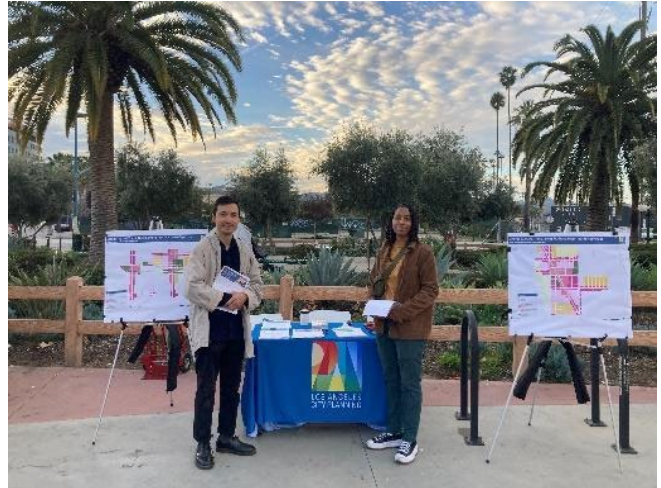
OLTNP Team flyering at the NoHo Station

The Metro Orange (G) Line North Hollywood Station is near the Chandler and Lankershim Boulevards intersection. This is the terminus of the Metro Orange (G) Line that connects riders to the North Hollywood Station of the Metro Red (B) Line. On Wednesday morning, January 31, 2024, the team set up near the transfer portal for the Orange (G) Line to the Red (B) Line located next to Groundworks Coffee, a local shop. In this same area, the team also engaged with transit riders waiting at the DASH and Metro bus stops. During this time, the team spoke with a Metro Transit Ambassador, People Assisting the Homeless (PATH) staff, and LA Family Housing service providers. In total, the team had 158 interactions.