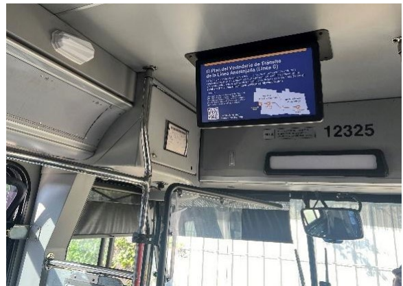
OLTNP DASH bus ad in Spanish

The ads, which were produced in English and Spanish, reached an estimated 489,617 transit users over the duration of their run.