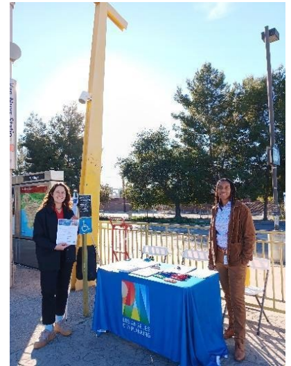
OLTNP Team flyering at the Van Nuys Station

On January 23 and 24, 2024 the team handed out approximately 200 flyers about the work program around all three stations included in the OLTNP. Near the Van Nuys and Sepulveda Stations, the team handed out materials at community spaces and local businesses such as the Mid Valley Family YMCA, Farm Table restaurant, laundromats, the Van Nuys Library, and the Van Nuys Civic Center. In the North Hollywood Station area, the team handed out flyers at places such as Groundworks Coffee, elementary schools, recreational centers, and the East Valley Family YMCA. The team also partnered with the Department of Recreation and Parks to post the outreach flyer on the bulletin boards at senior centers, pools, and recreation centers around the San Fernando Valley.