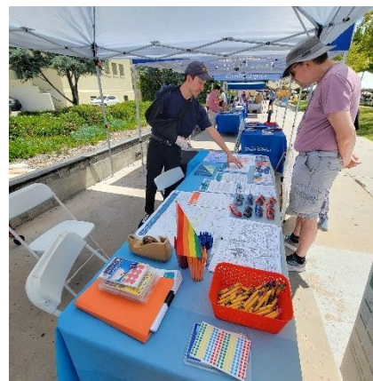
OLTNP Staff at Valley Pride 2023

The Los Angeles Department of City Planning had a booth at the Valley Pride event on June 24, 2023, the North Hollywood CicLAMini on September 17, 2023, and the Sherman Oaks Street Fair on October 15, 2023. At these booths, the OLTNP team distributed project materials and signed people up to join the interested parties list for the project, so that they would receive email notifications regarding all future project updates. During these events the OLTNP and Valley DCP staff were able to have meaningful, one-on-one conversations about the work program and how stakeholders could stay updated. In total there were over 450 interactions during these community events.