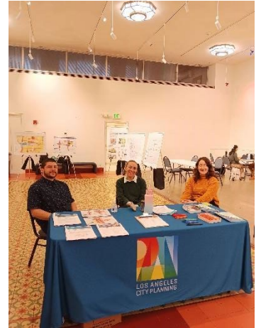
LACP Staff at the OLTNP Open House

During the four rounds of Office Hours there were a total of 20 stakeholders that participated and 9 staff members who supported. A complete list of Office Hours attendees can be found in Appendix 1.4.