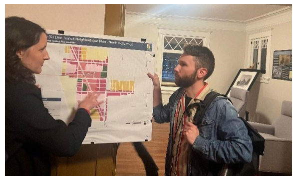
OLTNP Staff and NoHo Neighborhood Council Planning, Land Use, and Transportation (PLUT) Committee Board Member

At the Land Use Committee meetings, the team delivered presentations which provided an overview of the OLTNP, with special attention paid to station areas and topics of most relevance to the particular Neighborhood Council being presented to. The team provided project materials that included fact sheets about the work program, the draft proposed GPLU maps for the Van Nuys-Sepulveda and North Hollywood Stations, and printed copies of the PowerPoint slides used in the presentations which were delivered at the meetings. The team answered questions from board and committee members, as well as the community at large. Contact information for OLTNP staff was also shared at every meeting in order to encourage