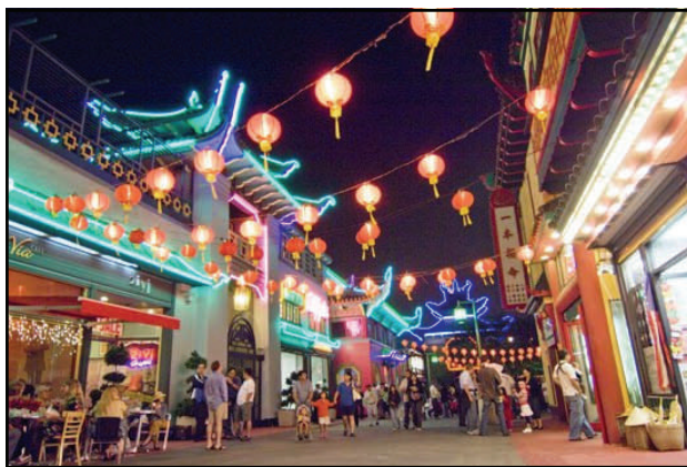
New neon lights have helped revitalize Central Plaza, a centerpiece of the Chinatown “Preserve America” community

The three new Los Angeles Preserve America communities are: