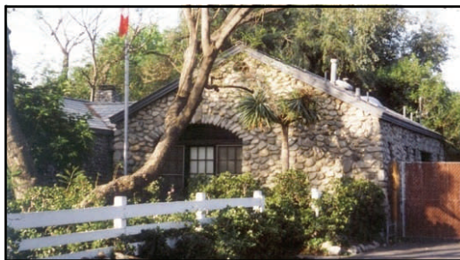
Home in the Stonehurst HPOZ

Wilshire Park includes 527 parcels and is roughly bounded by Wilshire Boulevard to the north, Olympic Boulevard to the south, Wilton Place to the east, and both sides of Bronson Avenue on the west. The proposed Wilshire Park HPOZ has a high concentration of Contributing, or historic structures (approximately 74%) built between 1905 to 1941, in an array of architectural styles including Craftsman, Mediterranean Revival, Colonial Revival, Spanish Colonial Revival, and the largest collection of Dutch Colonial Revival within a single HPOZ.