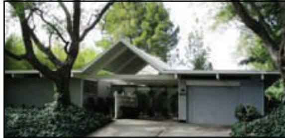
Home in Balboa Highlands

These proposed HPOZs are likely to proceed to the approval process during 2009.