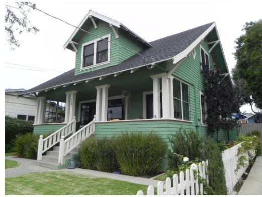
Address: 718 W. Shepard Street