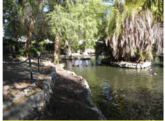
Location: 13 th Street and Weymouth Avenue Name: Averill Park Date: circa 1925