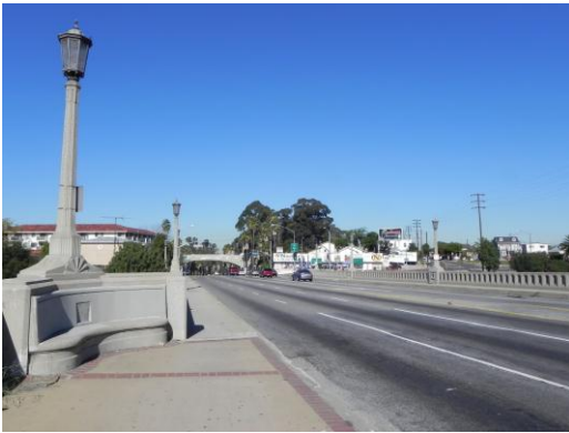
Location: Gaffey Street between Summerland Avenue and Oliver Street Name: Gaffey Street Bridge Date: 1935

The Other Context is used to capture property types for which a specific context/theme has not yet been developed. In San Pedro, this Context/Theme was used to evaluate two arched concrete bridges as excellent examples of pre-World War II public works civic improvement projects. The Gaffey Street Bridge and the Elberon Avenue Bridge both date from 1935 and share many physical characteristics, including fluted concrete piers, concrete balustrades, and integrated lampposts with original globes.