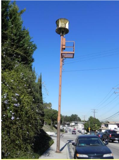
Location: Park Western Avenue between Via La Paz and Via Cordova Name: Air Raid Siren 83 Date: circa 1940

This Context/Theme was used to evaluate extant examples of air raid sirens. Air raid sirens were installed throughout Los Angeles during the World War II and Cold War periods and have generally remained untouched since then. Two examples of the Federal Model SD-10 “Wire Spool” type were identified in San Pedro, both installed on a freestanding support pole.