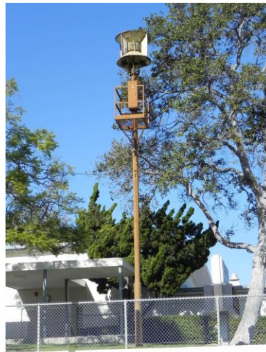
Location: 7 th Street, just west of Weymouth Name: Air Raid Siren 84 Date: circa 1940