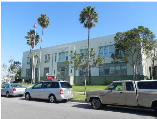
Address: 2120 S. Leland Street Name: Leland Street Elementary School Date: 1935