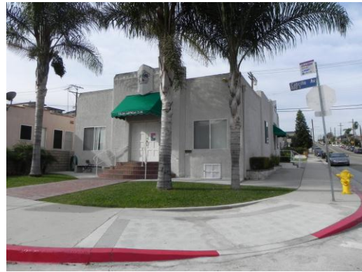
Address: 1903 S. Cabrillo Avenue Name: Italian-American Club of San Pedro Date: 1937