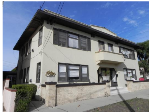
Address: 4001-4007 Pacific Avenue