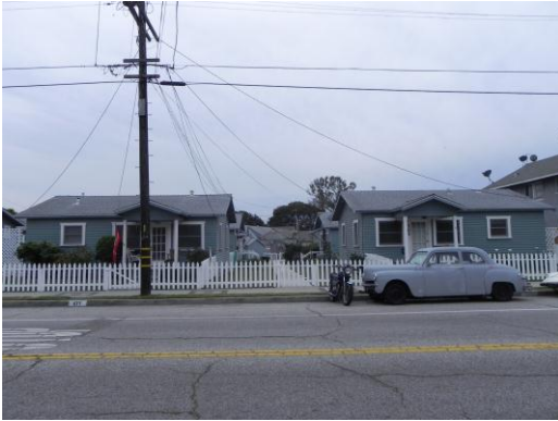
Address: 675-705 Shepard Street

Significant examples of bungalow courts were evaluated under this Context/Theme. Bungalow courts are not common in San Pedro, where the apartment house was the more typical form of multi-family residential development in the 1920s. Of the few extant examples, many have been substantially altered; intact examples are quite rare.