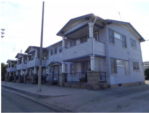
Address: 409-423 W. 22 nd Street

Significant examples of apartment houses were evaluated under this Context/Theme. Apartment houses from the 1920s and 1930s have particular significance in San Pedro, where the local economy was closely tied to the port. In the early decades of the 20 th century, San Pedro was primarily known as an industrial center rather than as a residential community. Work in those industries was often seasonal, creating a particularly strong demand for apartment houses in this area of the city. Most examples were located along primary thoroughfares, particularly those that had a streetcar line. Today, most apartment houses from this period have been substantially altered, such that intact examples are noteworthy.