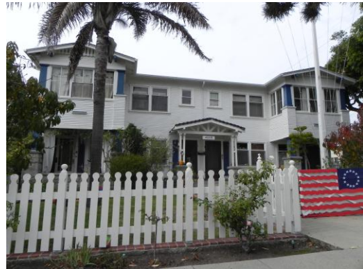
Address: 4005 S. Carolina Street