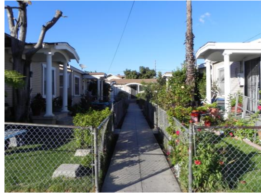
Address: 220-234 Sepulveda Street