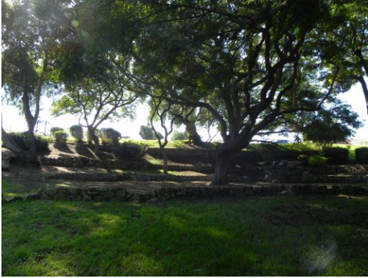
Location: 21 st Street between Alma and Myler Streets Name: Alma Park Date: circa 1925