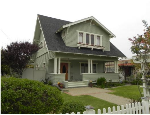
Address: 3900 S. Carolina Street

This Context/Theme was used to evaluate significant examples of Craftsman architecture that exhibit high quality of design and craftsmanship. In San Pedro, the best examples are of the two-story variation, which typically possess more of the architectural details commonly associated with the Arts and Crafts movement, including horizontal wood siding, overhanging eaves, wood eave brackets, exposed rafter tails, and wide front porches.