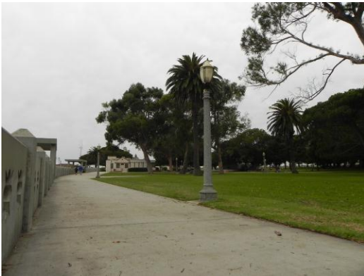
Location: On the bluff below Paseo del Mar Name: Point Fermin Park Date: circa 1925

This Context/Theme was used to evaluate significant examples of municipal parks. San Pedro has an impressive system of neighborhood and bluff-side parks which take advantage of the hilly topography as well as ocean and harbor views. Identified examples include Plaza Park, one of San Pedro's oldest parks, established in 1889; and Point Fermin Park, which contains the Point Fermin Lighthouse, which is a designated Historic-Cultural Monument. In addition, the survey identified four parks (Peck Park, Leland Park, Alma Park, Rena Park) developed in the 1920s and 1930s on lands donated by early city pioneer and developer George Huntington Peck, Jr. These parks were developed as part of an initiative to promote San Pedro as a livable "city of homes," in addition to its reputation as a place of industry. Park features include mature trees and decorative plantings, light posts, pedestrian pathways and foot bridges, concrete walls and stone retaining walls, bandstands and amphitheaters, water features, recreation facilities and children's playgrounds, and other service buildings.