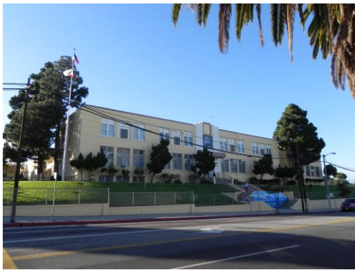
Address: 423 N. Pacific Avenue Name: Barton Hill Elementary School Date: 1933

Public schools dating from the period following the 1933 Long Beach Earthquake were evaluated under this Context/Theme. The earthquake destroyed or damaged beyond repair some forty LAUSD schools, including nearly all schools in nearby San Pedro. In some cases, damaged buildings were repaired and substantially remodeled in a contemporary style. In other cases, original school buildings were destroyed or damaged beyond repaired and replaced by new construction. In both instances, existing buildings were evaluated as dating from the post-1933 period.