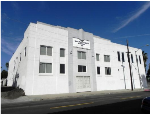
Address: 1639 S. Palos Verdes Street Name: Dalmatian-American Club of San Pedro Date: 1935

This Context/Theme was used to evaluate significant examples of social clubs with an important ethnic/cultural association. The Dalmatian-American Club of San Pedro was founded in 1926 as the Yugoslav Club; the Italian-American Club of San Pedro originally opened as the Yugoslav Women's Club. Both of these properties were identified for their association with important ethnic/cultural communities that historically resided in San Pedro.