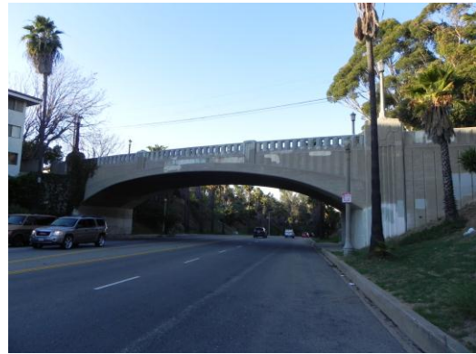
Location: Elberon Avenue over Gaffey Street Name: Elberon Avenue Bridge Date: 1935