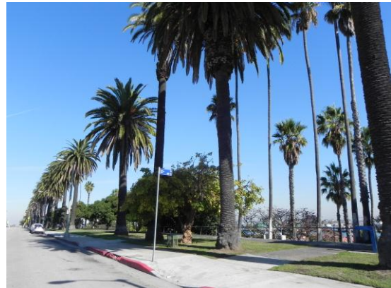
Location: On the bluff east of Beacon Street Name: San Pedro Plaza Park Date: 1889