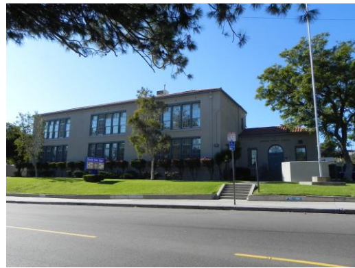
Address: 425 N. Bandini Street Name: Bandini Street Elementary School Date: 1935