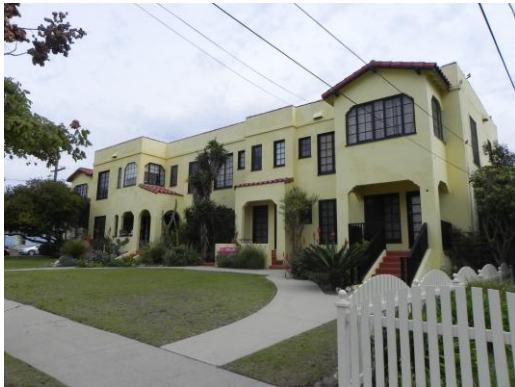
Address: 615 W. 40 th Street