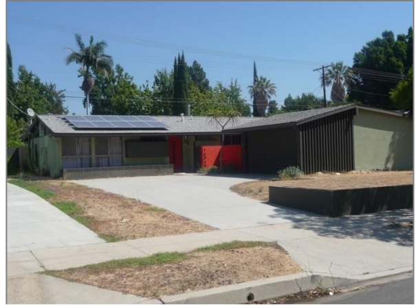
Address: 16345 W. Gledhill St. Architect: Palmer and Krisel Date: 1956