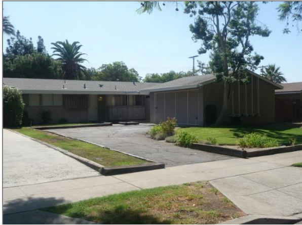
Address: 9330 N. Gothic Ave. Architect: Palmer and Krisel Date: 1956