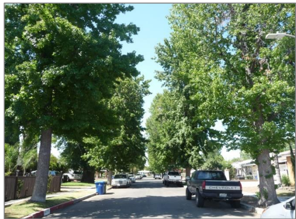
District: Van Nuys Gardens Street Trees Description: American Sweetgum Trees on Redbush Lane Date: 1949-1950