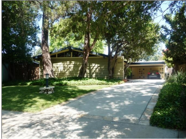
Address: 9337 N. Sophia Ave. Architect: Palmer and Krisel Date: 1956