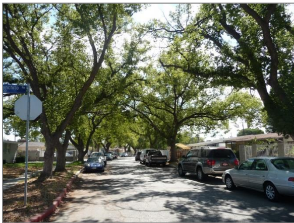
District: Van Nuys Gardens Street Trees Description: Camphor Trees on Broadleaf Avenue Date: 1949-1950

Most residential development in the Survey Area took place in the post-World War II period and consists of large-scale, master-planned residential subdivisions. These subdivisions often include distinctive planning features, such as curvilinear street plans, concrete sidewalks, streetlamps, parkways, and regularly-spaced street trees. One subdivision, Van Nuys Gardens, was identified as retaining a particularly notable street tree planting plan, implemented by the developers to entice potential homebuyers. Mature trees form shady canopies over streets, and consistency of a small variety of species gives the subdivision a distinct sense of place.