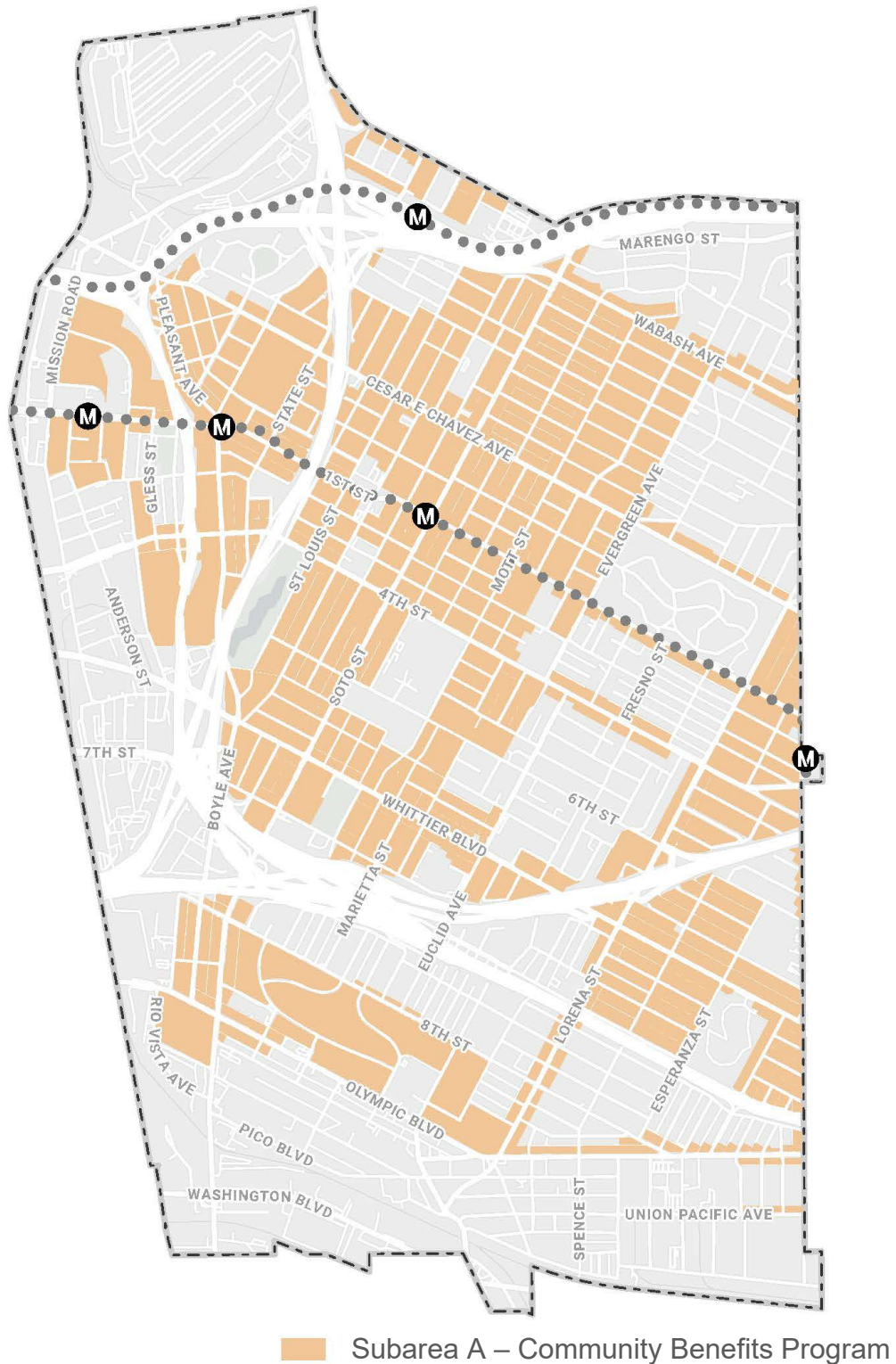
Figure 1. Subarea A - Community Benefits Program