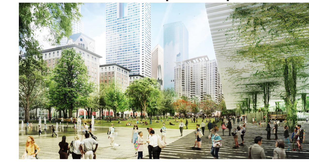
Community & Transportation Facilities