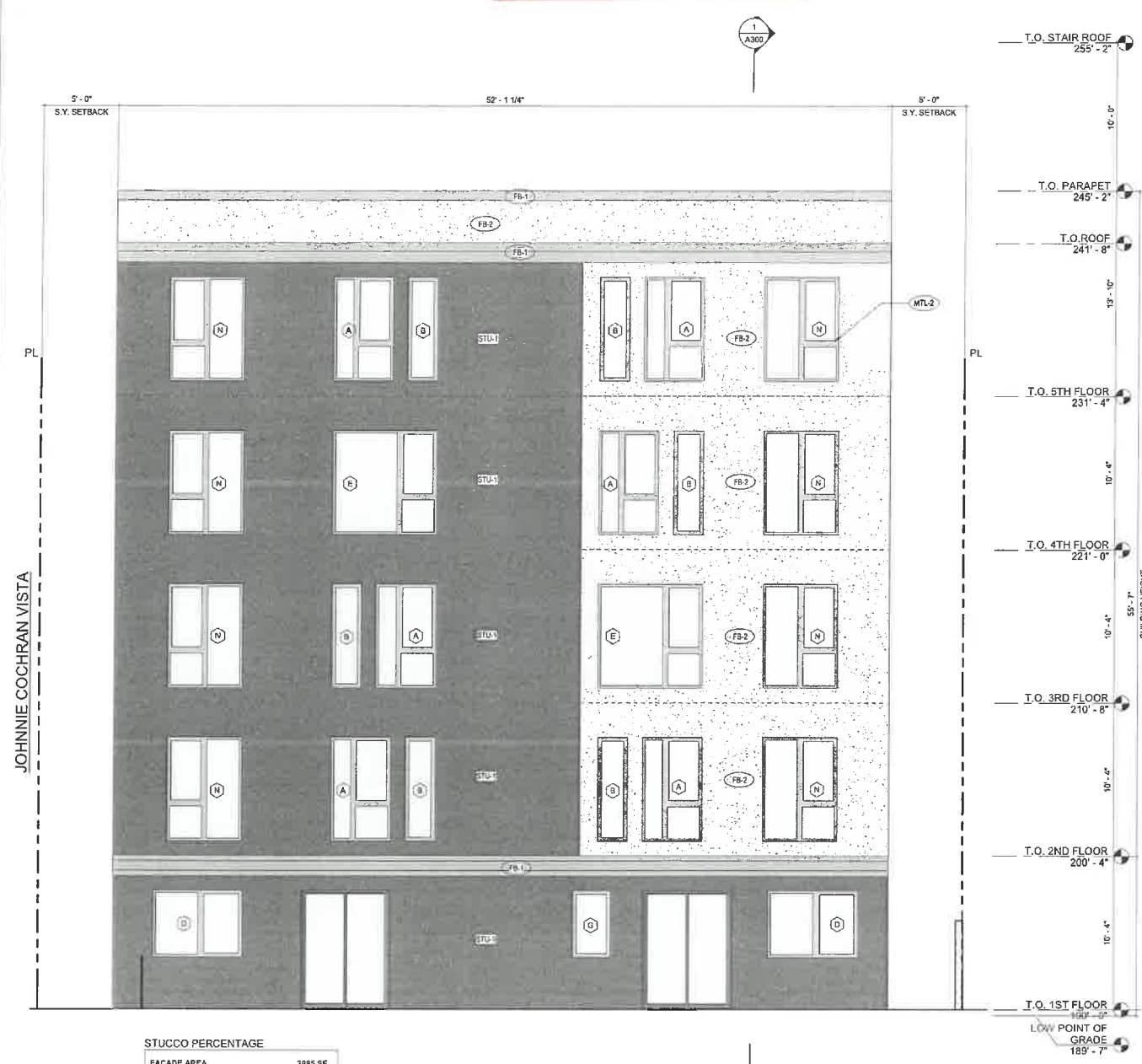
2 NORTHWEST ELEVATION 1/4" = 1'-0"