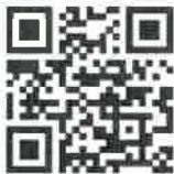
QR Code to Online Appeal Filing

An appeal application must be submitted and paid for before 4:30 PM (PST) on the final day to appeal the determination. Should the final day fall on a weekend or legal City holiday, the time for filing an appeal shall be extended to 4:30 PM (PST) on the next succeeding working day. Appeals should be filed early to ensure that DSC staff members have adequate time to review and accept the documents, and to allow appellants time to submit payment.