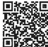
QR Code to Forms for In-Person Filing