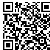
QR Code to Forms for In-Person Filing