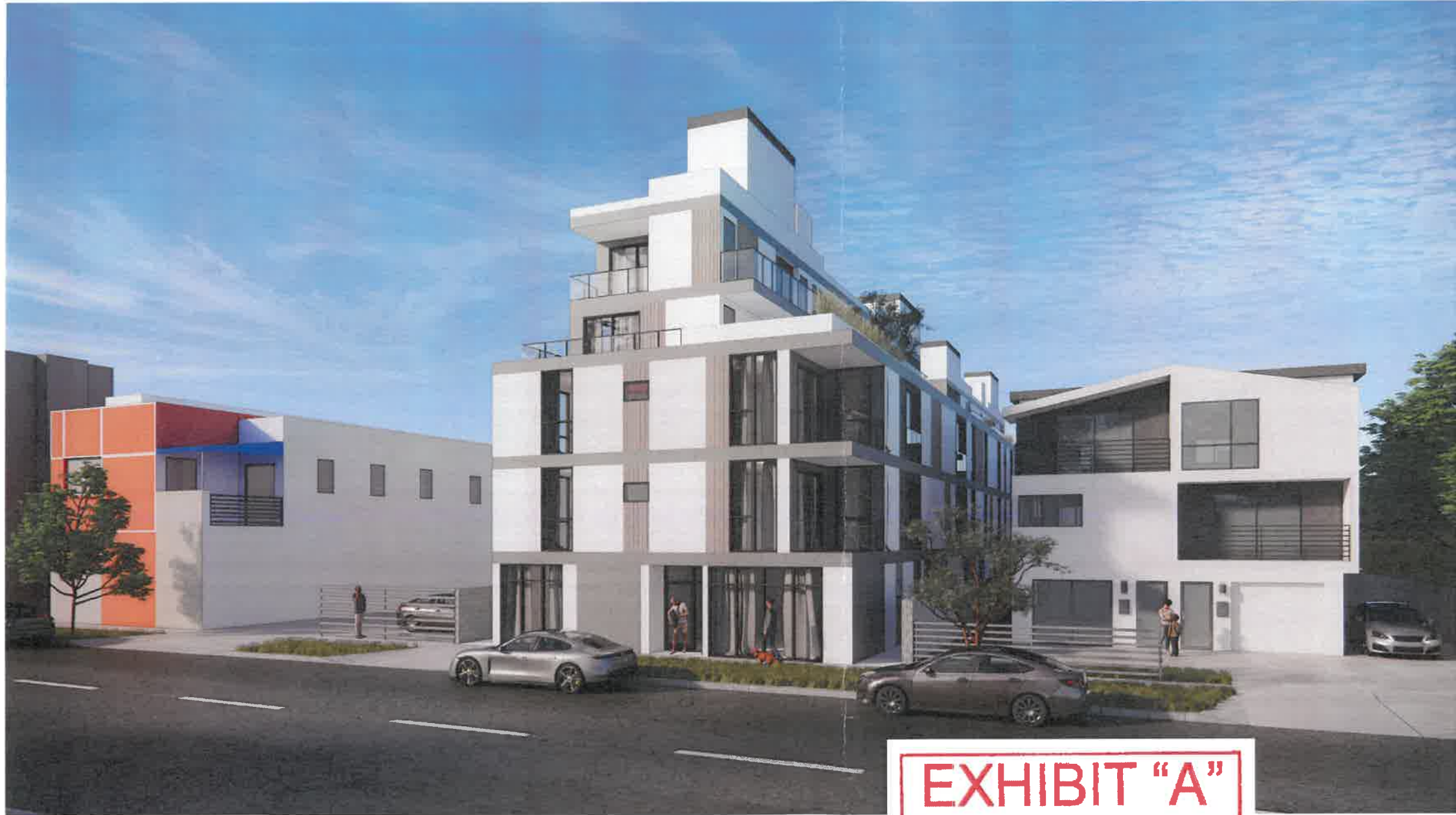
EXHIBIT "A" Page No. 22 of 33 Case No. DIR-2021-1538-TOC-SPP-HCA