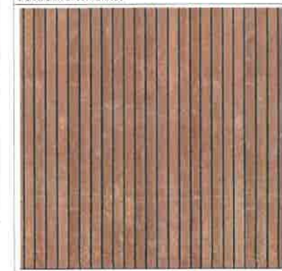
4. WOOD VENEER

ARCHITECT: AARON BRUMER AND ASSOC. ARCHITECTS 10999 RIVERSIDE DRIVE, SUITE #302 NORTH HOLLYWOOD, CA 91602 PHONE: (310) 422-9234 EMAIL: AARON@AARONBRUMER.COM