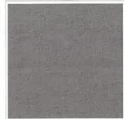
3. DARK GRAY SMOOTH STUCCO