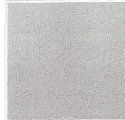
2. LIGHT GRAY SMOOTH STUCCO