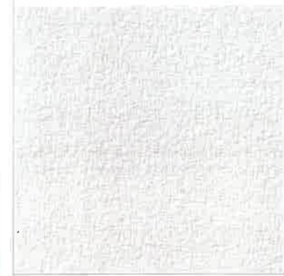
1. WHITE SMOOTH STUCCO

EXHIBIT "A" Page No. 23 of 33 Case No. DIR-2021-1538-TOC-SPP-HCA