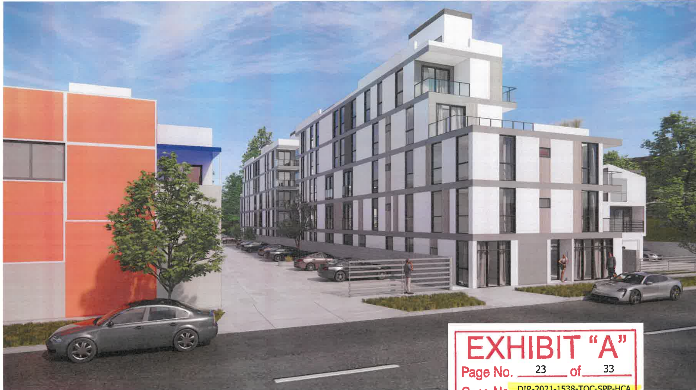
EXHIBIT "A" Page No. 23 of 33 Case No. DIR-2021-1538-TOC-SPP-HCA