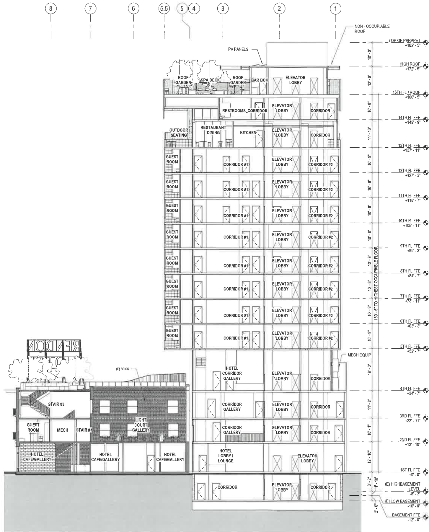
EXHIBIT "A" Page No. 24 of 29 Case No. CPC-2017-0734-GPA-ZO-HD-CLB-CUK-TV-2A-SPR-RIP

THIS DRAWING AND THE INFORMATION CONTAINED HEREIN ARE THE COPYRIGHTED WORK OF OMGIVNING ARCHITECTS AND MAY NOT BE REPRODUCED WITHOUT WRITTEN PERMISSION.