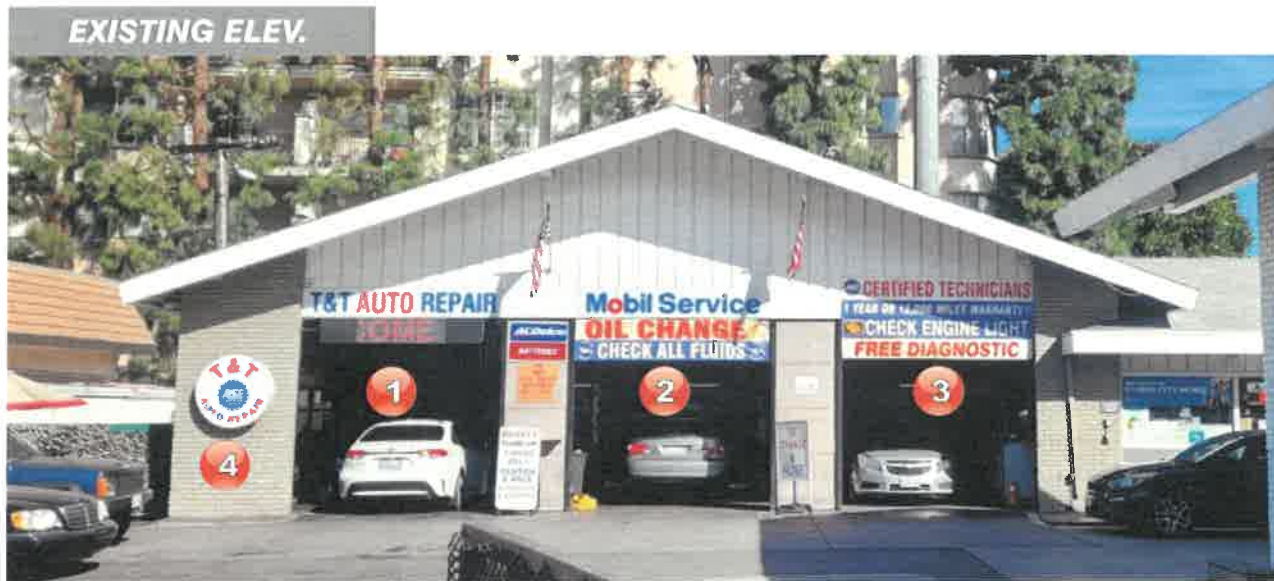
1 2 3 4 REMOVE EXISTING SIGN